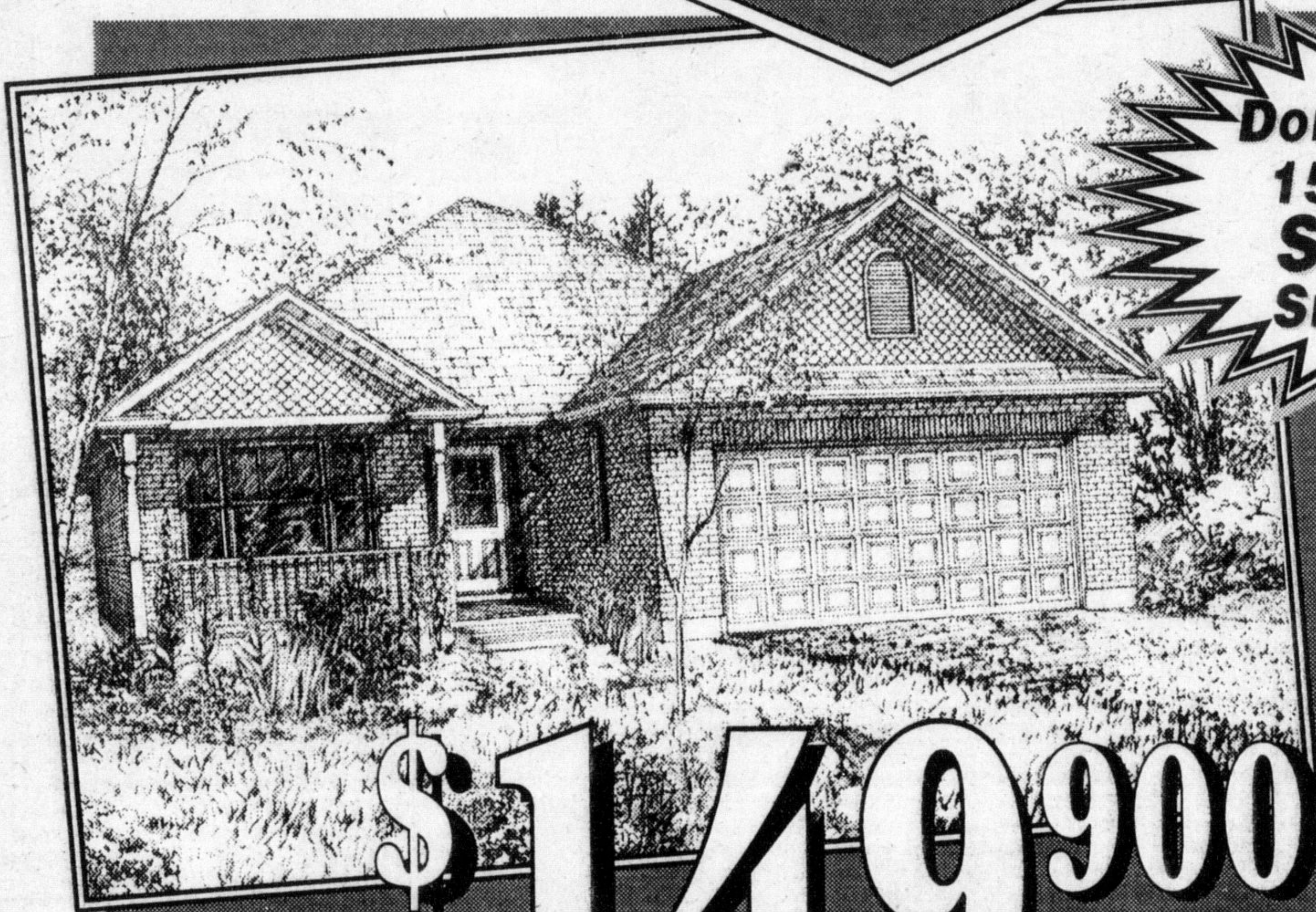
THE DOVE from $194,990