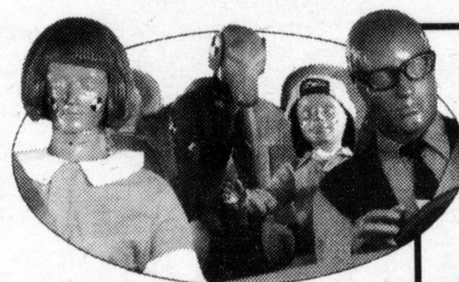
TV Crash Test Family

'98 Windstar. Recommended by people who know what safety's all about.