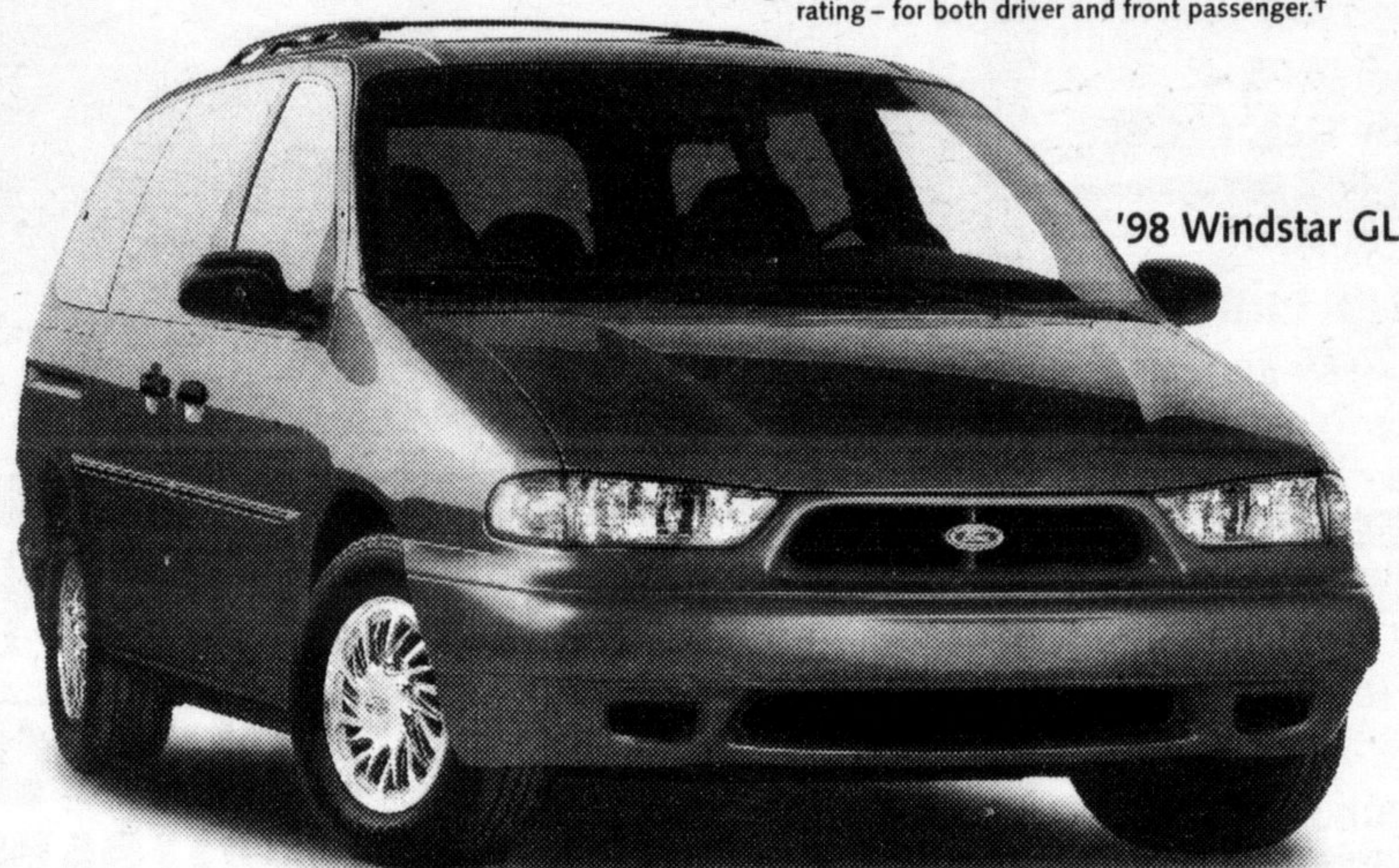
'98 Windstar GL

We put your family first: Windstar is the only minivan to earn five stars — the highest possible U.S. Government front-end crash test rating — for both driver and front passenger.*