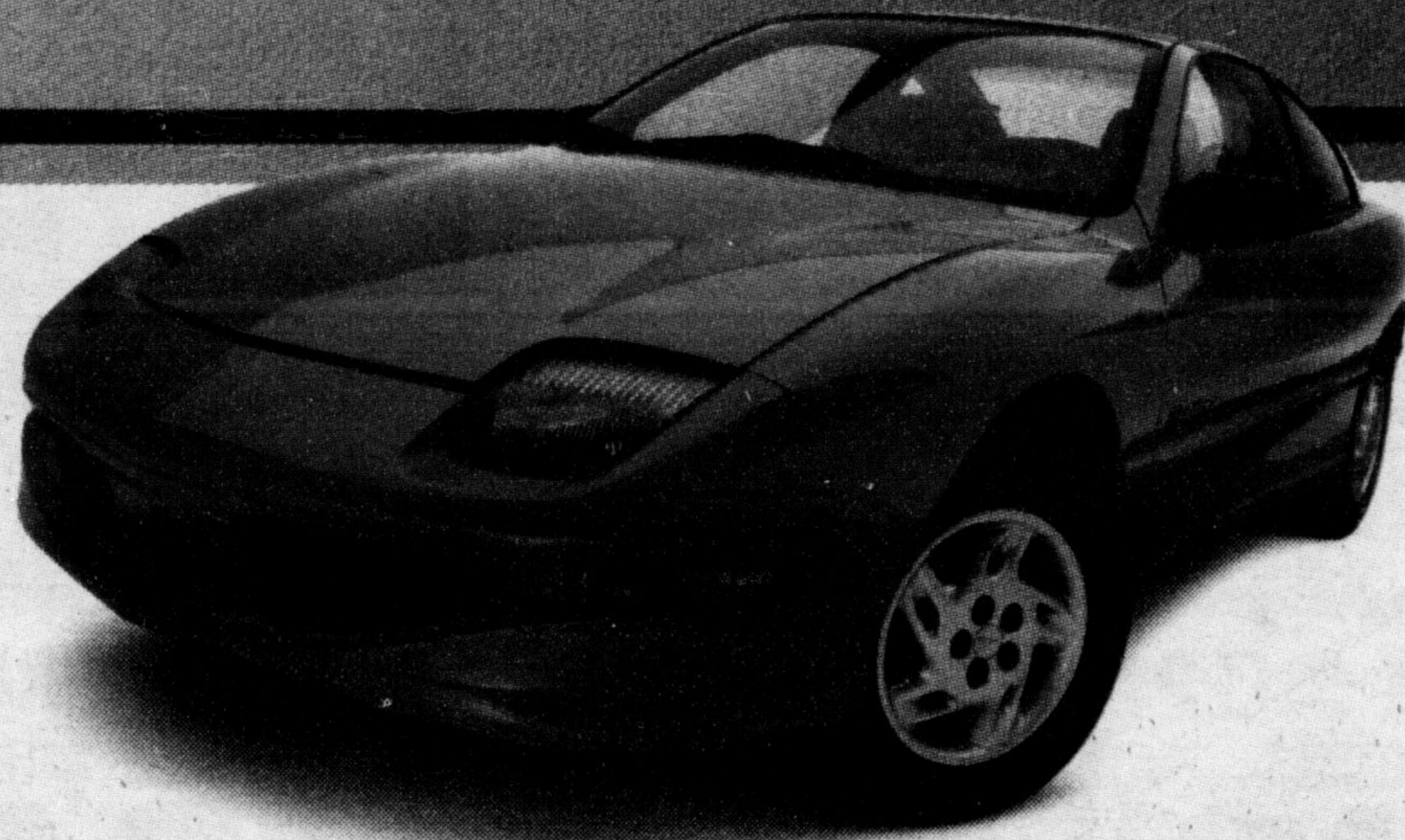
'98 Pontiac Sunfire Coupe

SMARTLEASE $0 DOWN gets you a 5-speed transmission, 2.2 litre engine, the PASSLock™ theft deterrent system, dual air bags, 4-wheel ABS, a rear spoiler, folding rear seat, reclining front bucket seats and tinted glass. Or get behind the wheel of a Sunfire GT for only $30 more a month.