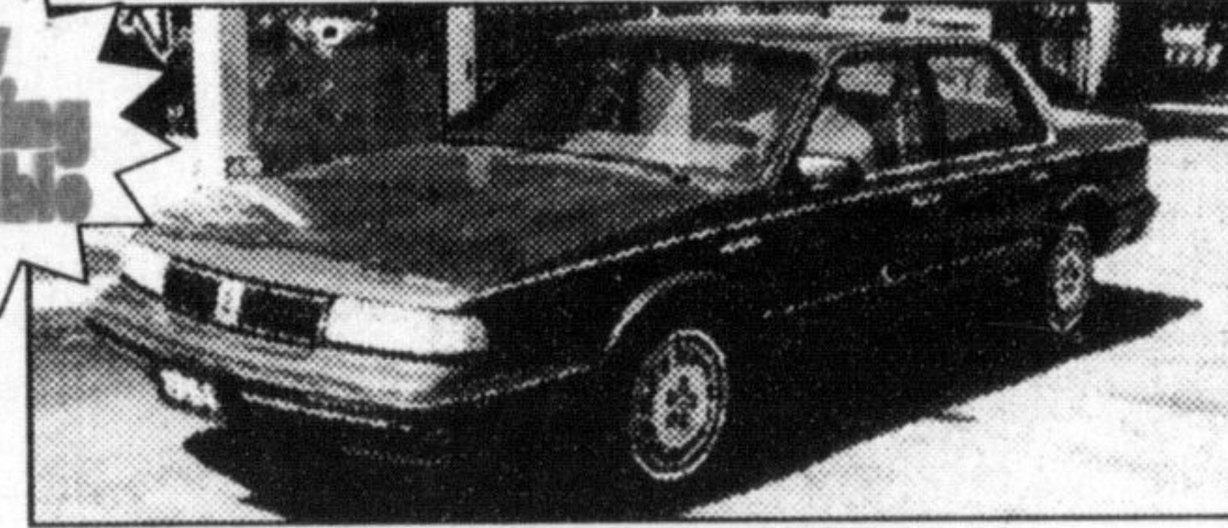
'94 OLDS CIERA

4 dr., V6, auto, air cond., AM/FM cassette, P. windows, P/D locks, tilt and cruise. Original paint and spotless condition. Stock # P1609.