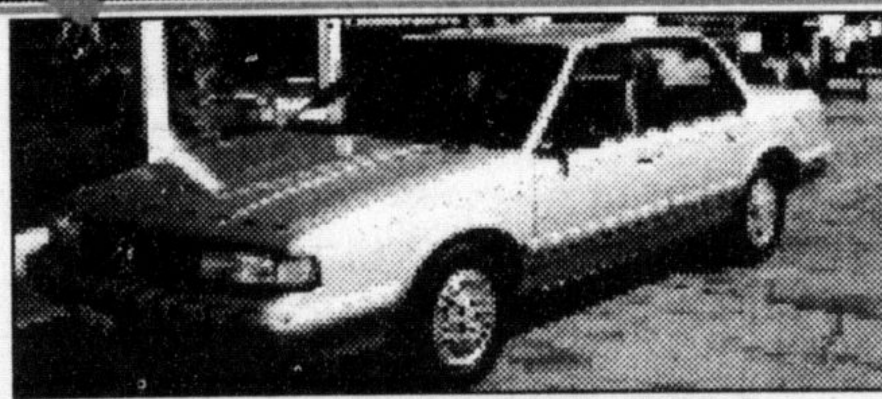
'96 OLDSMOBILE CIERA

4 dr., V6, auto., air, P.W., P.D.L., tilt, cruise, cassette, alum. wheels. Balance of factory warranty. Stock # P1567.