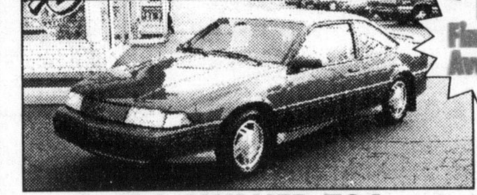
'94 CAVALIER Z24

Equipped with 3.1 V6 engine, auto trans., power windows, locks, tilt wheel, cruise control, AM/FM stereo cassette, air conditioning & sunroof. Only 59,000 kms. Stk #P1636