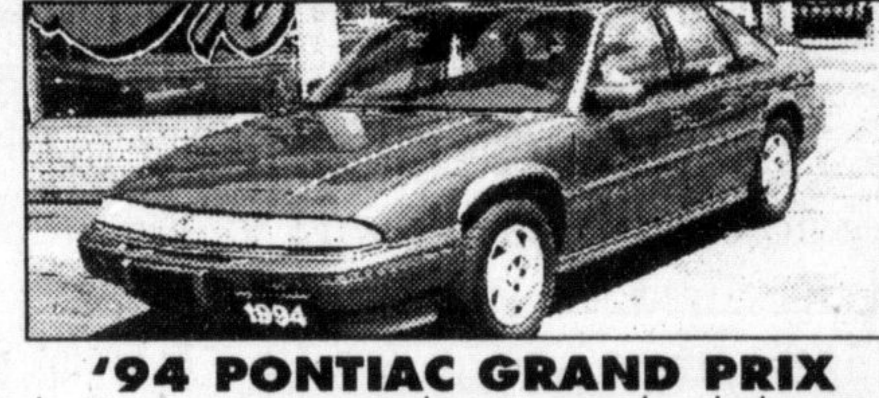
'94 PONTIAC GRAND PRIX

4 dr., V6, auto, power windows, power door locks, air conditioning, AM/FM cass. Only 61,000 km. Stock #P1624