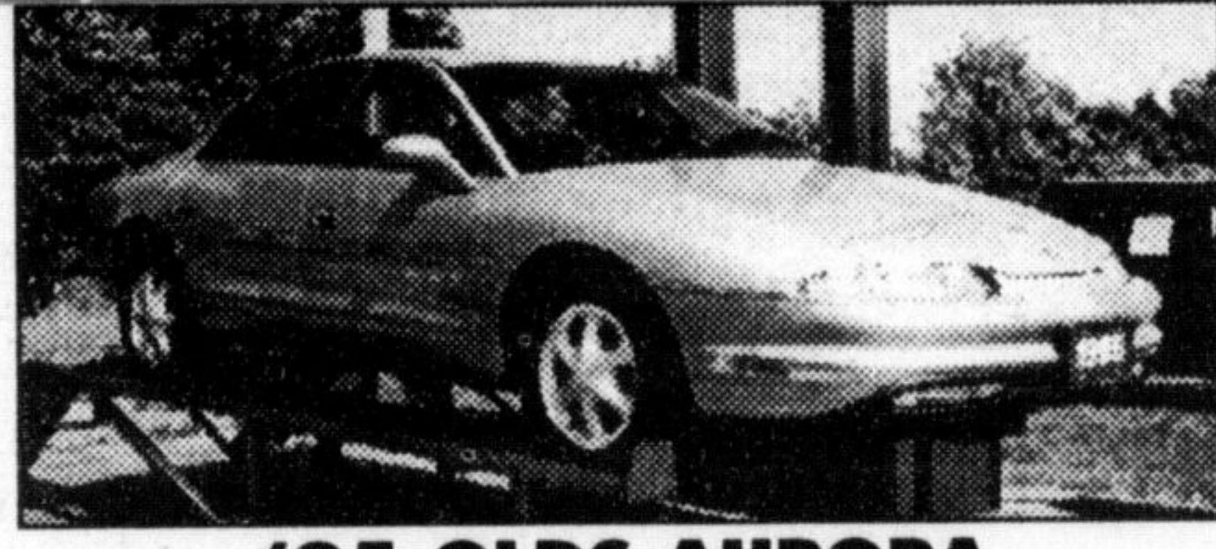
'95 OLDS AURORA

4 dr., all the options including CD player, sunroof and leather interior. Balance of factory warranty. Stock # P1615.