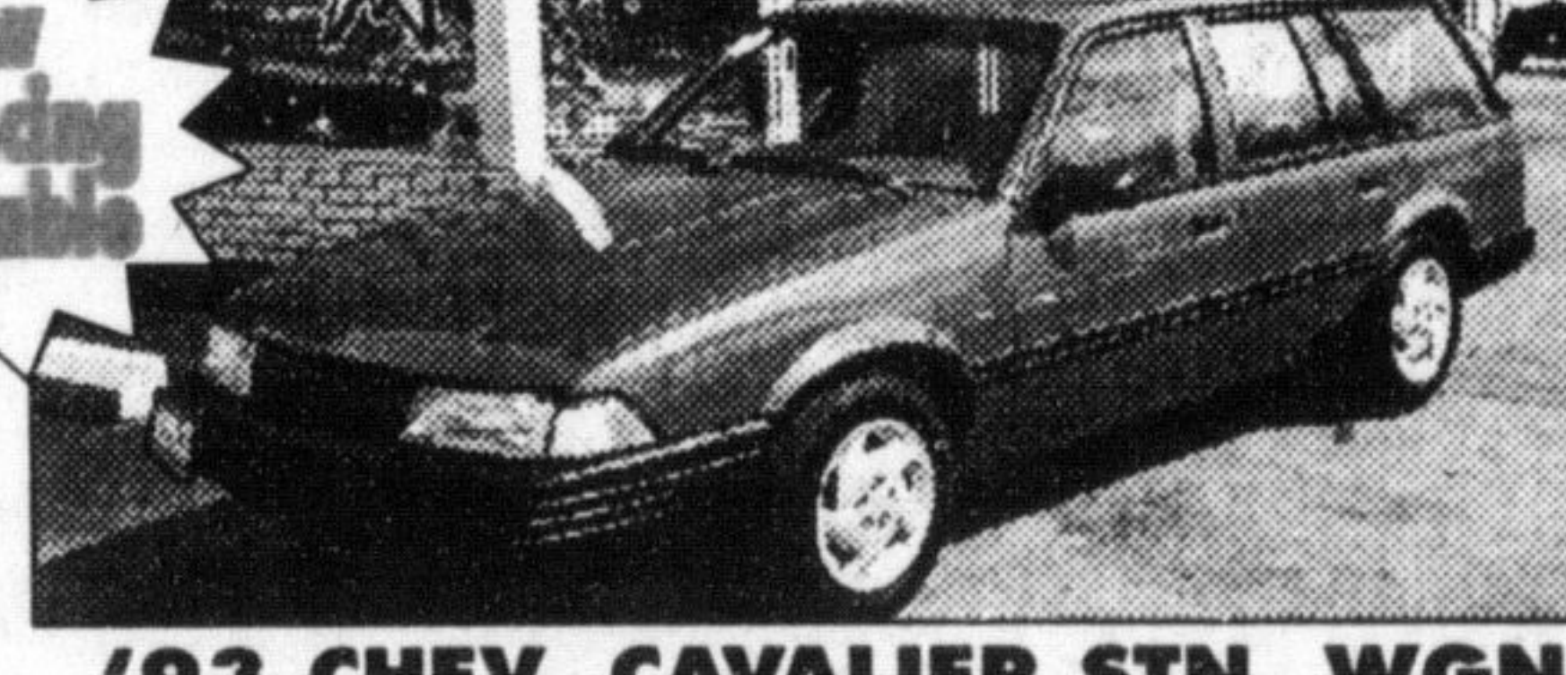
'93 CHEV. CAVALIER STN. WGN.

Auto., Air conditioned, Am/FM cassette, P.D.L. One owner since new. Very scarce model. Stock # 8824A