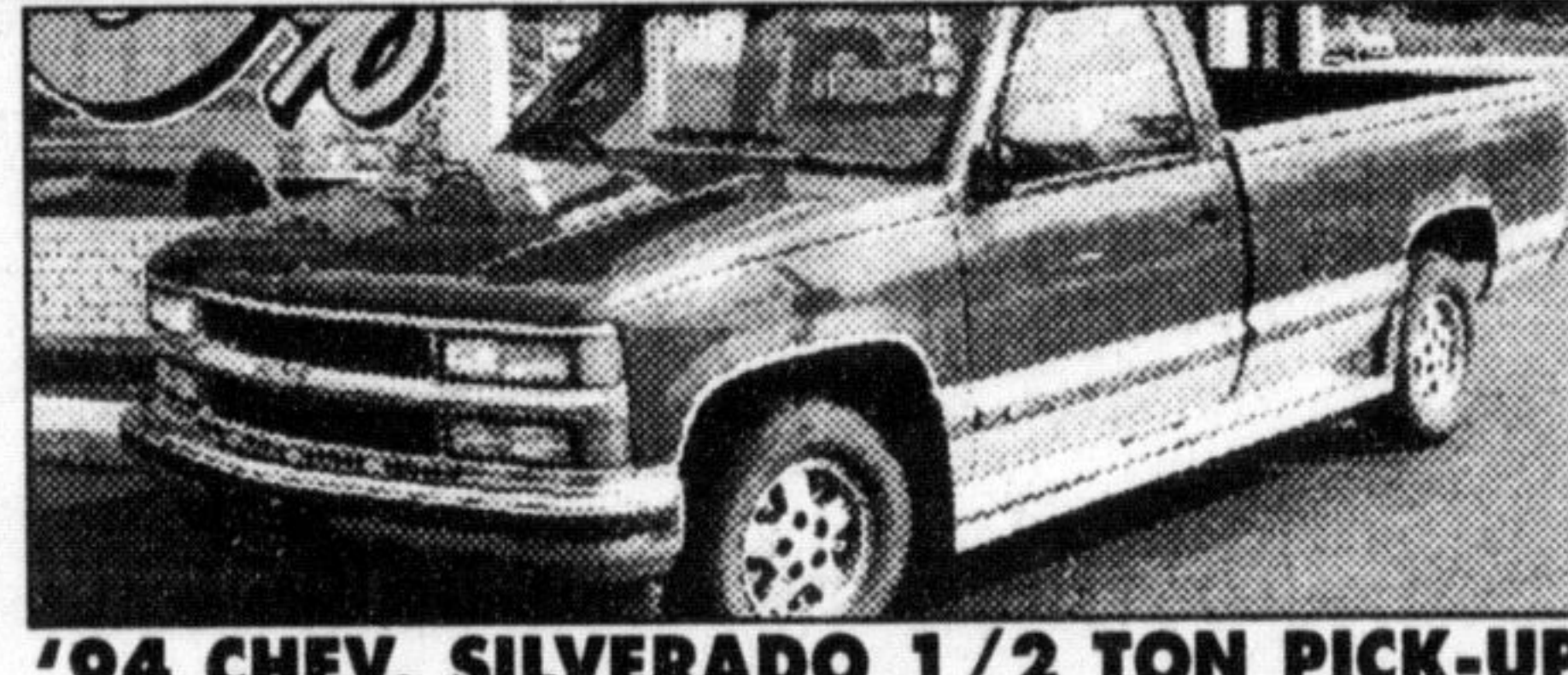
'94 CHEV. SILVERADO 1/2 TON PICK-UP

Equipped with V8 engine, automatic trans., power windows & locks, tilt wheel & cruise control, AM/FM stereo cassette, air conditioning & running boards. Only 33,000 kms. Stock #P1637.