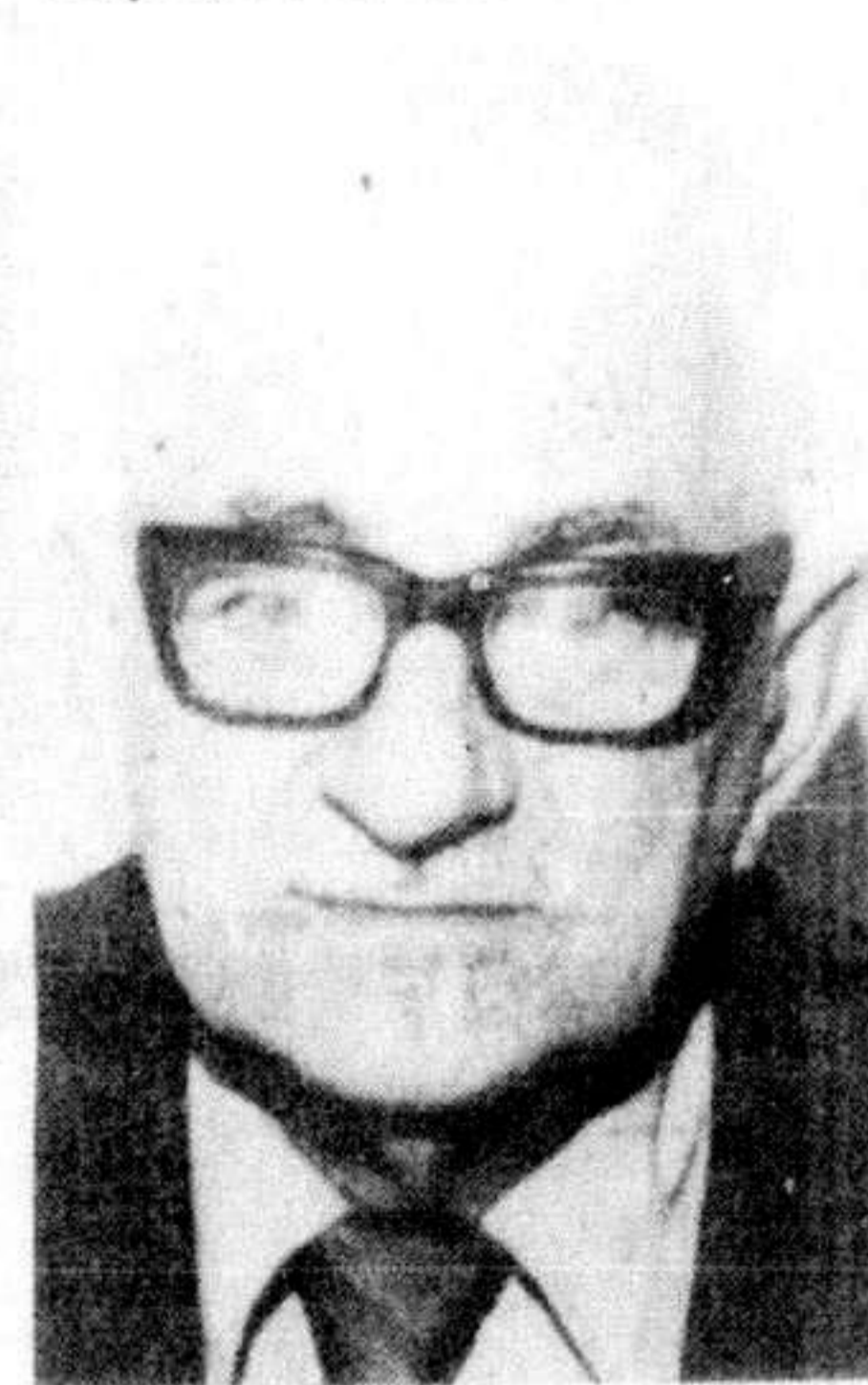
ROSS PEAREN Former Mayor dies