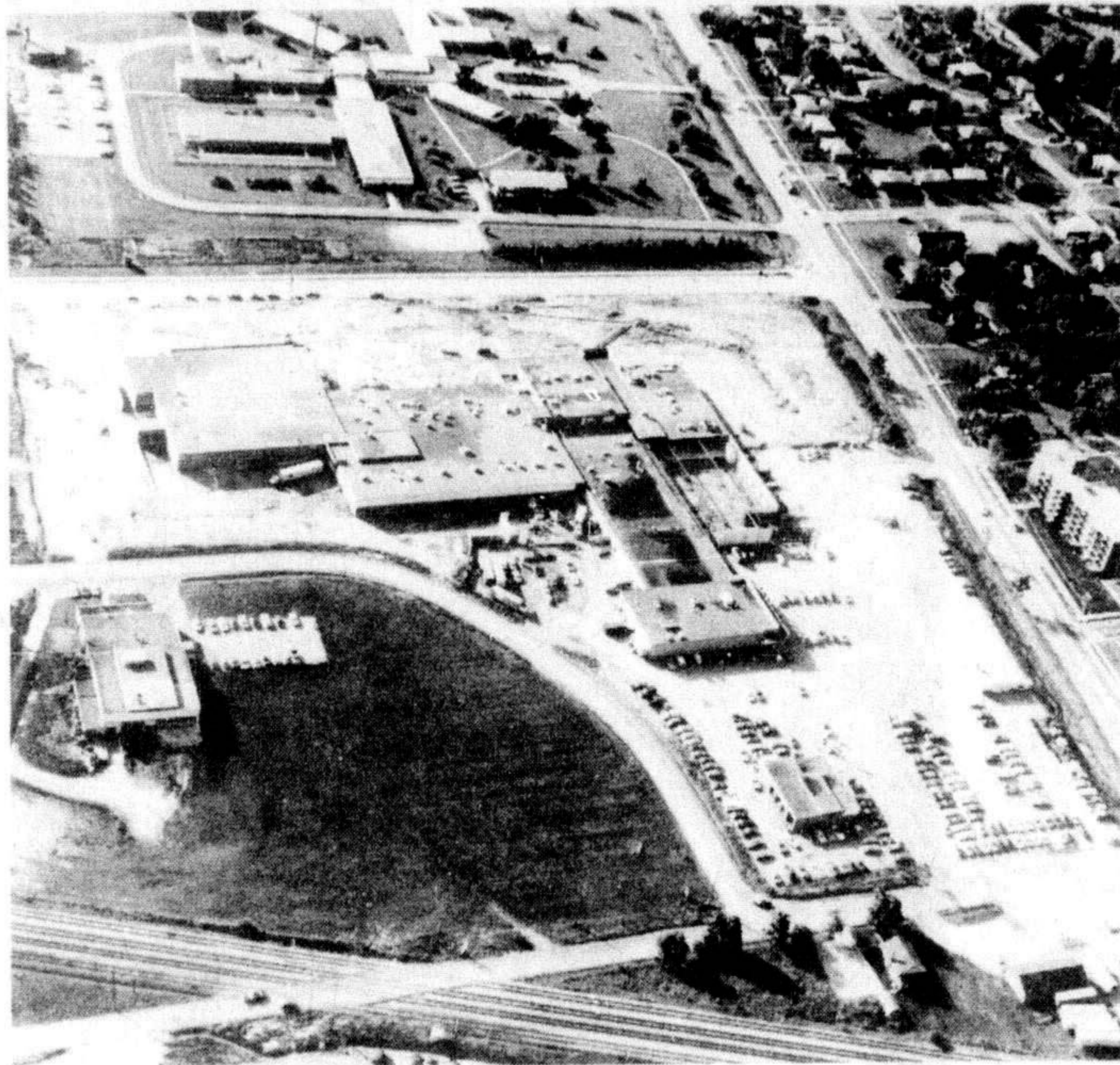
MILTON MALL made news this year when the first phase of a $2,500,000 expansion program was completed and a new Loblaws supermarket plus a bank and half a dozen other stores opened to serve the public.

NOVEMBER Halton Regional Council chose Oakville as its choice for a headquarters site. The land has not yet been purchased and according to recent speeches by Burlington members of the council, it should not be bought until the region is ready to build on it. Some councillors have suggested Burlington Councillors are still working behind the scenes to make Burlington the future home of the regional headquarters.