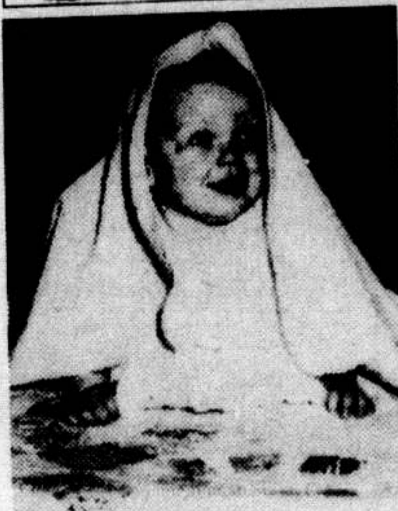
I PLAN TO HIDE HERE 'TIL SANTA COMES.

POSADAS It is customary in Mexico to have nine continuous days of what is called posadas, which are nine parties, one each night preceding Christmas. People dance at those parties and are given a small present by the host. It may be porcelain, with candy inside, or simply a small candy package wrapped in crepe paper. Mexicans have their Christmas dinner on Christmas Eve and not Christmas Day, usually after ten o'clock at night.