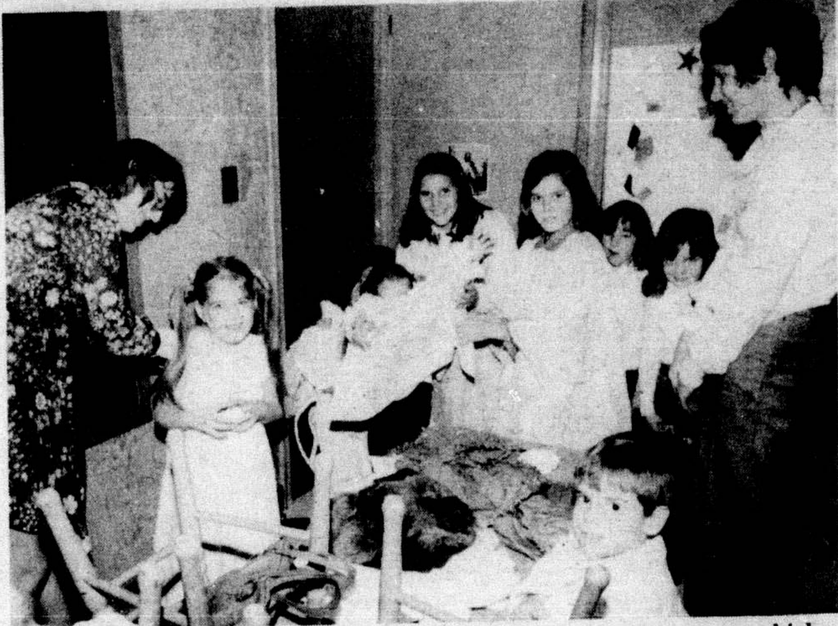
CHILDREN HURRY to dress up as animals for the nativity scene which was part of a special service Sunday night at Boston Presbyterian Church.

What about some token of love — What about love itself . . . and friendship . . . and understanding . . . and a helping hand . . . a smile . . . a prayer and consideration? You can't buy these things in any store, and these are the very things people need. Let's not permit the crowds and the rush to crowd Christmas out of our hearts . . . for that is where it belongs. Christmas is not in the stores — but in the hearts of people.