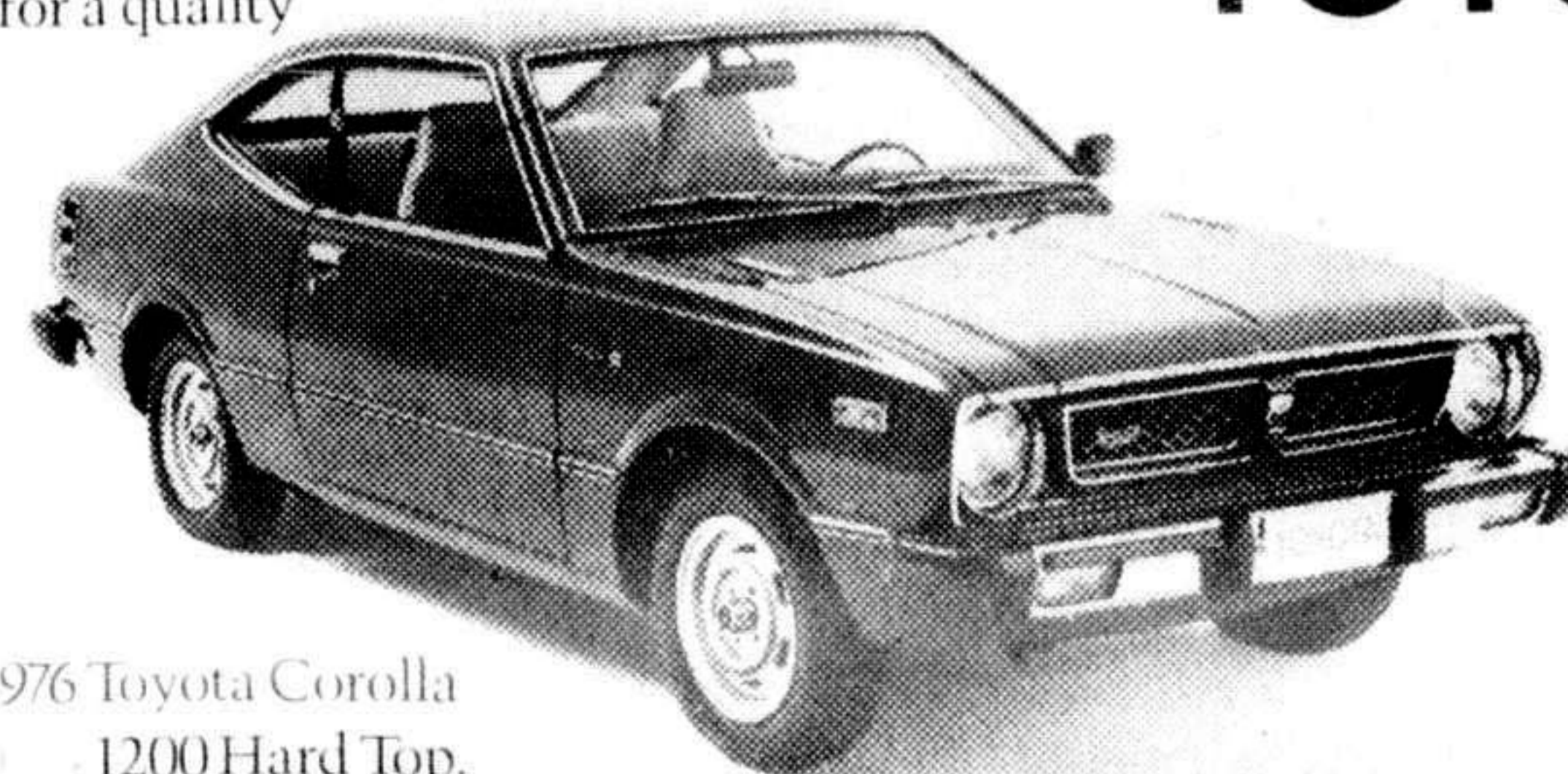
1976 Toyota Corolla 1200 Hard Top.