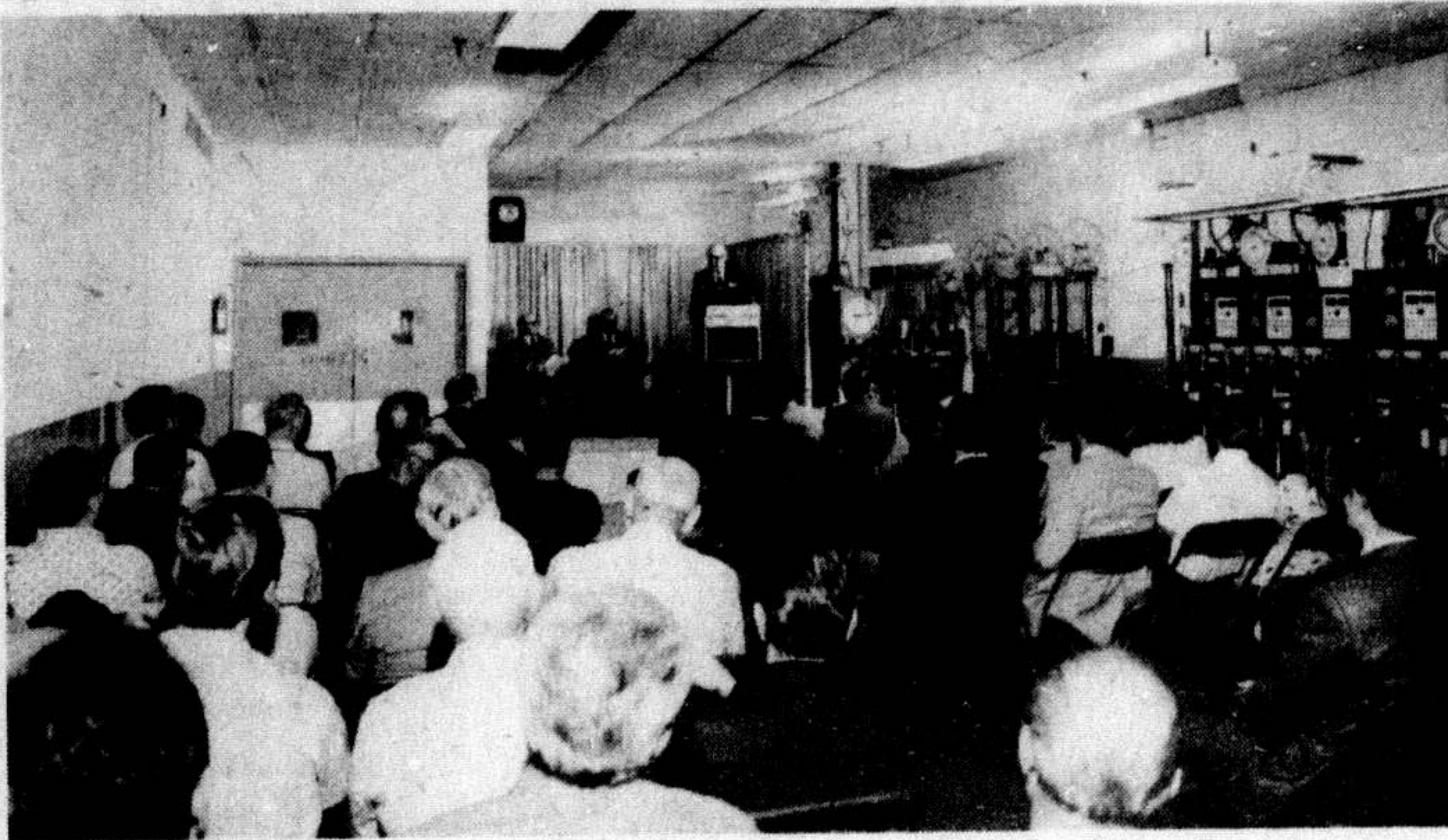
METER COMPANY employees gather for the Thursday awards presentation ceremony. Employees with from five to 20 years of service were honored at an on-the-job presentation; 25-year guild members were treated to a dinner that evening.