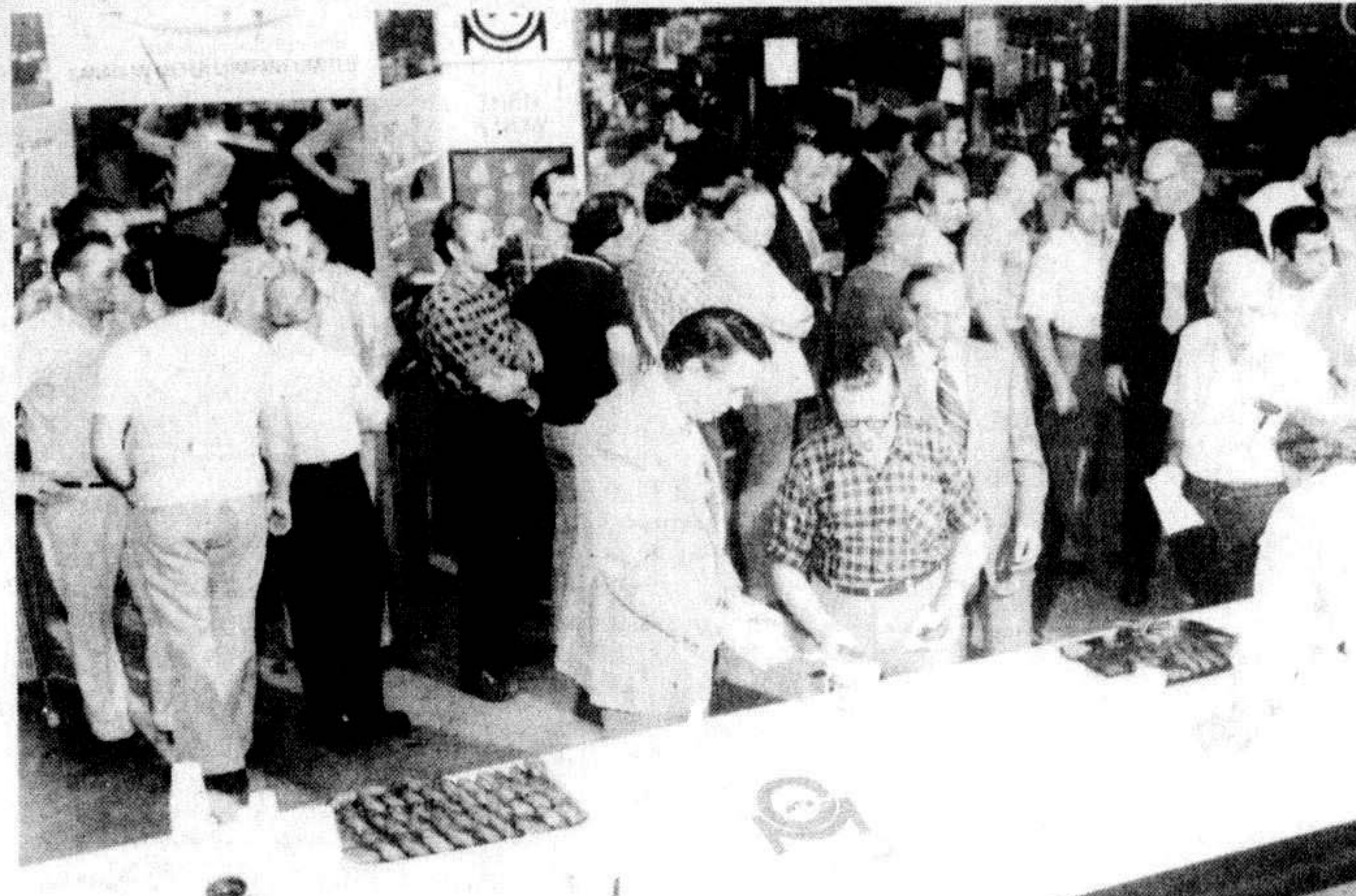
A BIRTHDAY CAKE signifying the company's 75th anniversary was displayed at the long-service awards presentation Thursday at Canadian Meter.