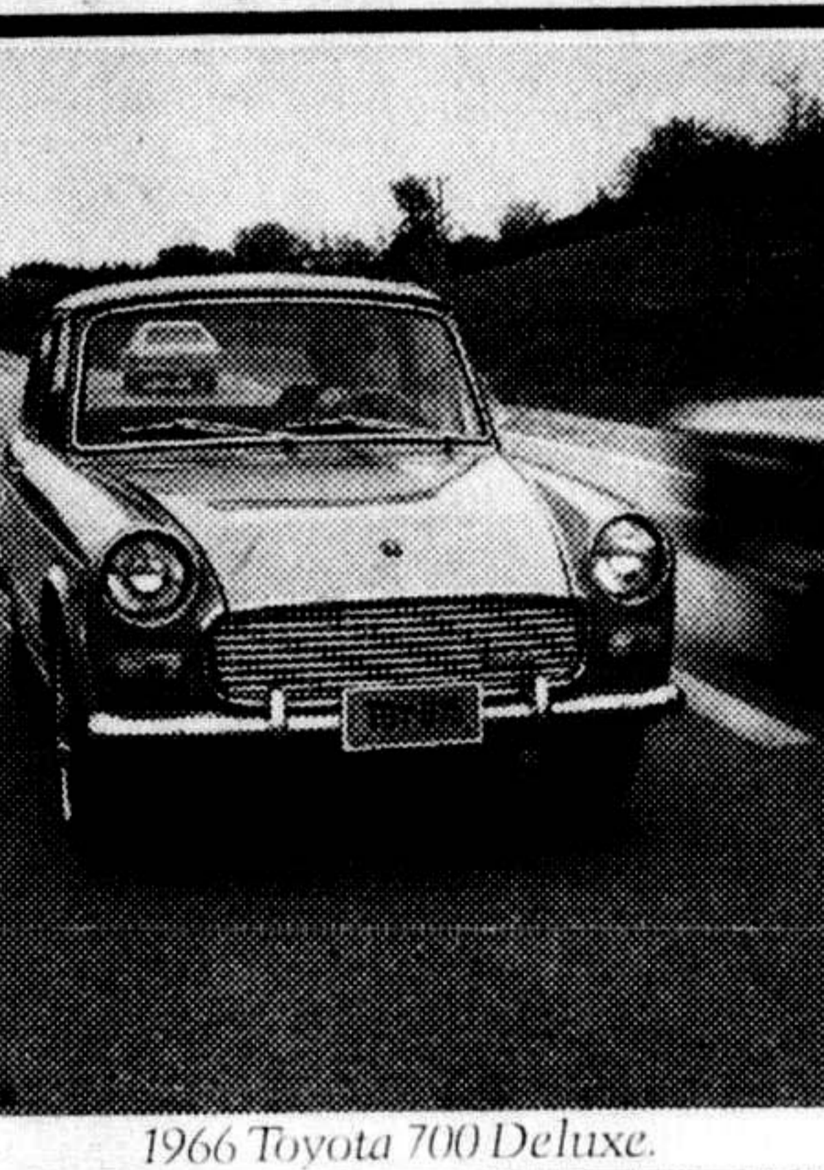
1966 Toyota 700 Deluxe.

Driving the number of miles I do in a year, I am naturally interested in economy. My Corolla provides great mileage while giving a ride which is more comfortable than many standard size cars I have driven. ...having reached 106,000 miles without problems, I should thank you for a quality