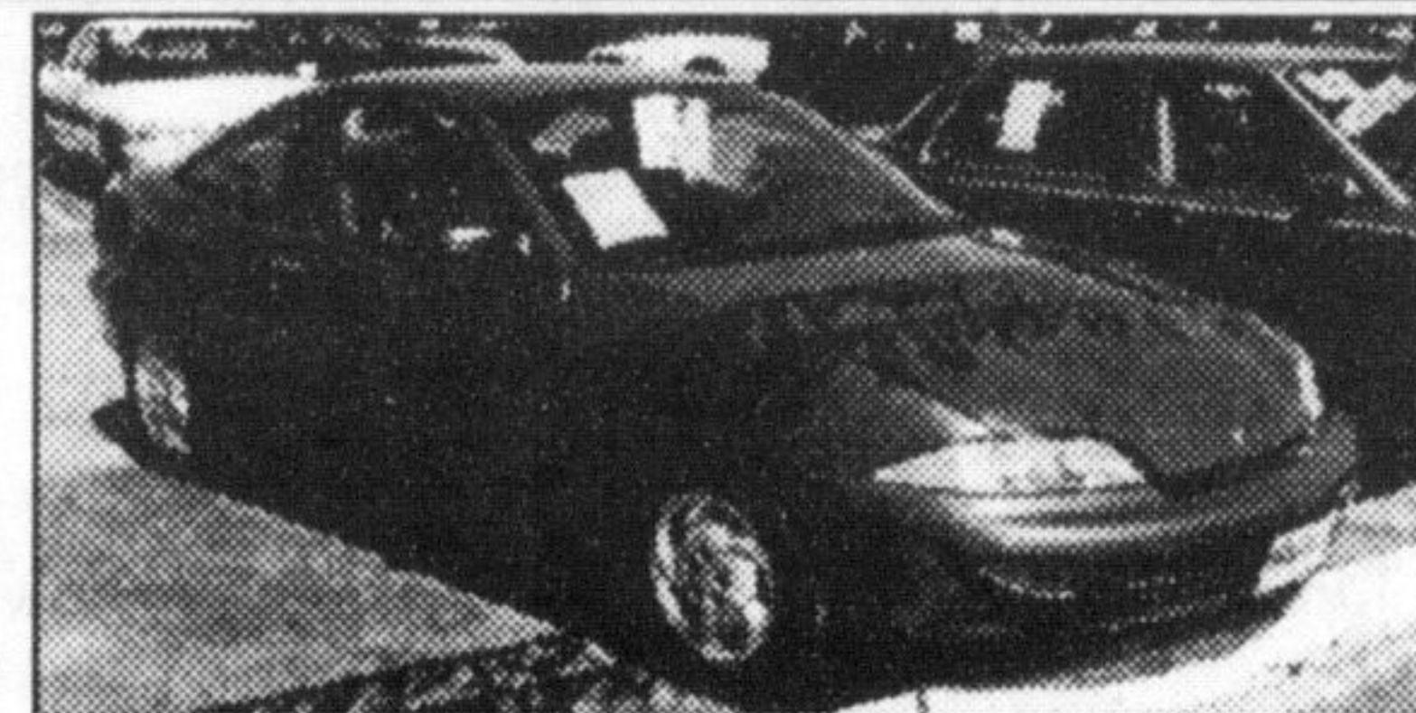
1996 CAVALIER Green/grey cloth, auto., air conditioning, AM/FM stereo cassette. Balance of Factory Warranty. Only 40,000 kms. Only $13,877