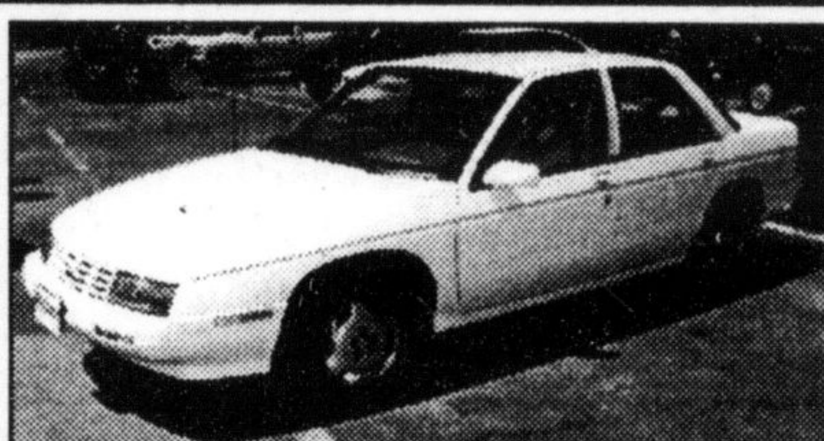
1996 CORSICA White/Grey cloth. V6, auto., air, P. Locks, AM/FM stereo cassette. Balance of factory warranty. Only 27,000 kms. Only $14,990.