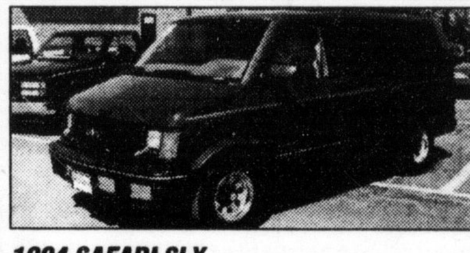
1994 SAFARI SLX One owner, burgundy/burgundy cloth, 8 passenger, air conditioned, P.D.L., tilt, cruise, cassette, deep tint, rally wheels, only 52,000 kms. Only $15,995