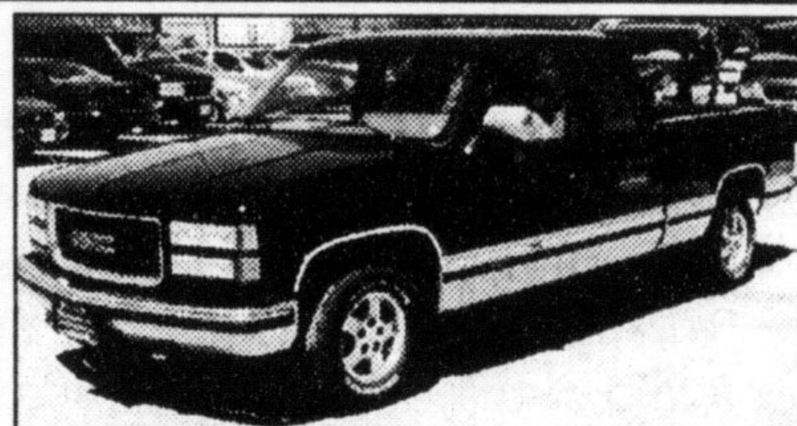
1994 GMC 1500 SLE EXT Black/grey buckets, V8, auto, air, P.W., P. locks, tilt, cruise, console, cassette, bedliner, alloy wheels. Only 77,000 kms. Only $18,888

*SALE PRICES ARE PLUS TAXES. SEE DEALER FOR DETAILS. *LEASE BASED ON $2,000 DOWN + APPLICABLE TAXES, 1ST MONTH, SECURITY DEPOSIT & LICENCE. ALWAYS MORE TO CHOOSE FROM "WE WARRANTY & SERVICE WHAT WE SELL"