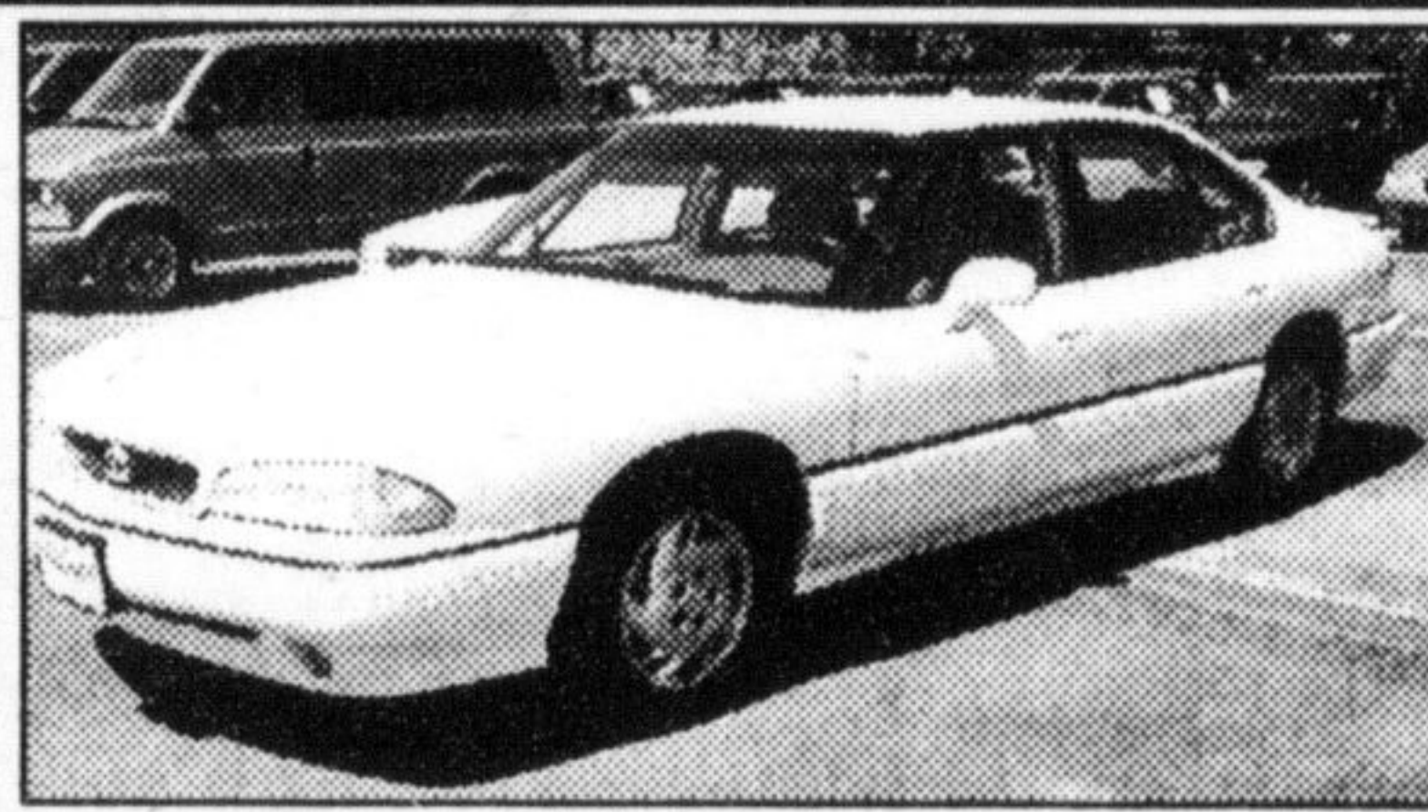
1995 BONNEVILLE SE White/Taupe cloth. V6, Auto, Air, P.W., P. Lks., Tilt, Cruise, Cassette, Alloy Wheels. Only 59,000 kms $18,888 Lease for $320/36 mo.