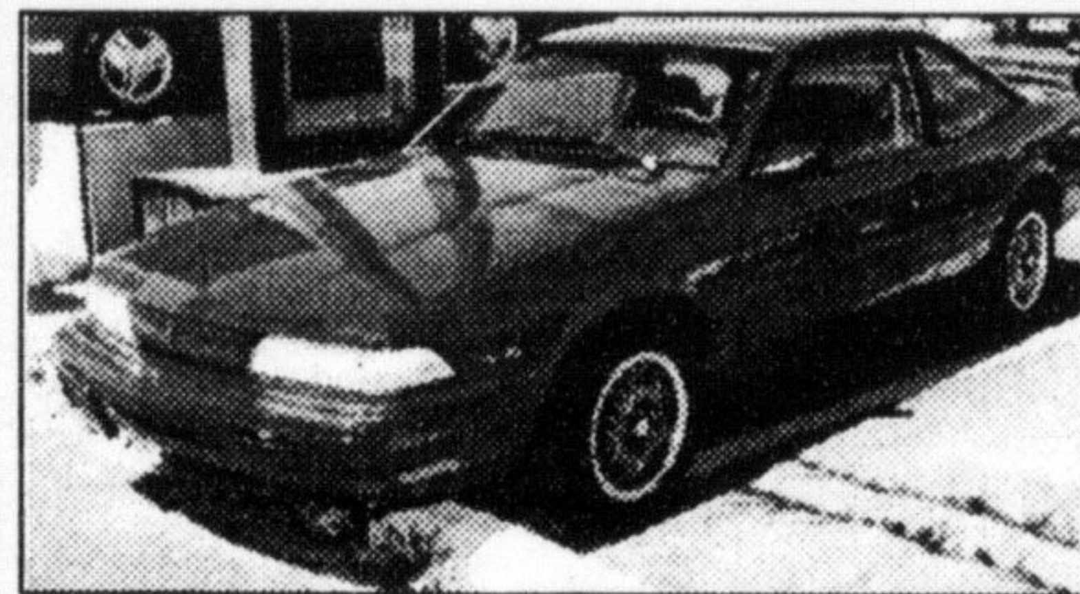
1994 SUNBIRD Red/Graphite cloth. V6, auto., air, p. locks, AM/FM, stereo cassette. Only 60,000 kms. Only $10,844