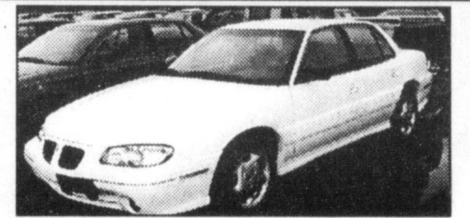
1996 GRAND AM SE 4 dr., white on grey, pwr locks, automatic, air conditioning, AM/FM cass., only 25,300 kms. Balance of Factory Warranty. Only $14,788