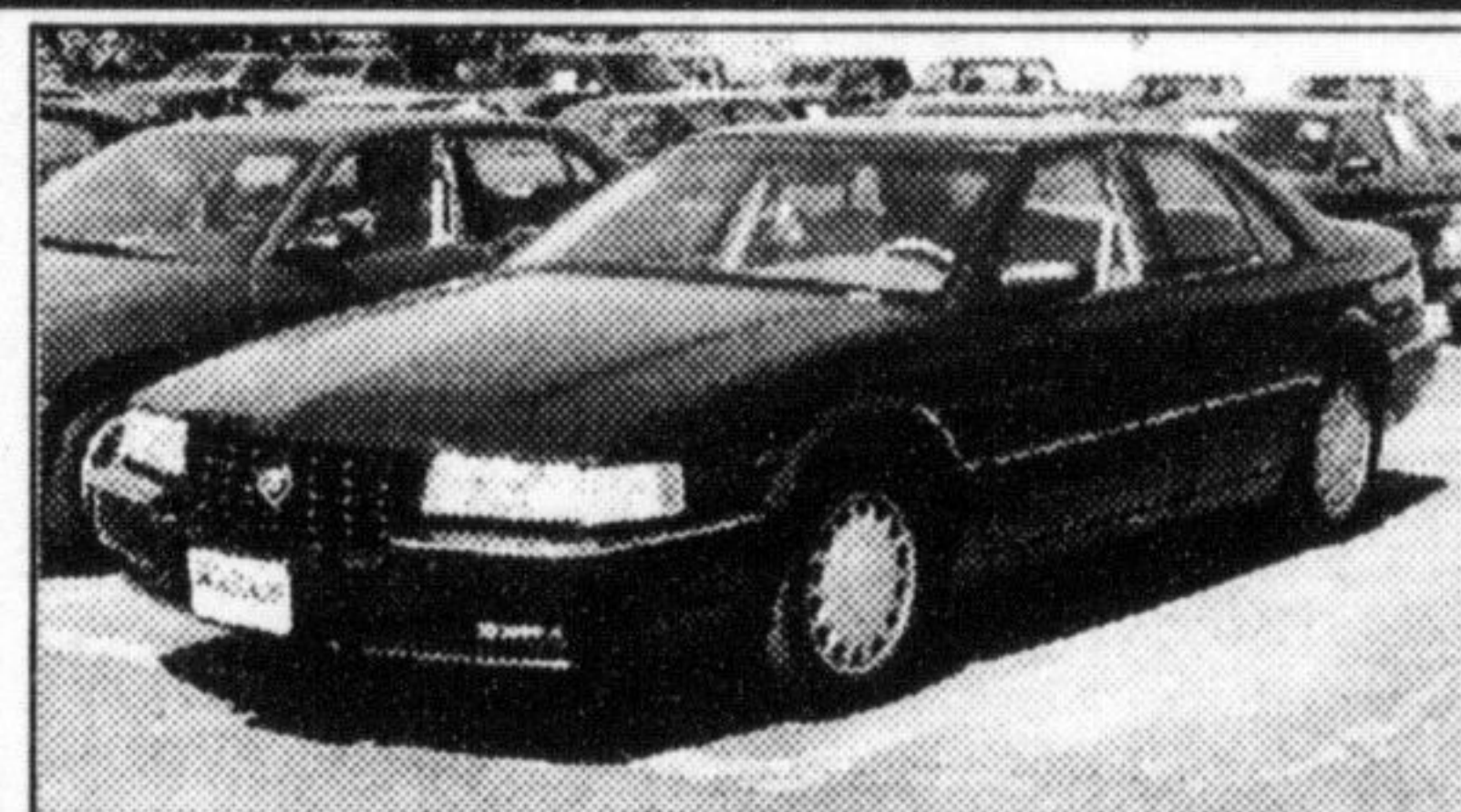
1994 CADILLAC SEVILLE STS Green/Tan Leather. Fully Loaded. Only 68,000 kms. Only $28,877