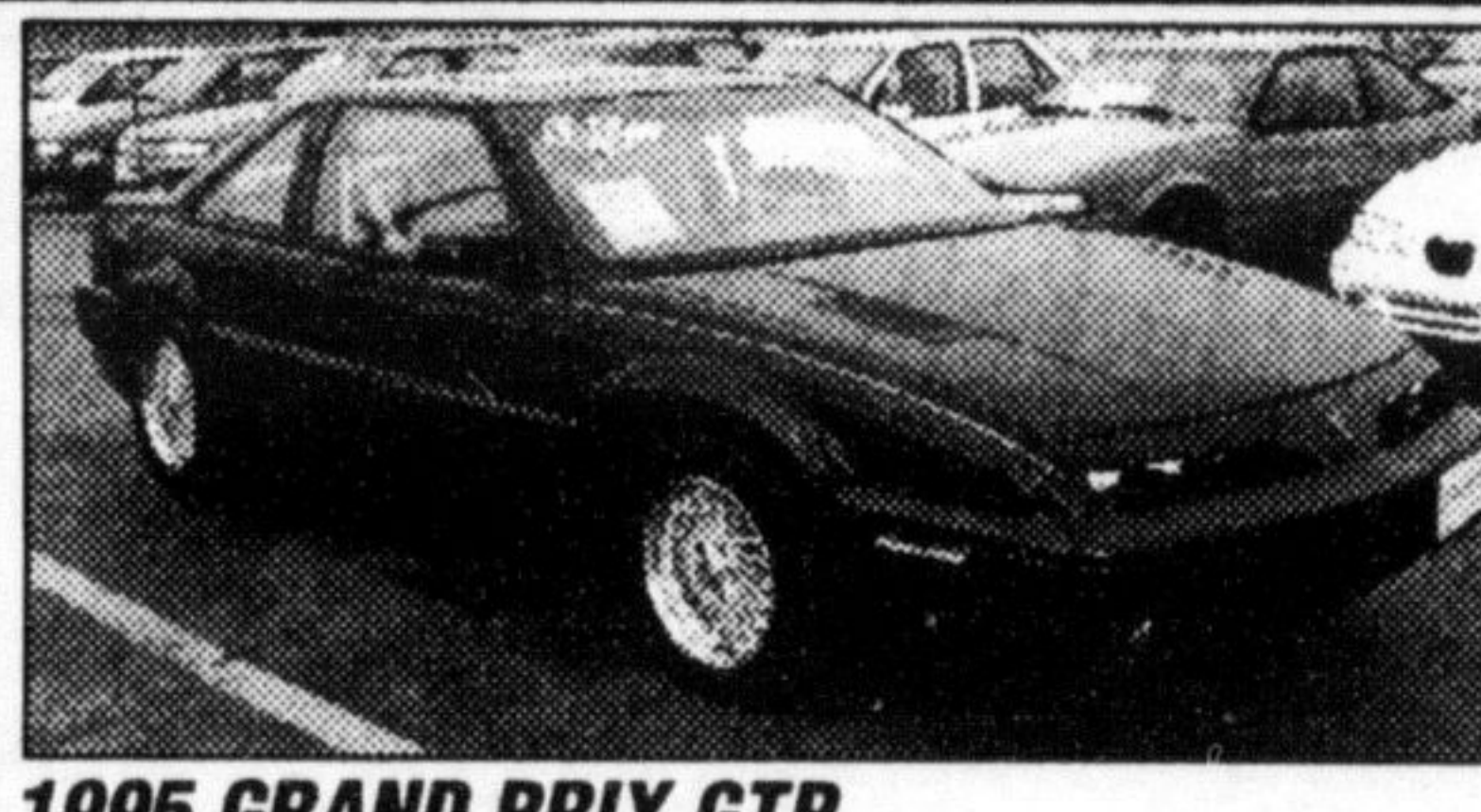
1995 GRAND PRIX GTP Black/grey cloth, V6, auto, power window & locks, tilt, cruise, power moonroof, cassette, alloy wheels. Balance of factory warranty. Only 41,000 kms. Only $21,788