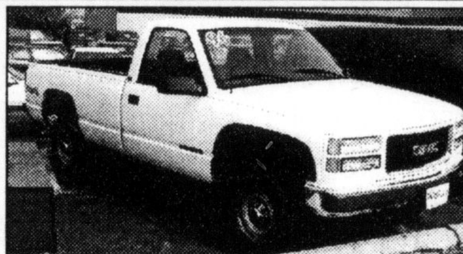
1996 C2500 PICK-UP White/blue cloth, V8, auto, air cond., box liner, AM/FM cassette. Balance of factory warranty. Only 10,000 kms. Only $25,888