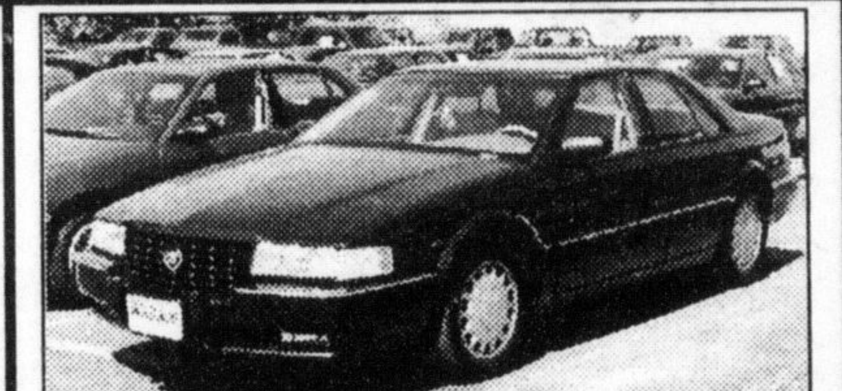
1994 CADILLAC SEVILLE STS Green/Tan Leather. Fully Loaded. Only 68,000 kms. Only $28,877