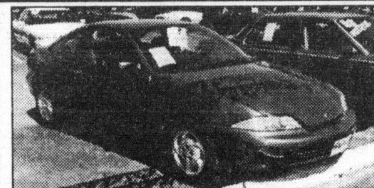
1996 CAVALIER Green/grey cloth, auto., air conditioning, AM/FM stereo cassette. Balance of Factory Warranty. Only 40,000 kms. Only $13,877