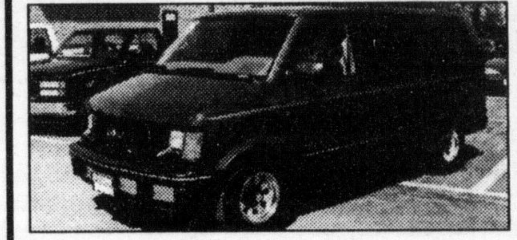
1994 SAFARI SLX One owner, burgundy/burgundy cloth, 8 passenger, air conditioned, P.D.L., tilt, cruise, cassette, deep tint, rally wheels, only 52,000 kms. Only $15,995