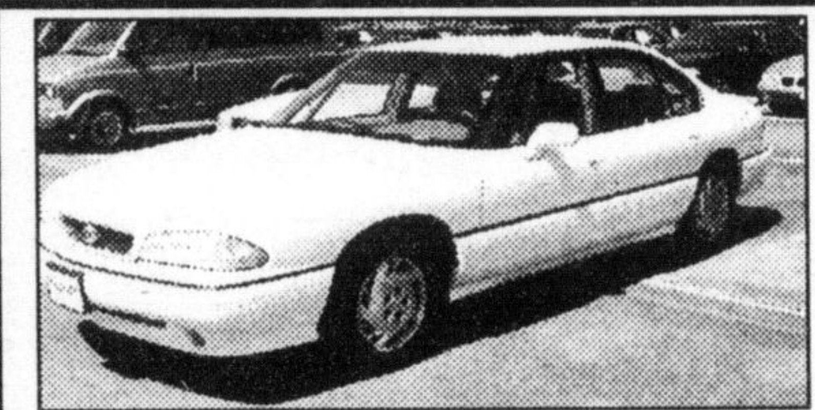
1995 BONNEVILLE SE White/Taupe cloth, V6, Auto, Air, P.W., P. Lks., Tilt, Cruise, Cassette, Alloy Wheels. Only 59,000 kms. $18,888 Lease for $320/36 mo.