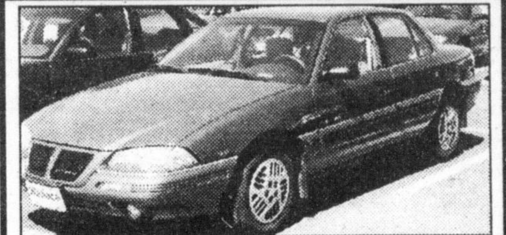
1993 GRAND AM One owner, Blue/Grey cloth, V6, Auto, Air Conditioning, P. Locks. Only 65,000 kms. Only $11,877