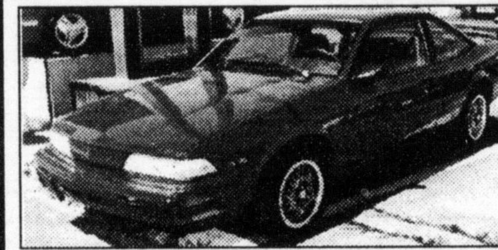
1994 SUNBIRD Red/Graphite cloth, V6, auto., air, p. locks, AM/FM, stereo cassette. Only 60,000 kms. Only $10,844