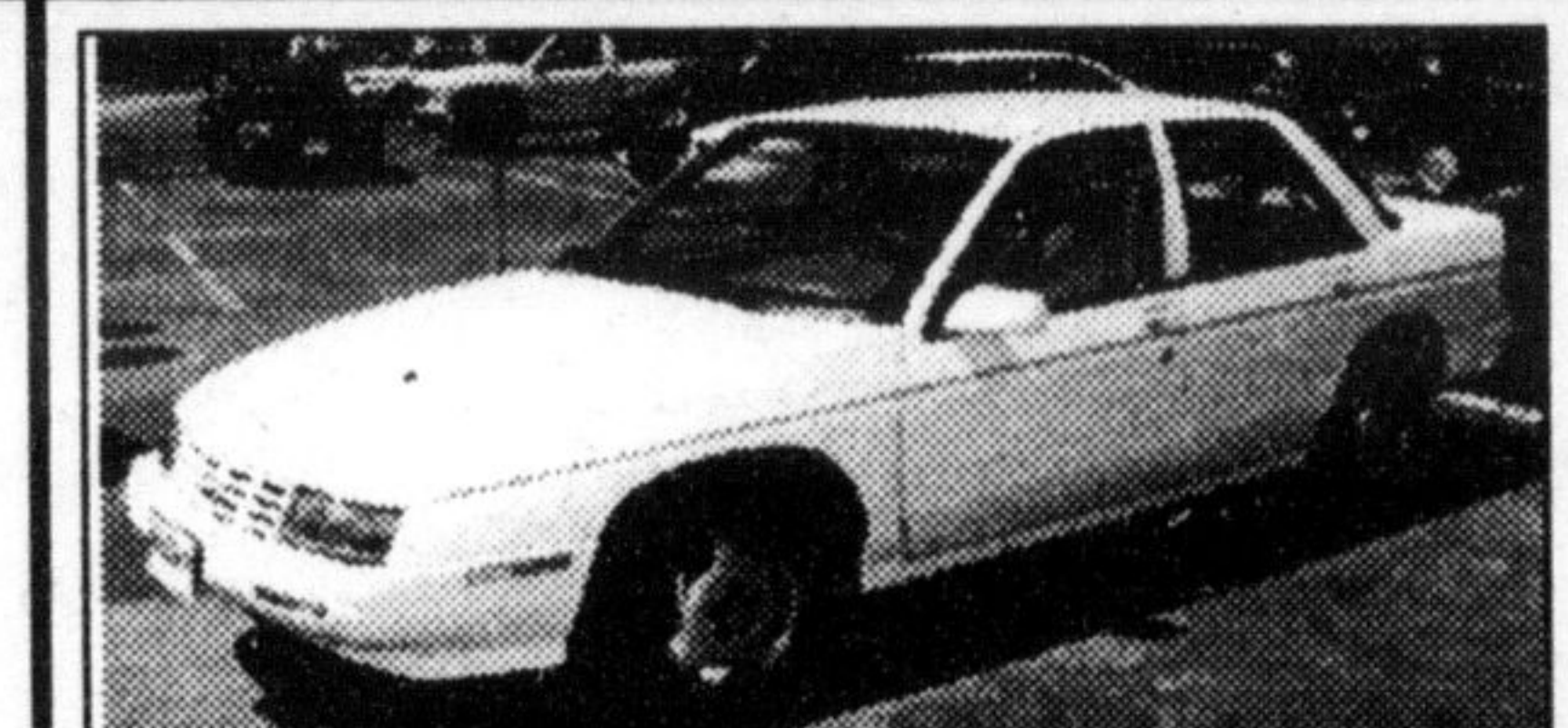
1996 CORSICA White/Grey cloth, V6, auto., air, P. Locks, AM/FM stereo cassette, Balance of factory warranty. Only 27,000 kms. Only $14,990.