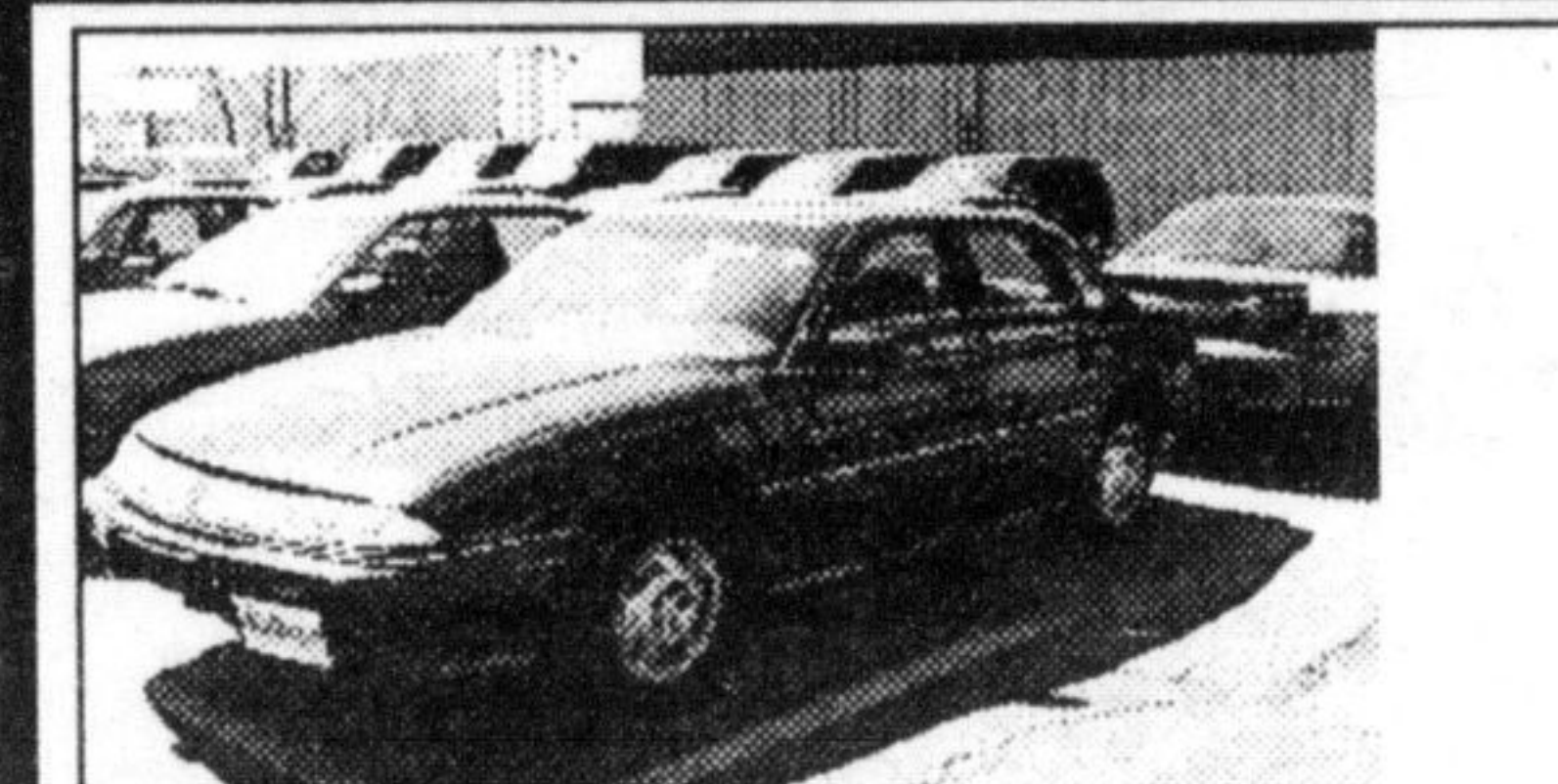
1996 GRAND PRIX Green/grey cloth, V6, auto, air, p. windows, p. locks, tilt, cruise, cassette, balance of factory warranty. Only 37,000 km. Only $18,788