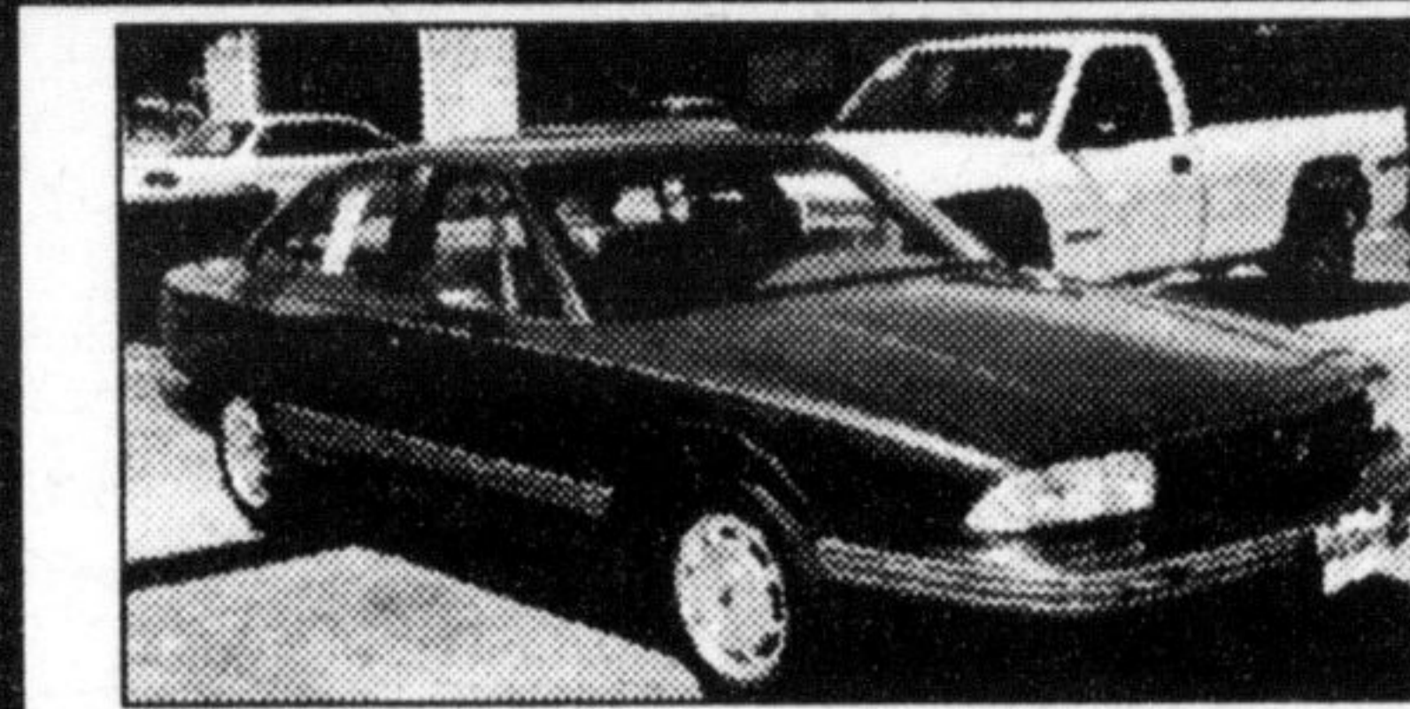
1995 DELTA 88 Amethyst/Grey cloth, V6, auto., air, P.W., P. L., Pwr. seat, cassette. Balance of factory warranty. Only 43,000 kms. Only $19,766