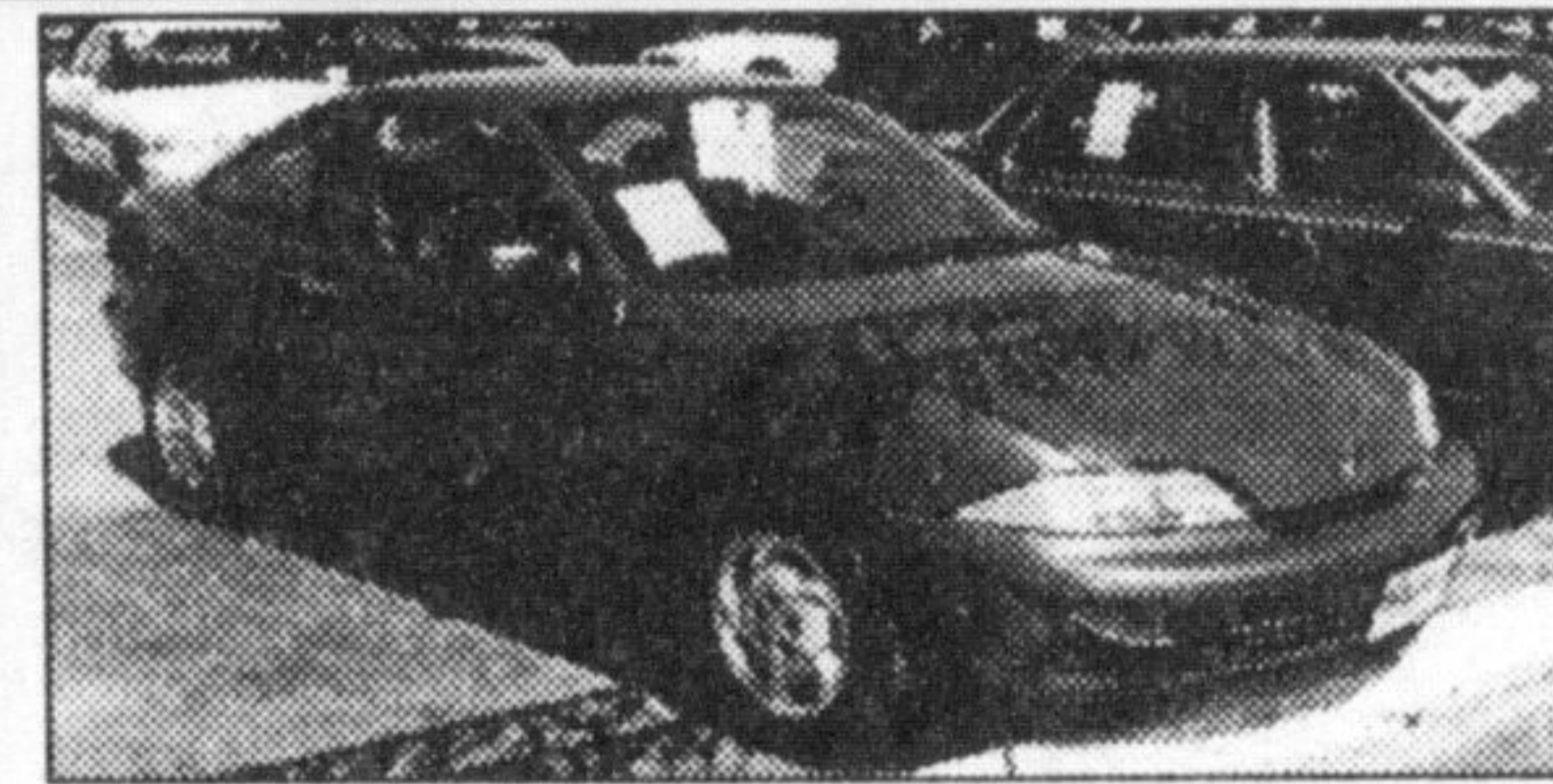
1996 CAVALIER Green/grey cloth, auto., air conditioning, AM/FM stereo cassette. Balance of Factory Warranty. Only 40,000 kms. Only $13,877