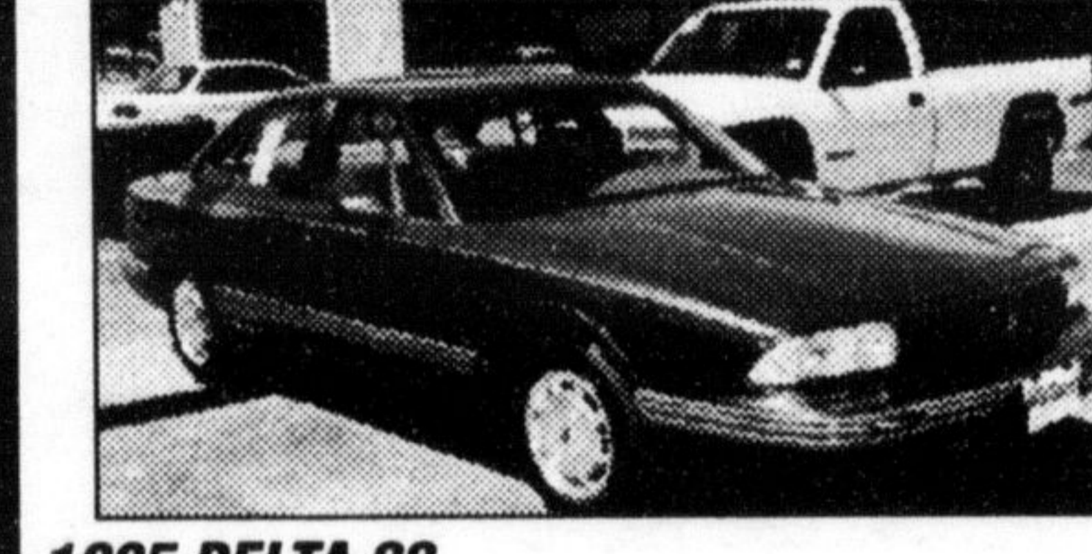
1995 DELTA 88 Amethyst/Grey cloth, V6, auto., air, P.W., P. L., Pwr. seat, cassette. Balance of factory warranty. Only 43,000 kms. Only $19,766