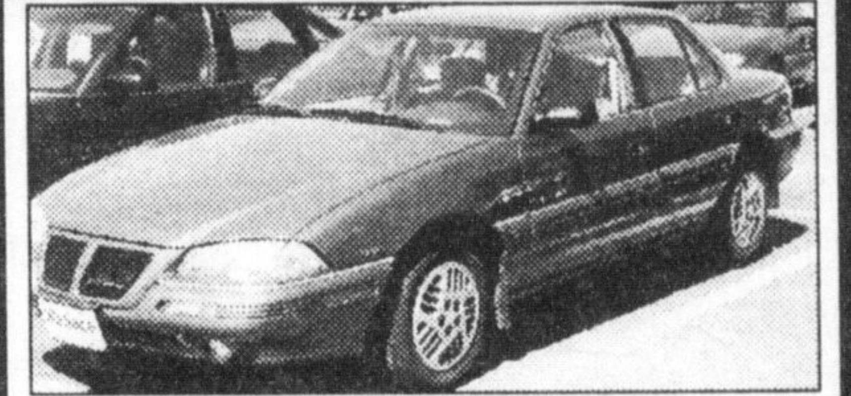
1993 GRAND AM One owner, Blue/Grey cloth, V6, Auto, Air Conditioning, P. Locks. Only 65,000 kms. Only $11,877