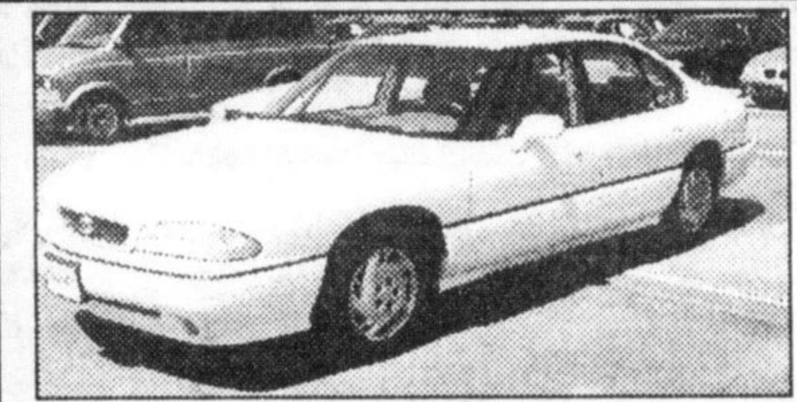
1995 BONNEVILLE SE White/Taupe cloth, V6, Auto, Air, P.W., P. Lks., Tilt, Cruise, Cassette, Alloy Wheels. Only 59,000 kms $18,888 Lease for $320/36 mo.