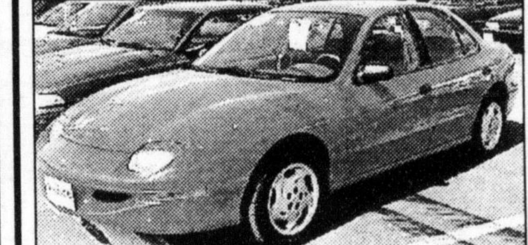
1996 PONTIAC SUNFIRE Red/grey cloth, auto, air, p. locks, AM/FM cassette, balance of factory warranty. Only 36,000 km. Only $13,877