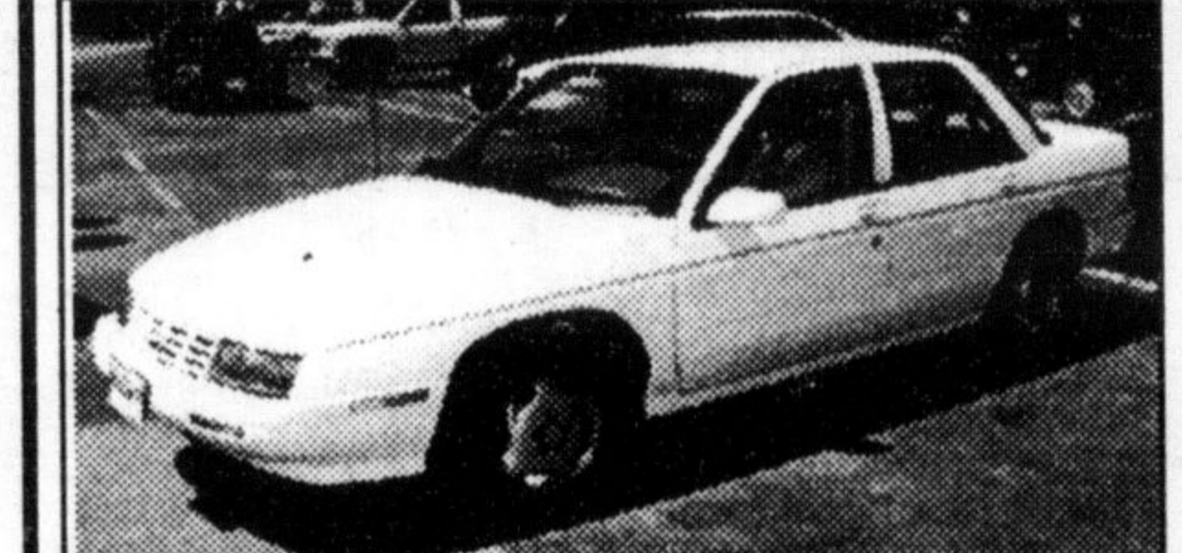
1996 CORSICA White/Grey cloth, V6, auto., air, P. Locks, AM/FM stereo cassette. Balance of factory warranty. Only 27,000 kms. Only $14,990.