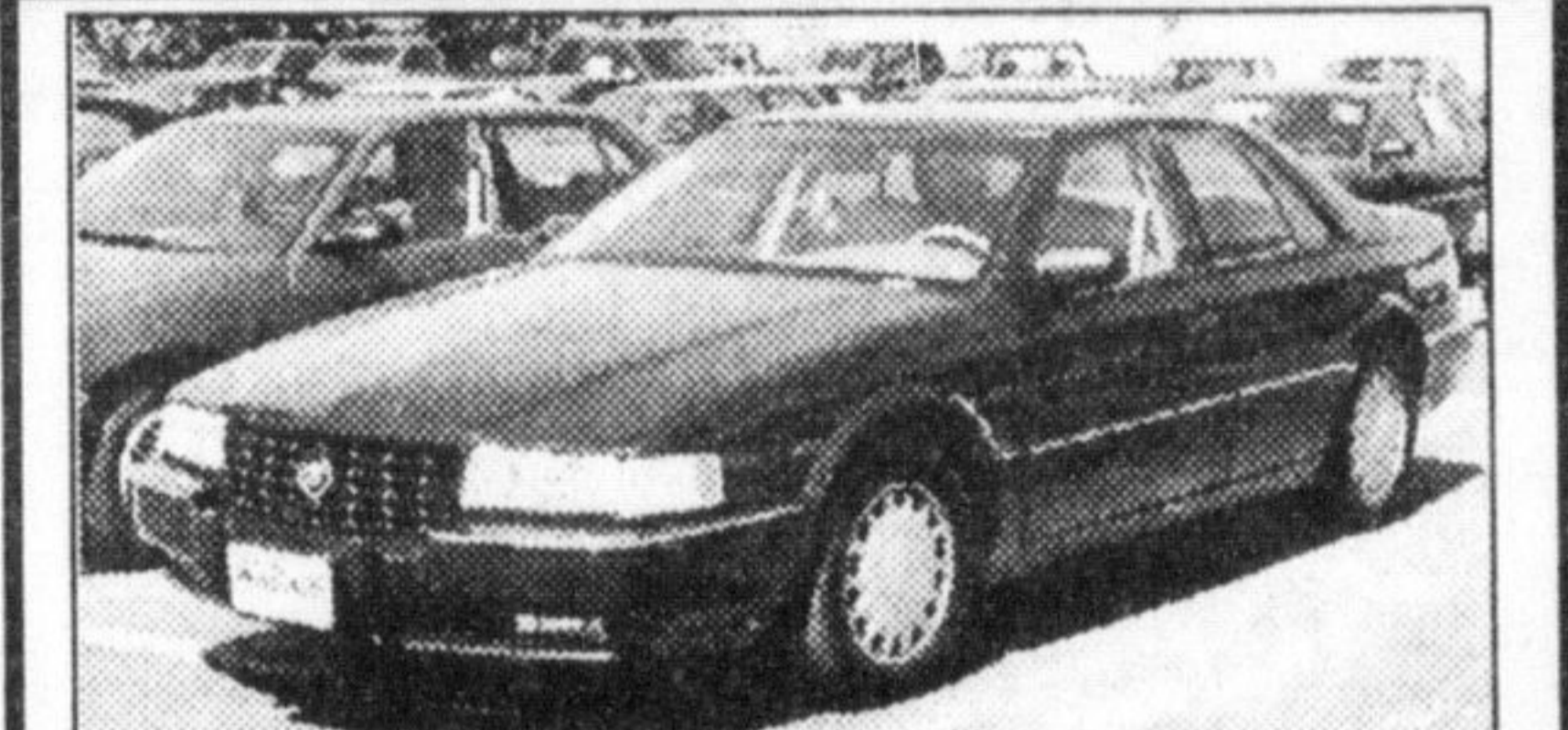
1994 CADILLAC SEVILLE STS Green/Tan Leather. Fully Loaded. Only 68,000 kms. Only $28,877