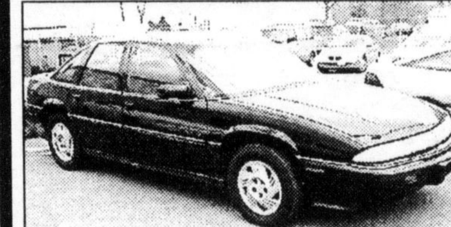
1996 GRAND PRIX Green/grey cloth, V6, auto, air, p. windows, p. locks, tilt, cruise, cassette, balance of factory warranty. Only 37,000 km. Only $18,788