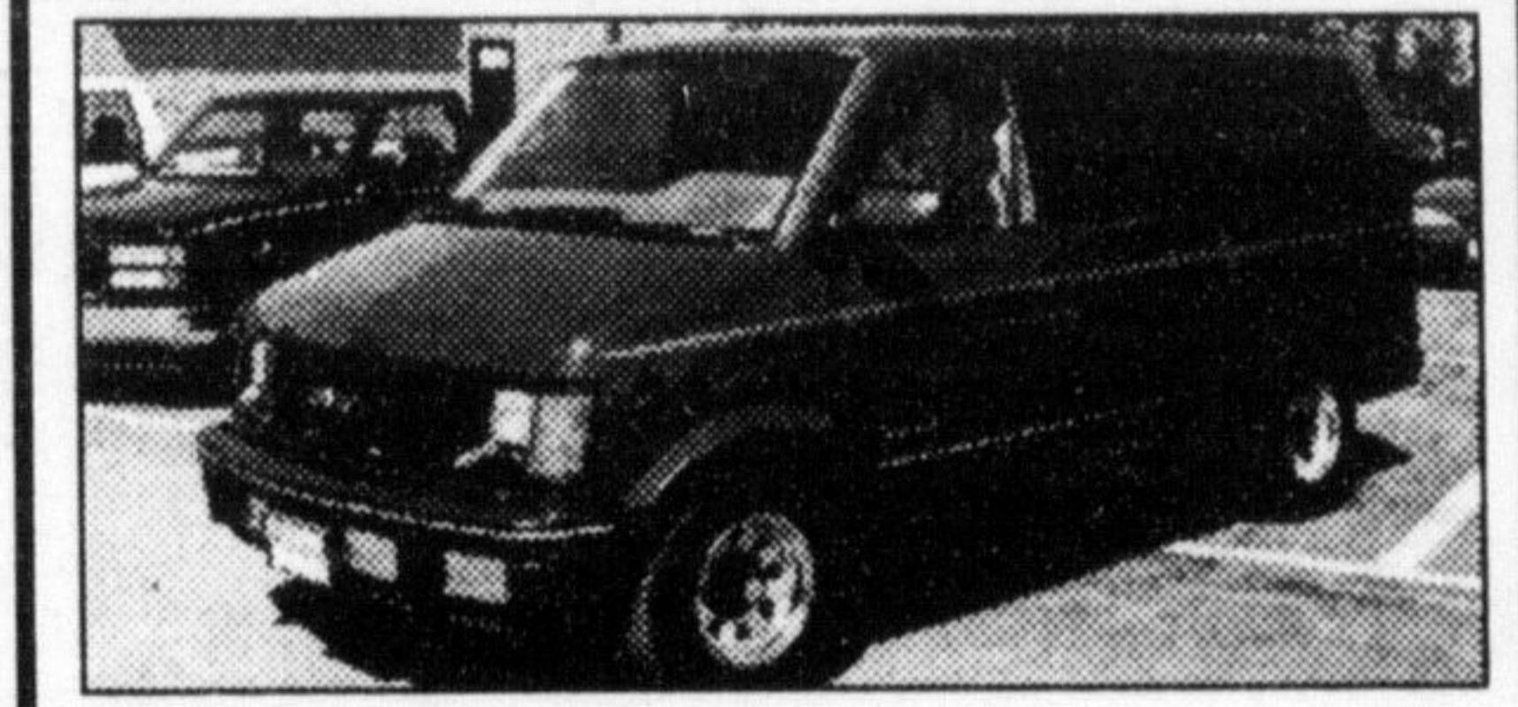
1994 SAFARI SLX One owner, burgundy/burgundy cloth, 8 passenger, air conditioned, P.D.L., tilt, cruise, cassette, deep tint, rally wheels, only 52,000 kms. Only $15,995