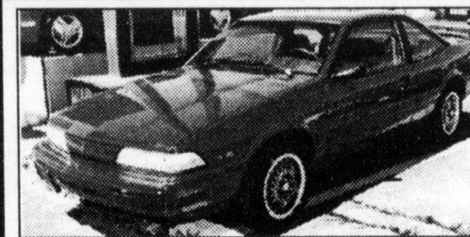
1994 SUNBIRD Red/Graphite cloth, V6, auto., air, p. locks, AM/FM, stereo cassette. Only 60,000 kms. Only $10,844