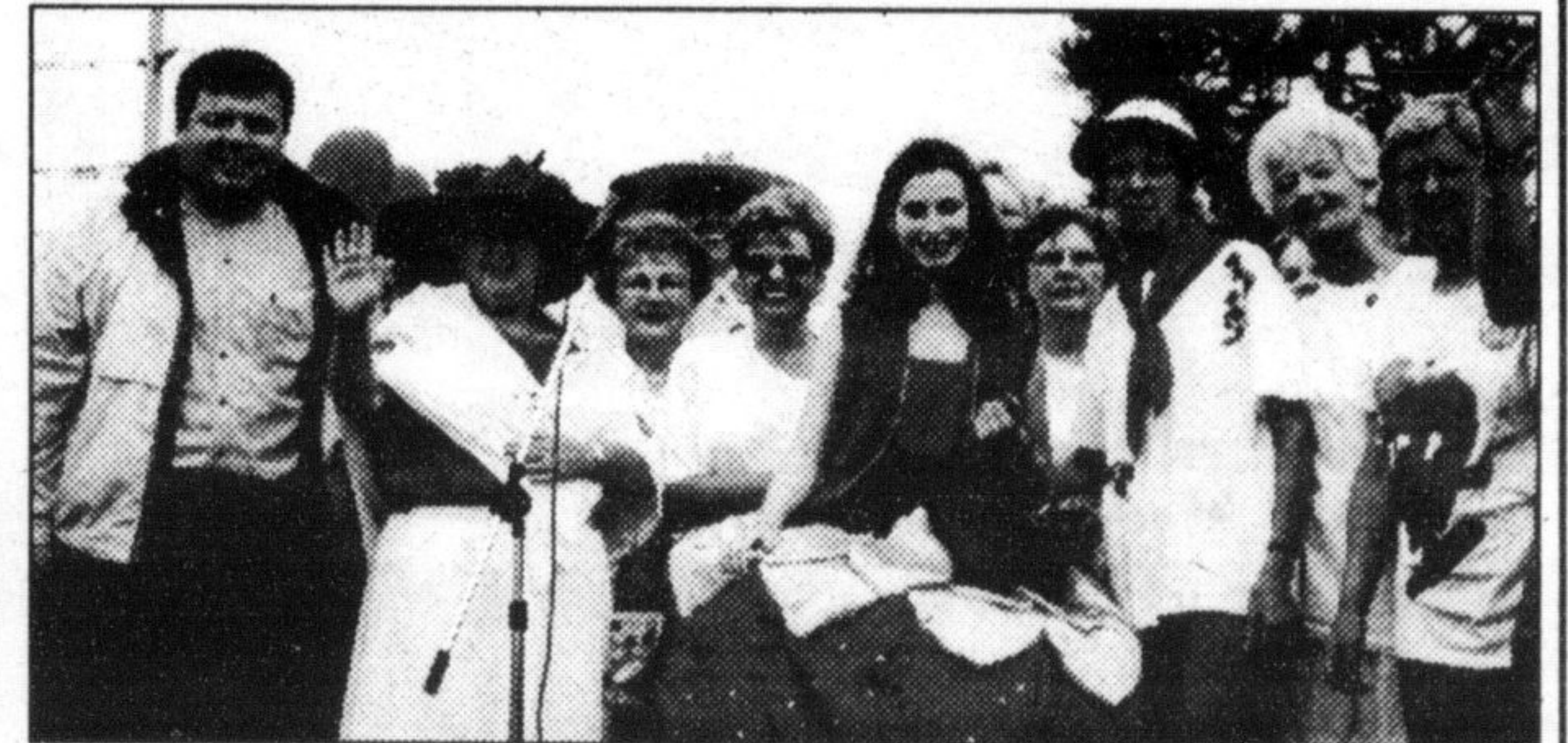
The Official Opening of the 1997 Strawberry Fair!