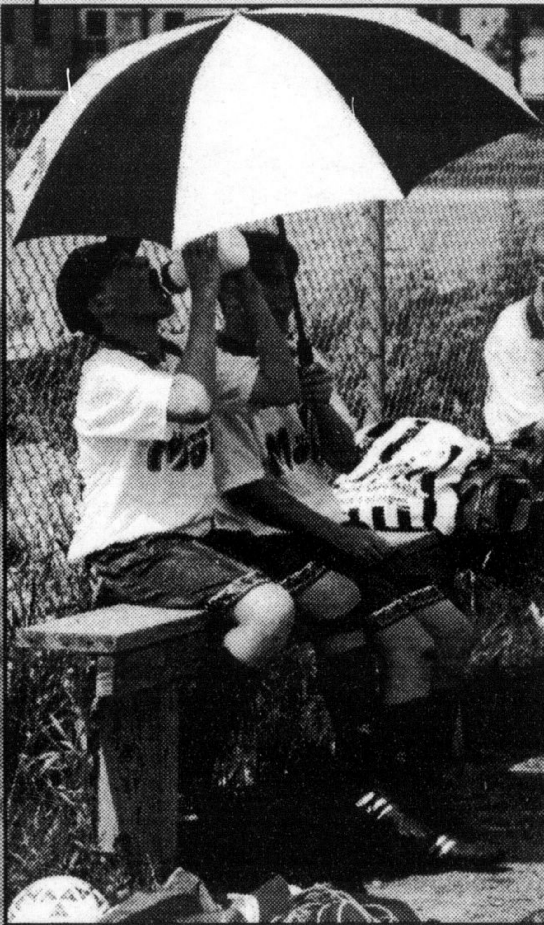
The Milton Magic under-14 boys team made plenty of headway against Welland at the Friendship Tournament. They beat the Wizards 4-1 but were shut out in three other games. (Inset) With the heat and humidity soaring over the weekend, water and shade were essential.