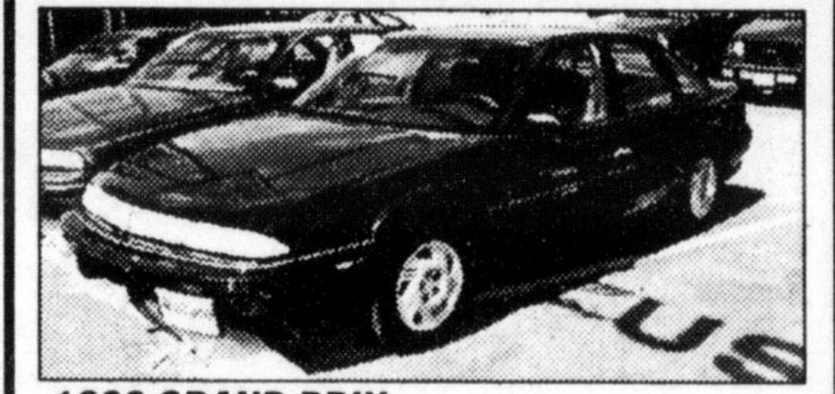
1996 GRAND PRIX Green/graphite cloth. V6, auto, air, P.W., P. Locks, tilt, cruise, cassette. Balance of factory warranty. Only 37,000 kms.