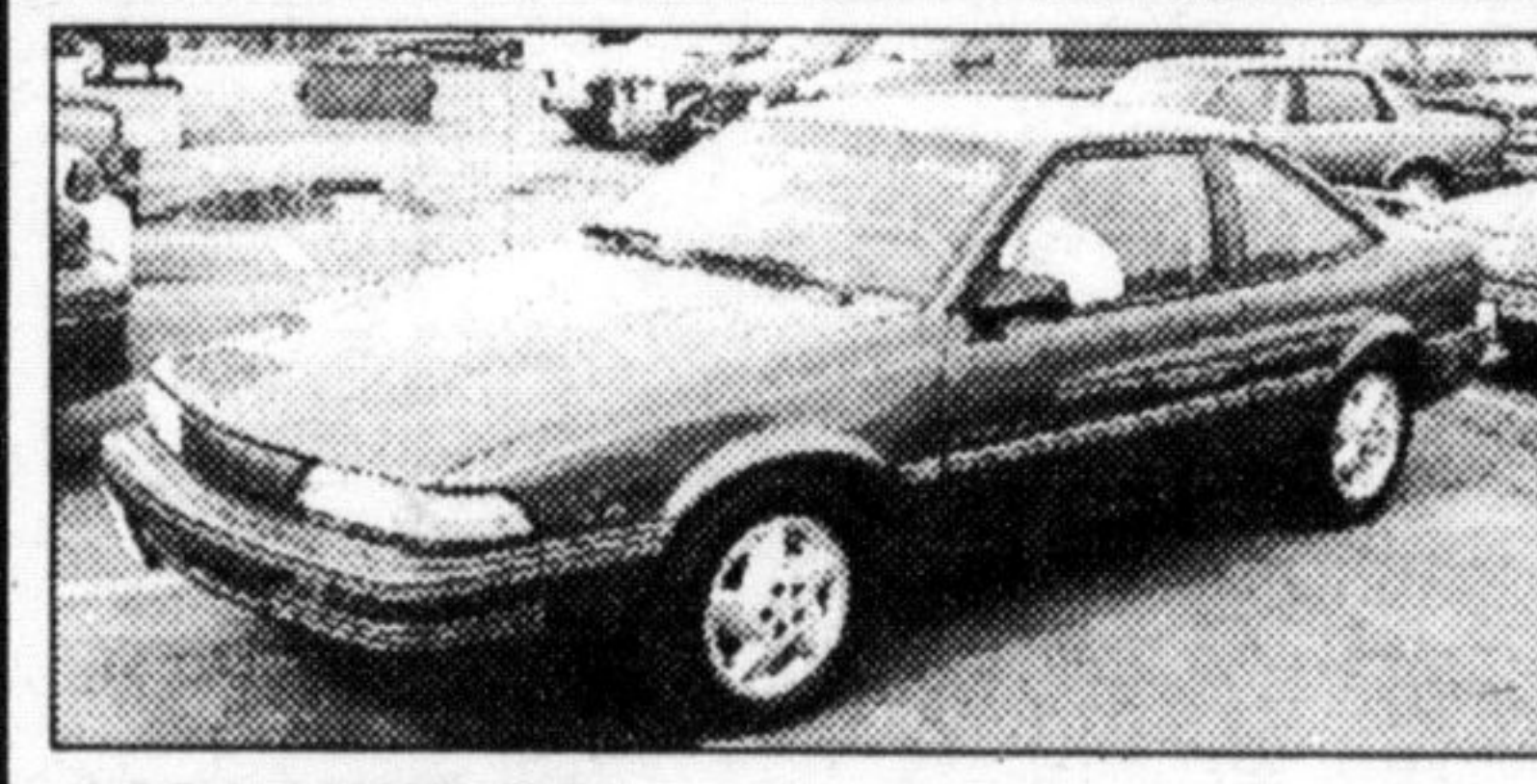
1994 SUNBIRD One owner, aqua/grey cloth, V6, automatic, A/C, power windows, locks, tilt, cruise, cassette.