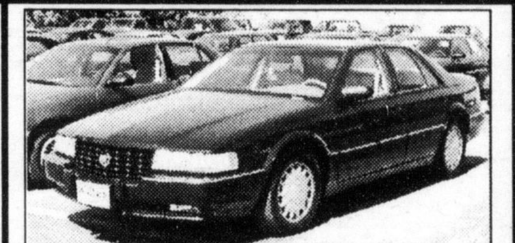
1994 CADILLAC SEVILLE STS Green/Tan Leather. Fully Loaded. Only 68,000 kms.