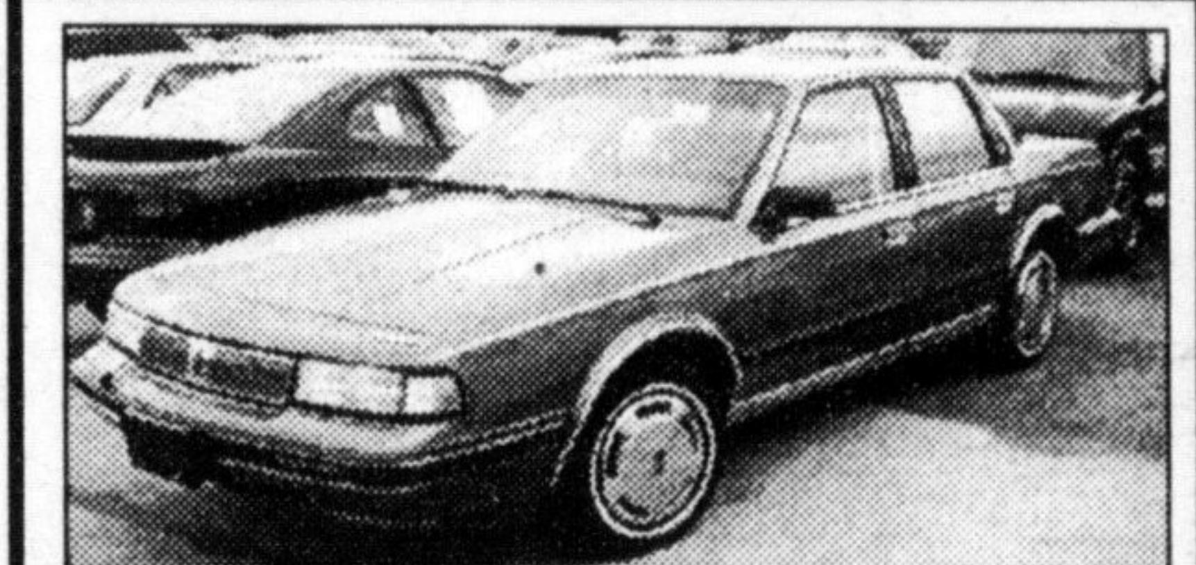
1992 CIERA Grey/grey cloth, V6, auto, air, P.W., P. Locks, tilt, cruise, cassette, rally wheels. Only 52,000 kms.