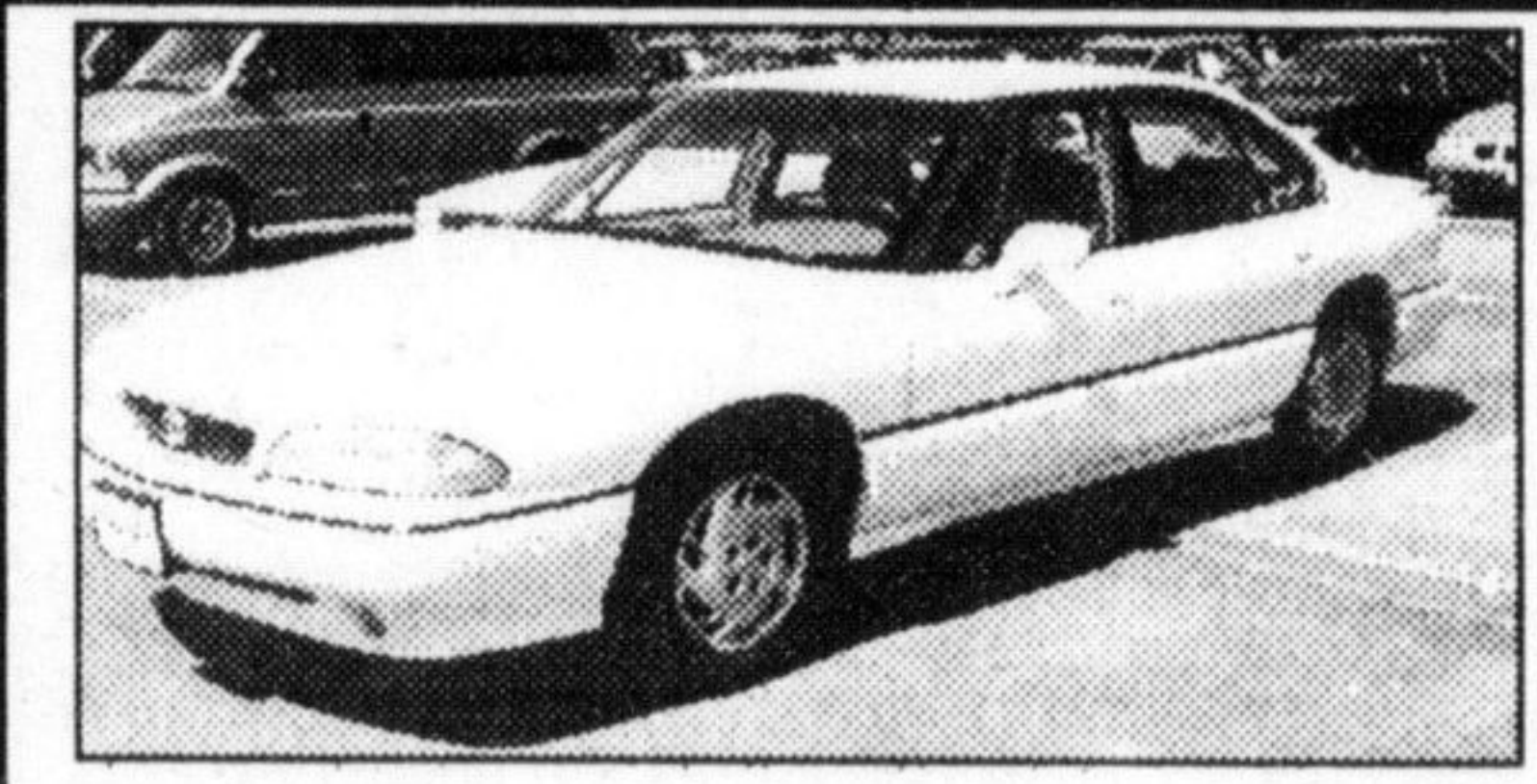
1995 BONNEVILLE SE White/Taupe cloth. V6, Auto, Air, P.W., P. Lks., Tilt, Cruise, Cassette, Alloy Wheels. Only 59,000 kms