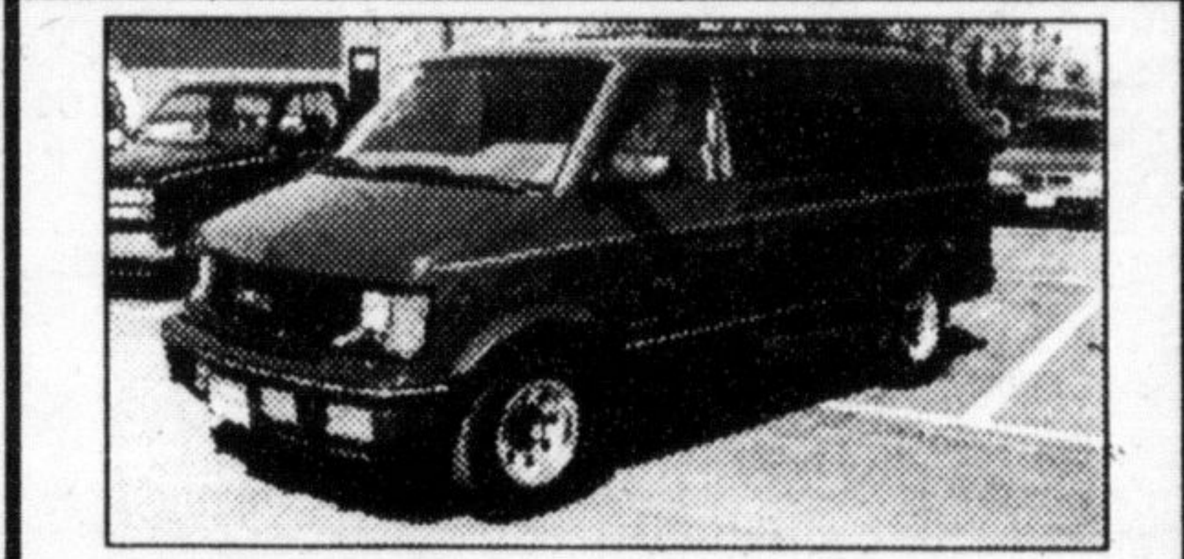
1994 SAFARI SLX One owner, burgundy/burgundy cloth, 8 passenger, air conditioned, P.D.L., tilt, cruise, cassette, deep tint, rally wheels, only 52,000 kms.