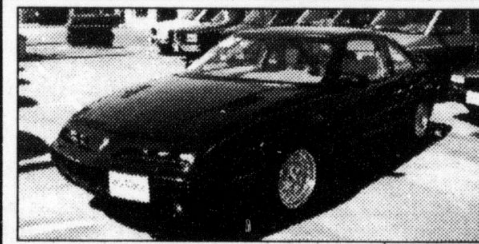
1995 GRAND PRIX GTP Black/grey cloth buckets. Fully loaded including power moonroof. Balance of factory warranty. Only 41,000 kms.