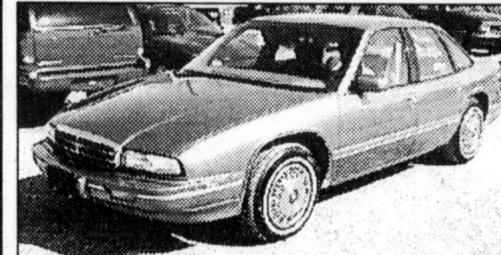
1994 BUICK REGAL One owner, amethyst/grey cloth, V6, auto, power window, air, locks, tilt, cruise, cass., only 58,000kms