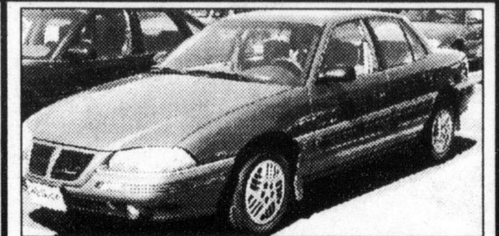
1993 GRAND AM One owner, Blue/Grey cloth, V6, Auto, Air Conditioning, P. Locks. Only 65,000 kms.