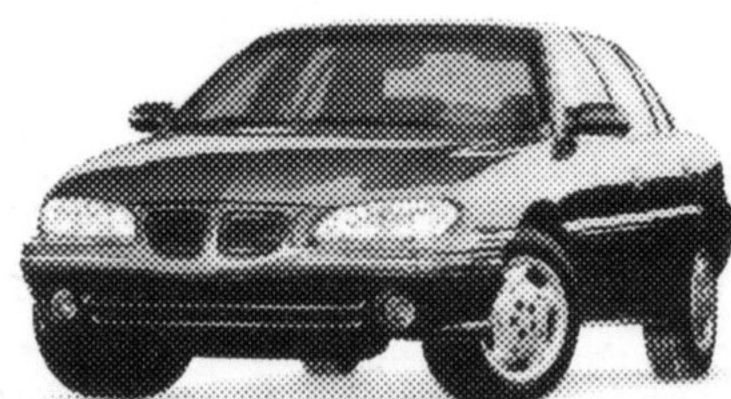
Pontiac Grand Am