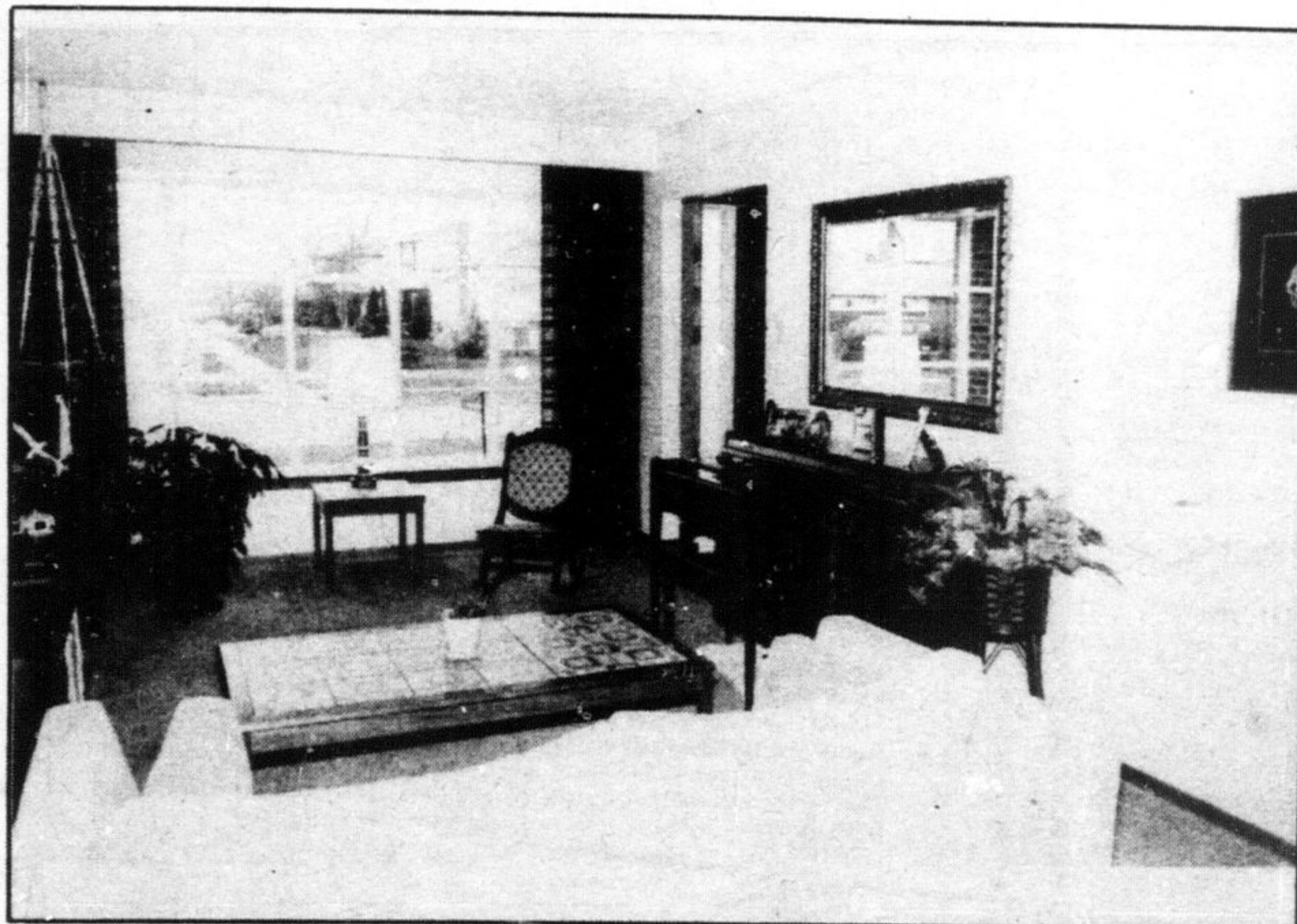
"Bright, large with convenient ensuite."

miltowne realty corp. 22 ontario st. s. milton, ont. 878-2365