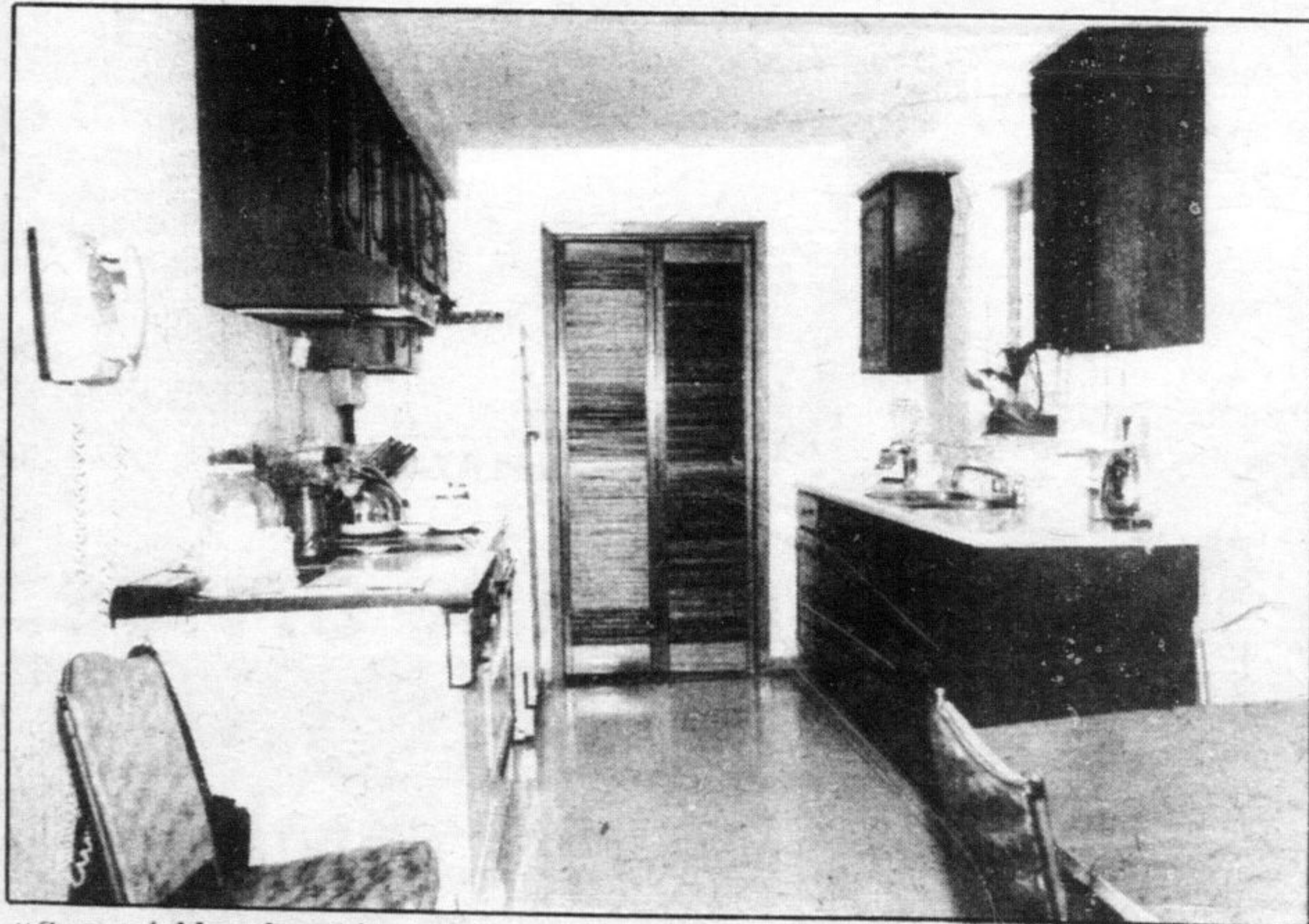
"Cozy neighbourly eat-in style."