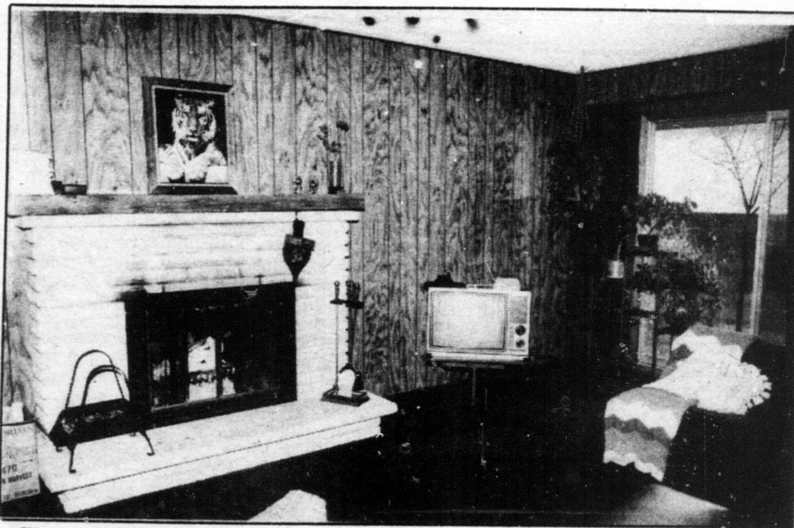
"Warm, frolicking family room."