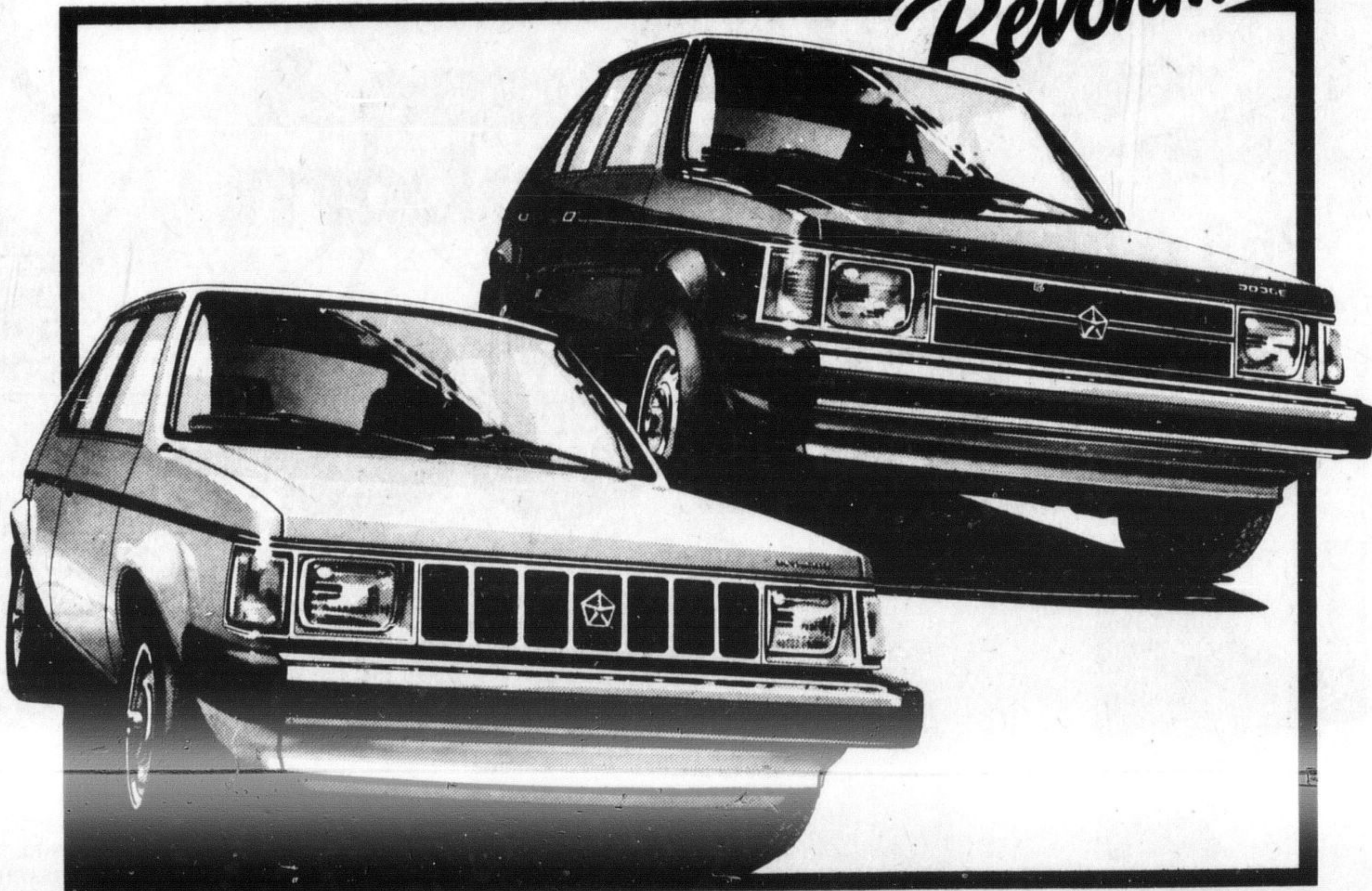
Top: Dodge Omni, Bottom: Plymouth Horizon

Based on M.S.R.P. of optional equipment. Dealer may sell for less.