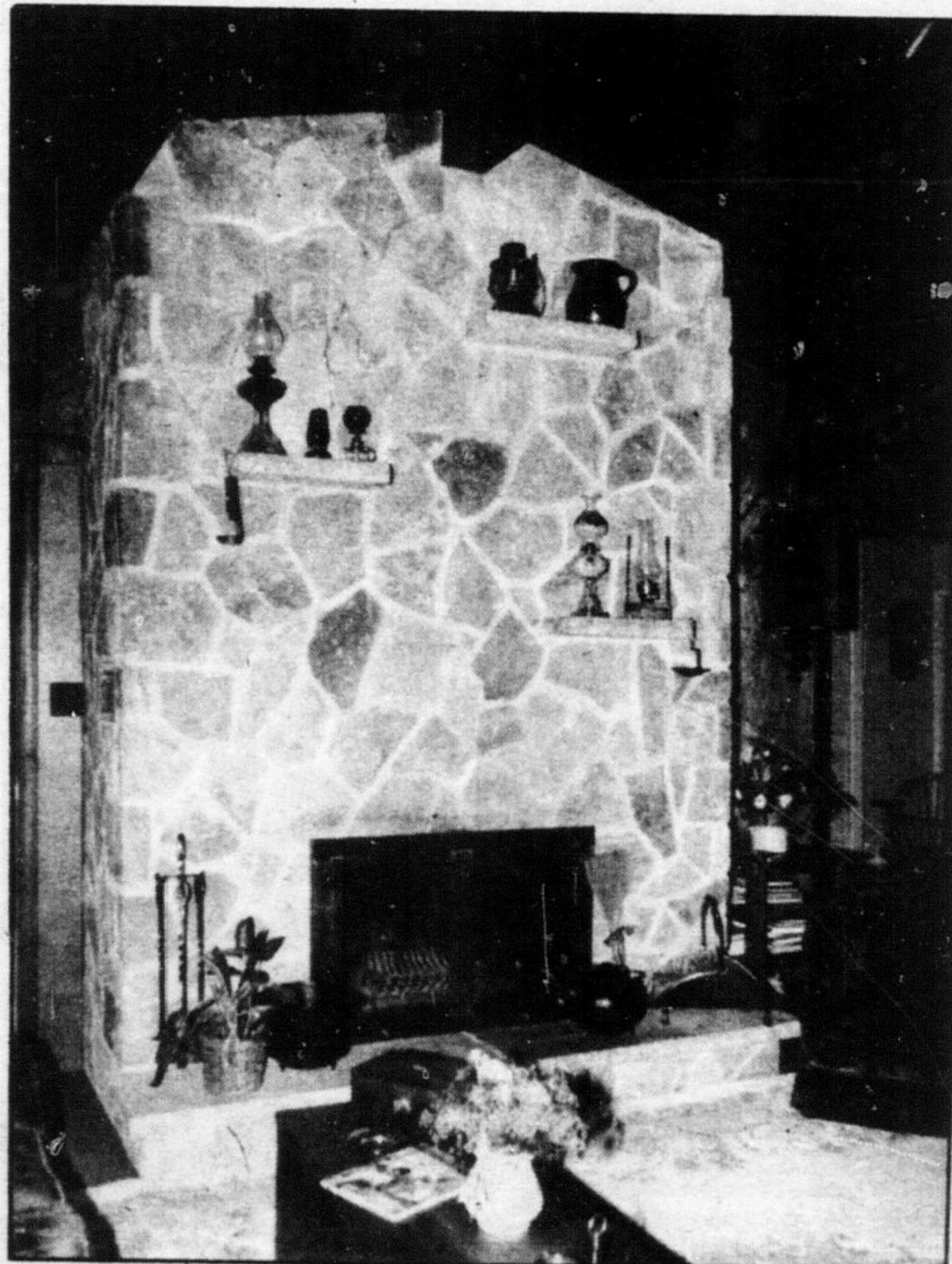
An extra-high ceiling is accented by rich wooden beams which blend with the rustic look of the fireplace.