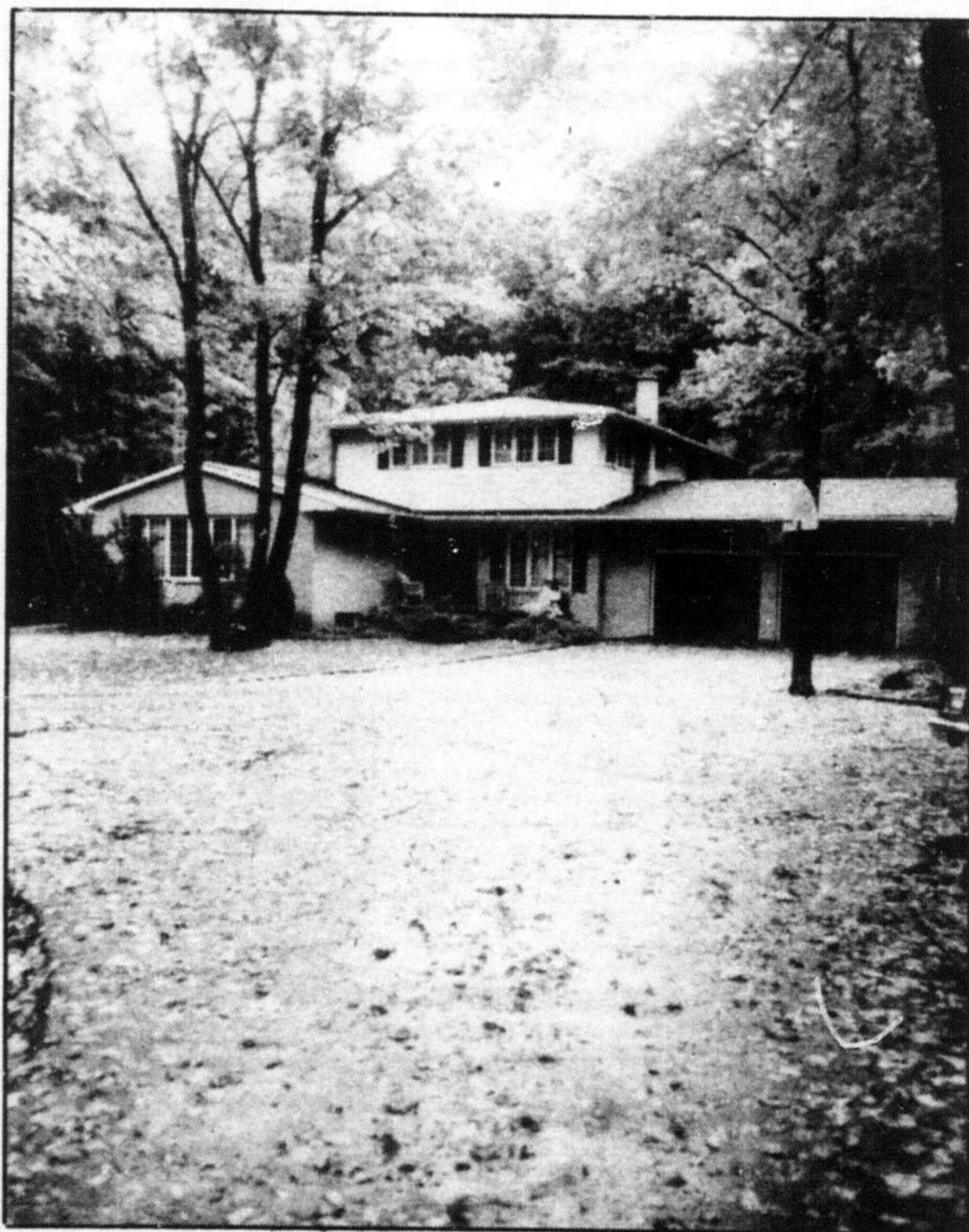
The setting is beautiful for this top quality home nestled among mature trees.

miltowne realty corp. 22 ontario st. s. milton, ont. 878-2365