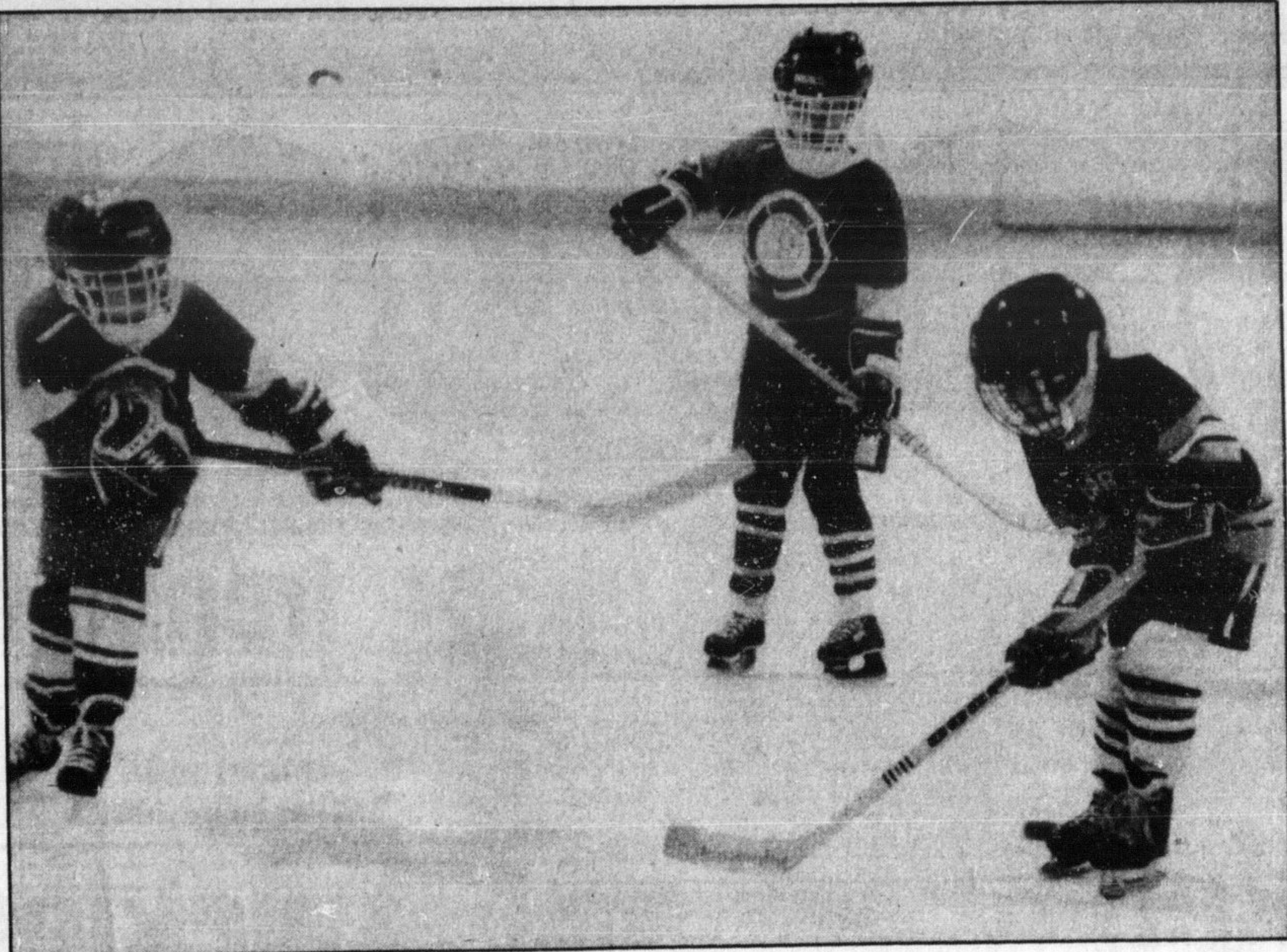
On the playoff march