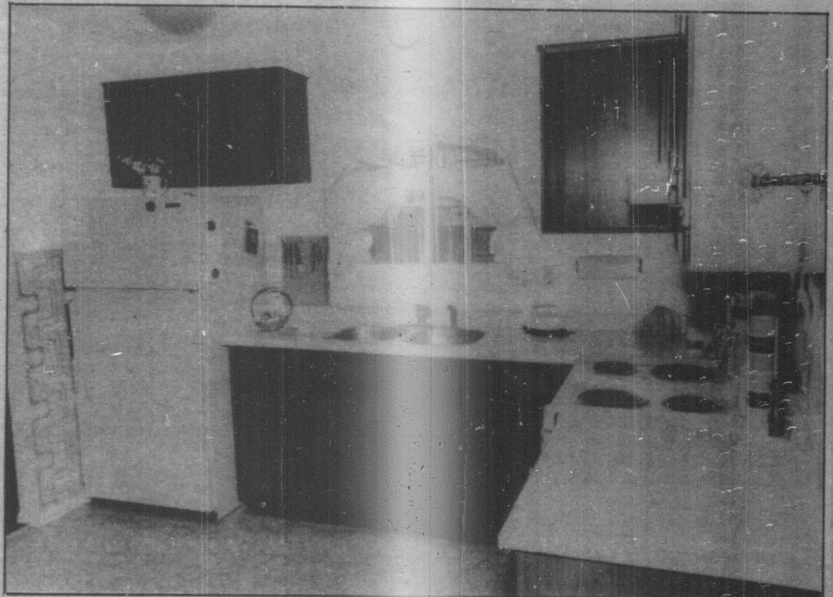
The large kitchen provides ample room for the most ambitious chef.