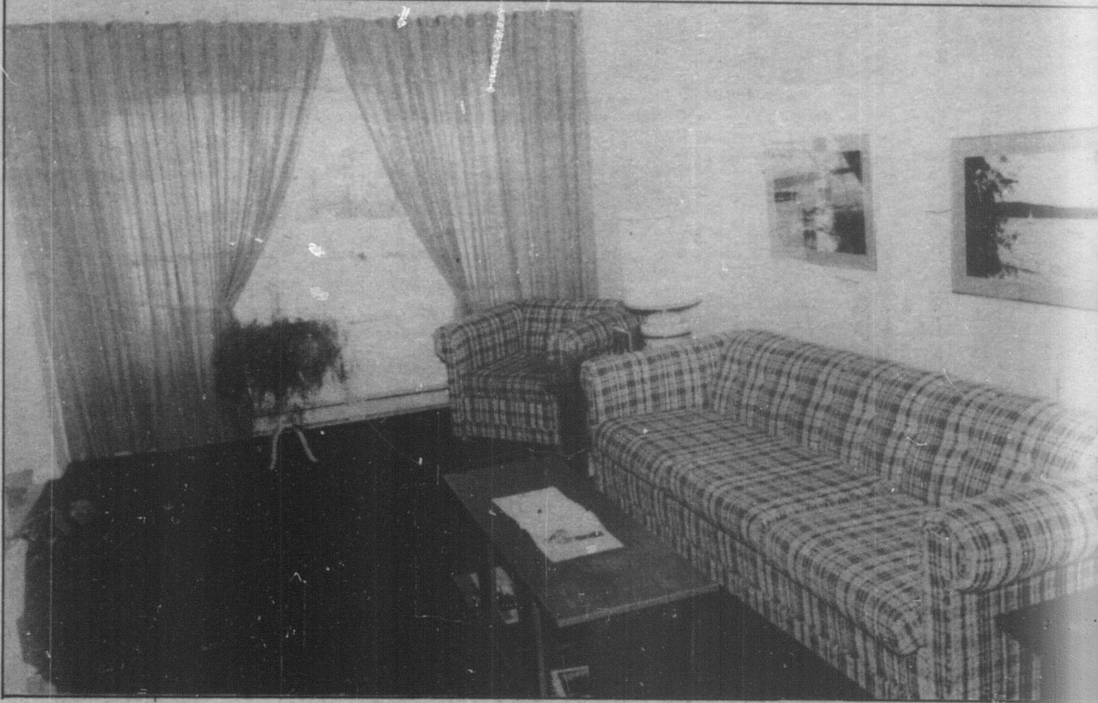
The large, formal living room offers a lovely view of the front yard. An adjoining dining area is perfect for formal occasions.