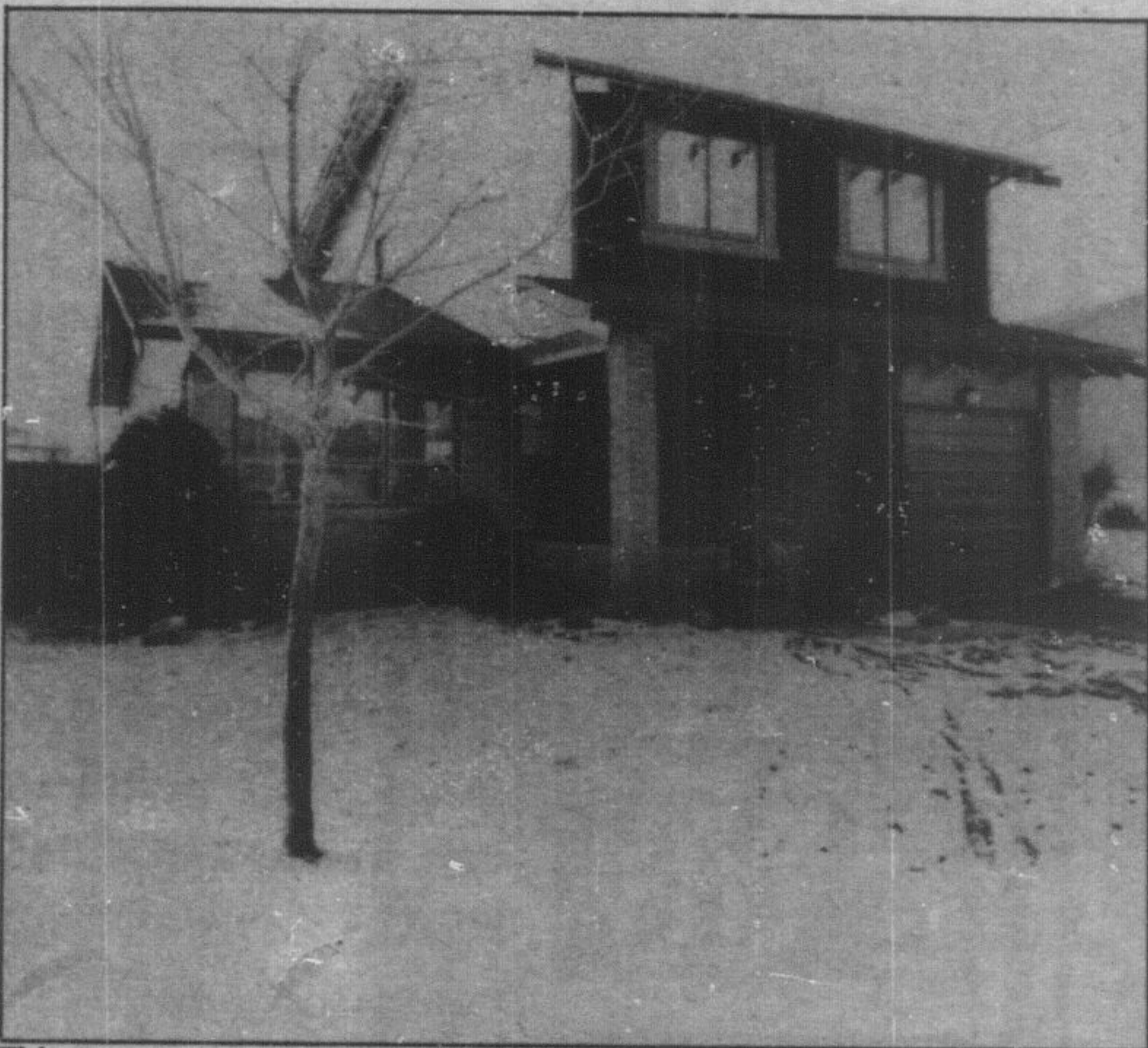
This two storey brick and aluminum home has many excellent features including an inground pool.