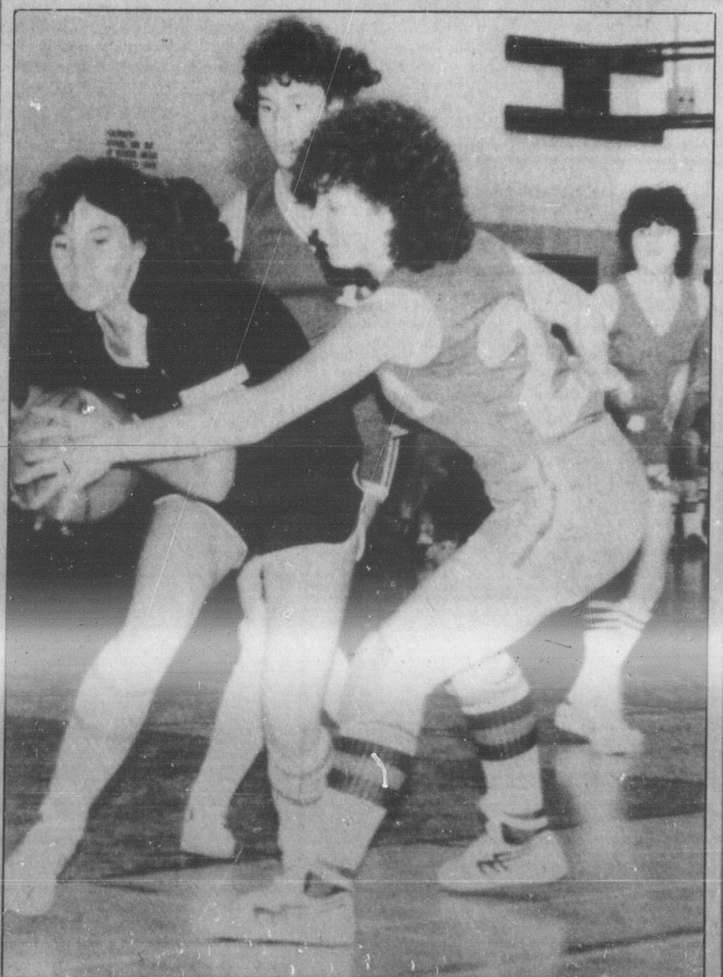
It was another case of being just one win away from a Halton title for Milton District High School's Wolverines which lost 2-1 to T.A. Blacklock Friday at MDHS. In a low scoring game, Blacklock led 1-0 at half-time and shut down Wolverines in the fourth quarter to gain the win. Last year, Wolverines also went to the championship game where they were edged. Read about the game in High School Sports on page C3.

In the first game of the morning, Baugh showed, that when they get their players back onto the ice and off the injury list, they can stay with anybody. But without bench strength, Baugh wilted and fell 13-5 to Peak's Industrial.