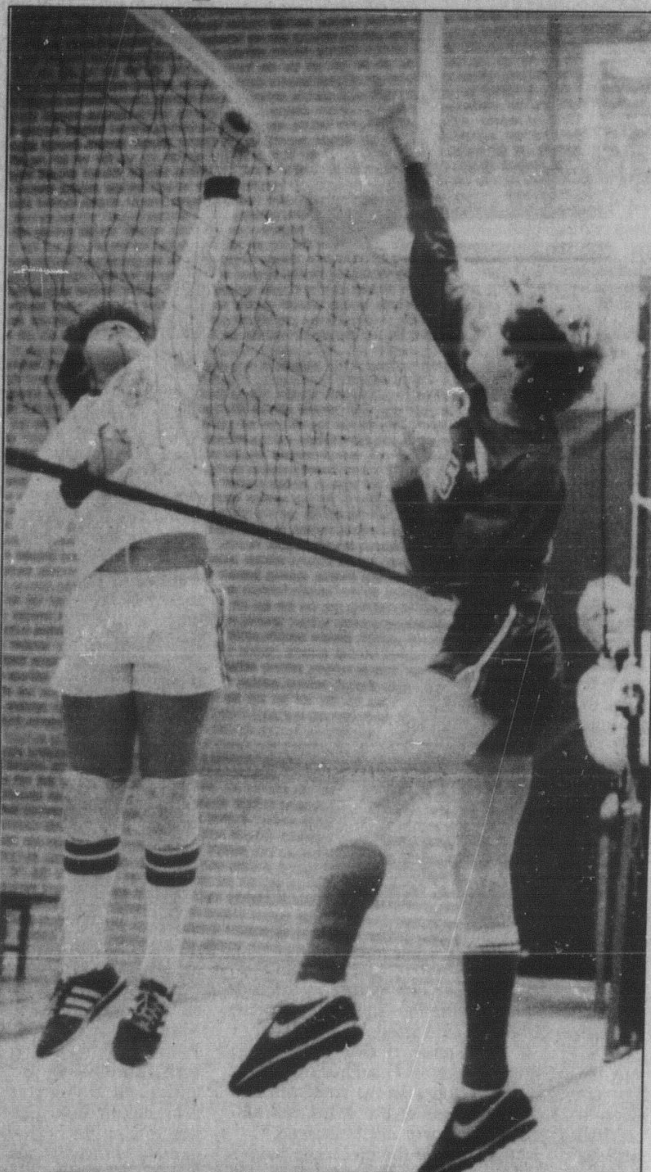
A W.I.D. player and his counterpart from Centennial go up for the ball during the North Halton volleyball championships. The Centennial boys, which had strung together 14 consecutive north Halton crowns finally were stopped in the final by Sherratt in two straight games.

The boys' victory marks the first volleyball championship for the school in its three-year existence.