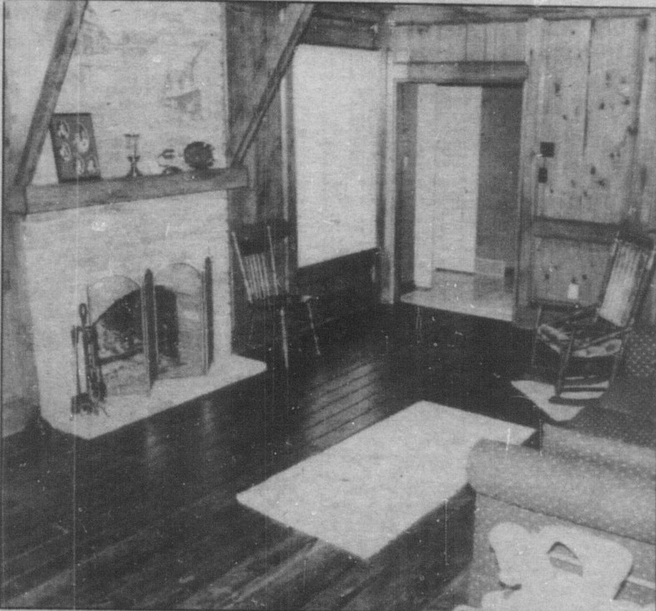
A beamed cathedral ceiling, English panelling and open fireplace make this main level family room something very special.