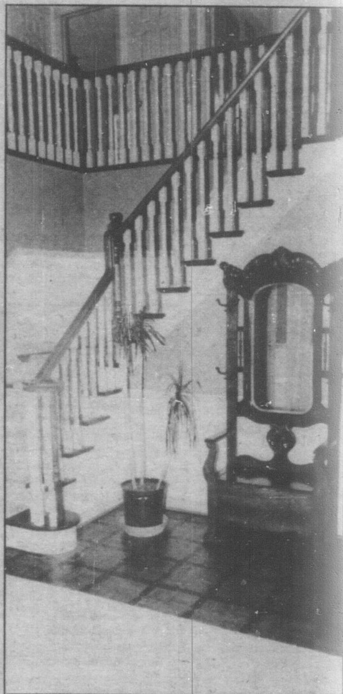
A large traditional style foyer is enhanced by a winding oak staircase leading to a spacious landing and powder room.