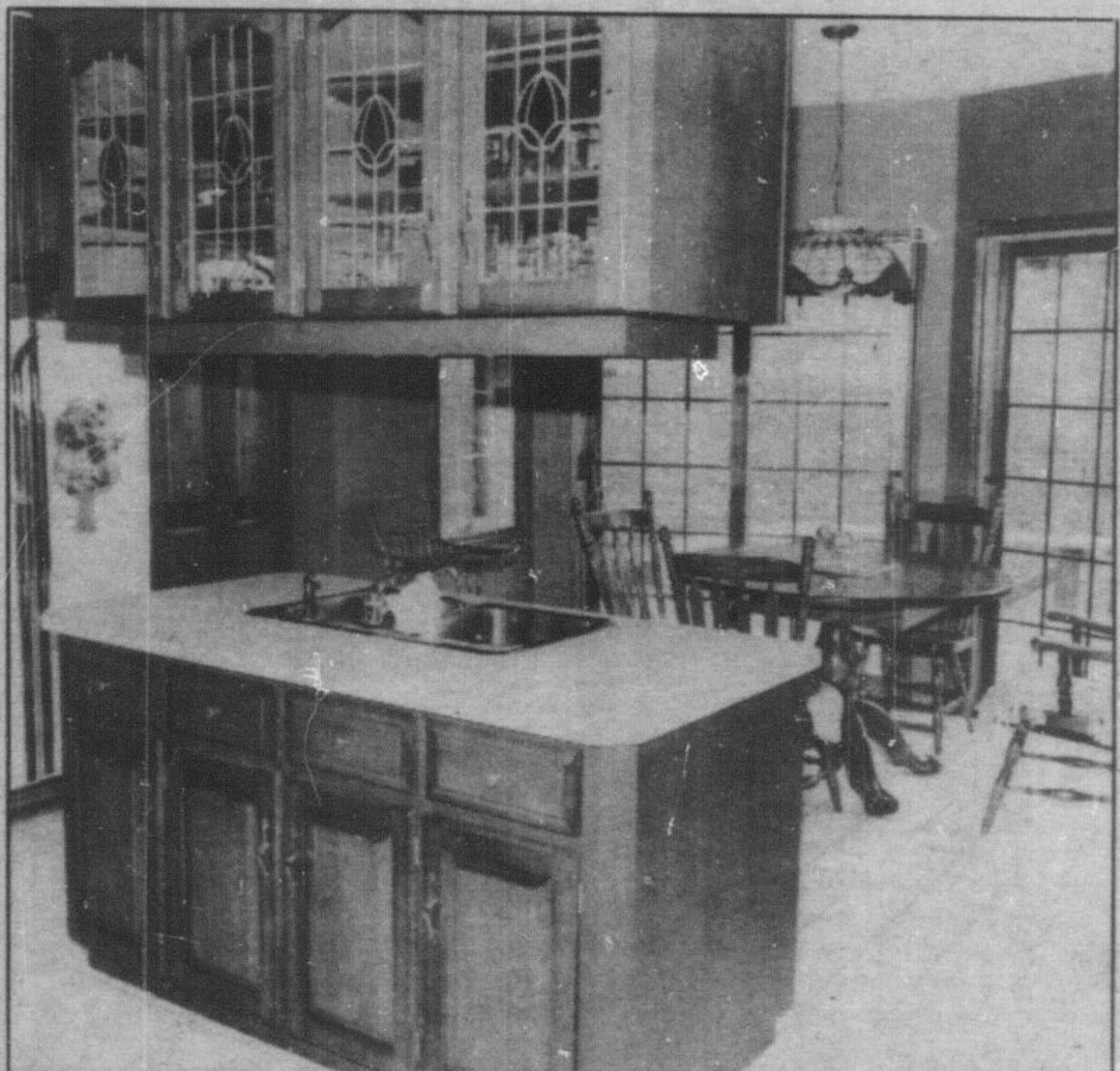
The large country size kitchen is built in solid rock maple and offers every convenience imaginable.