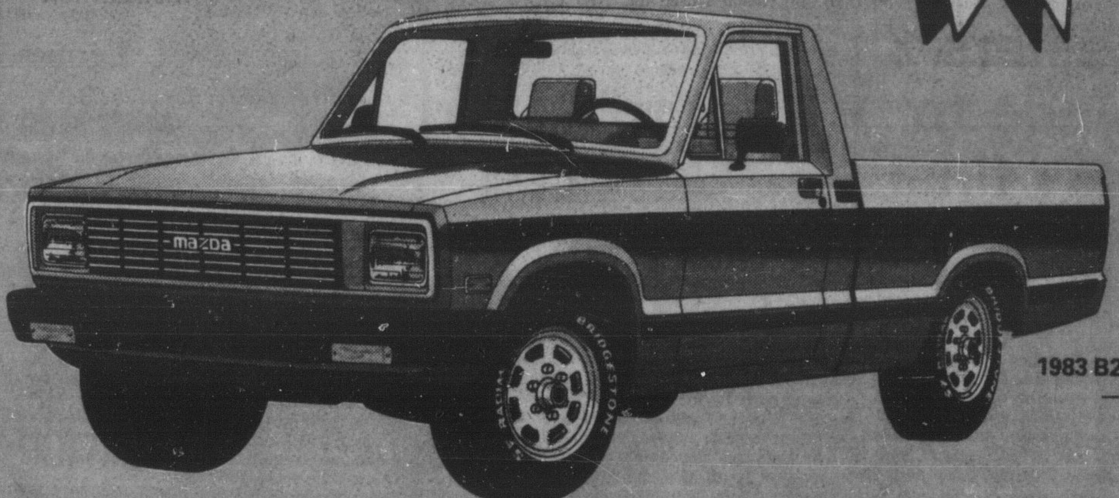
1983 B2000 SPORT - GAS