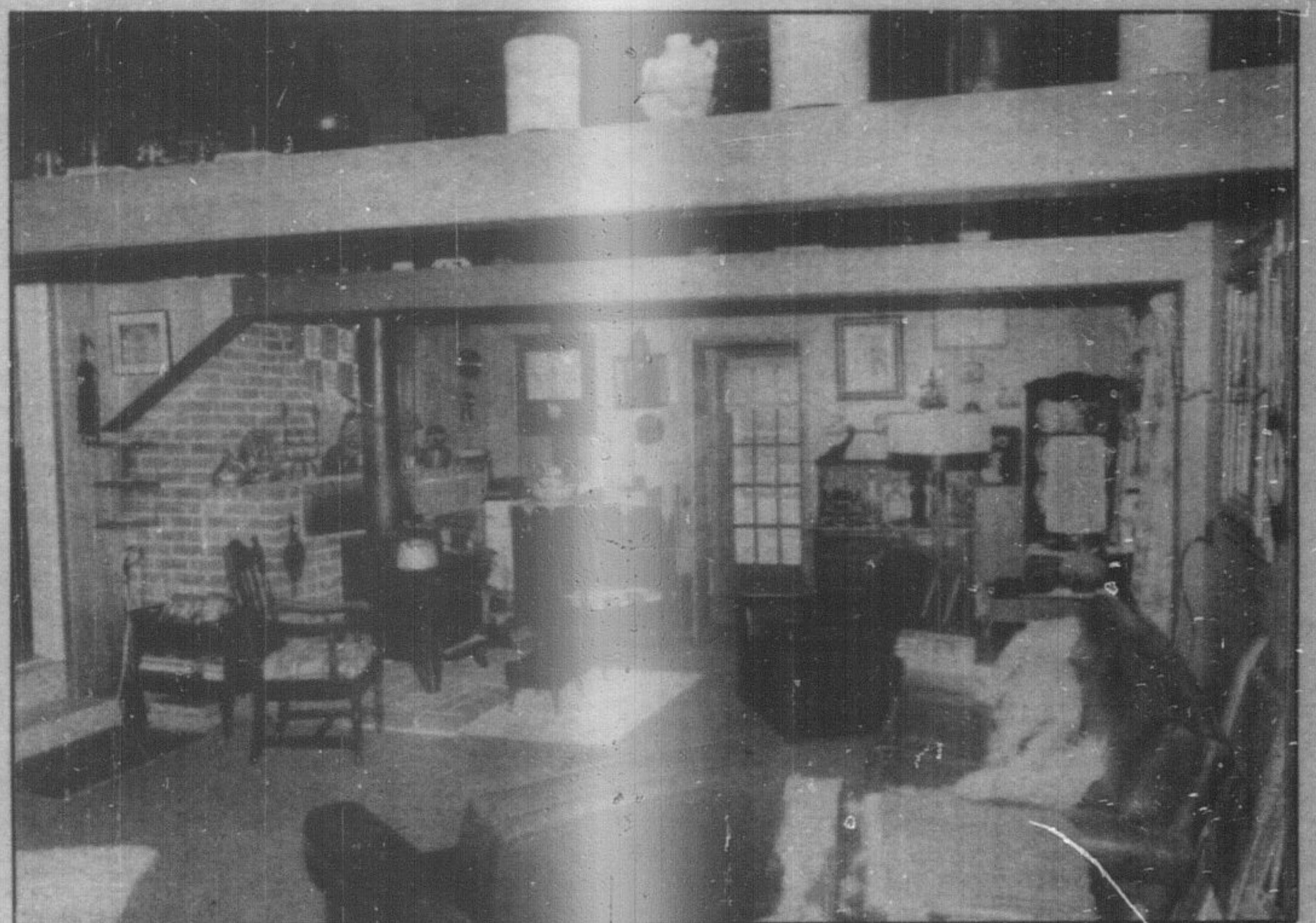
The huge family room, with cathedral ceilings, beams and wood burning stove is an ideal spot for parties or family gatherings.