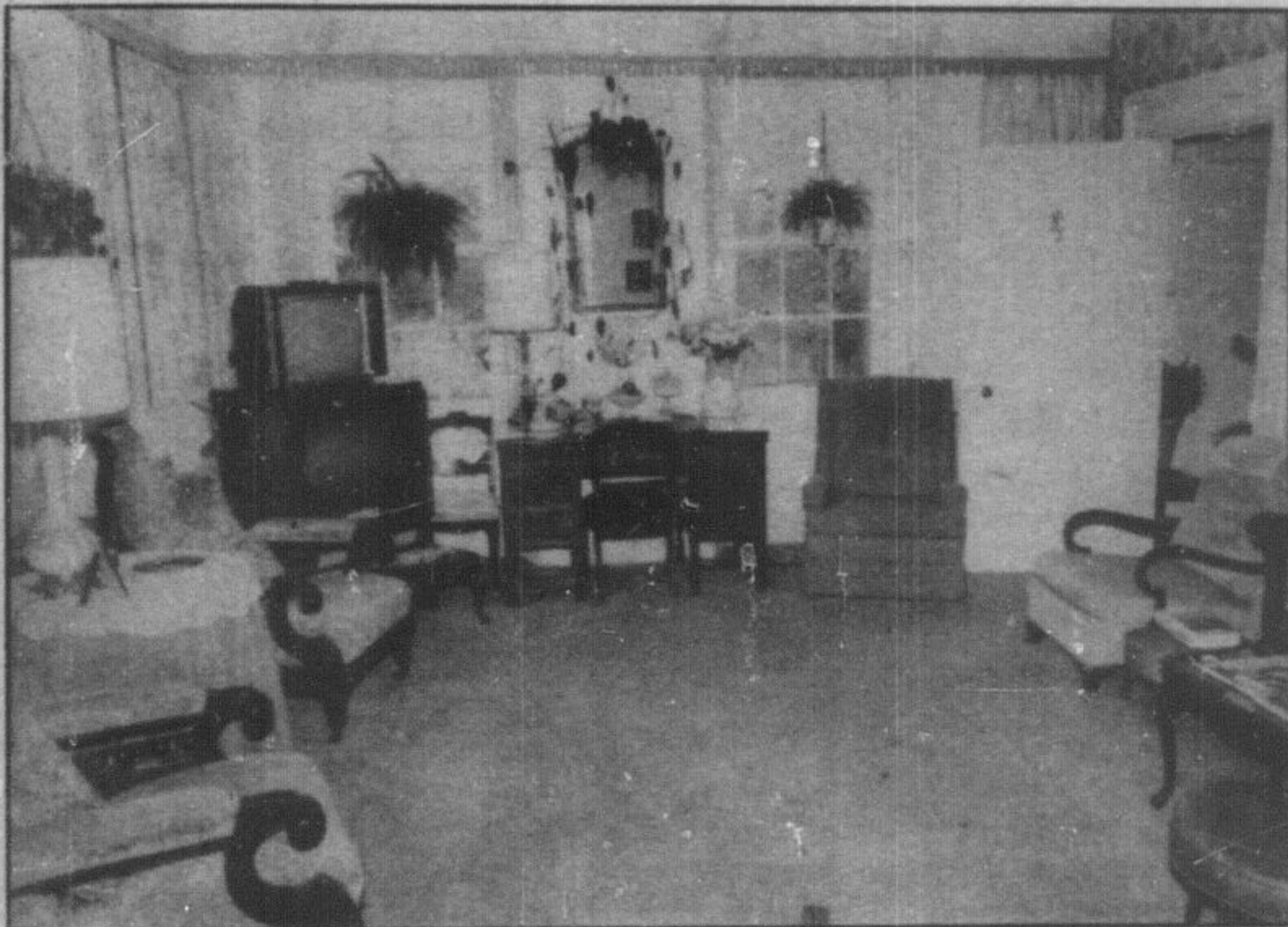
The large, formal living room faces south, allowing for plenty of light.