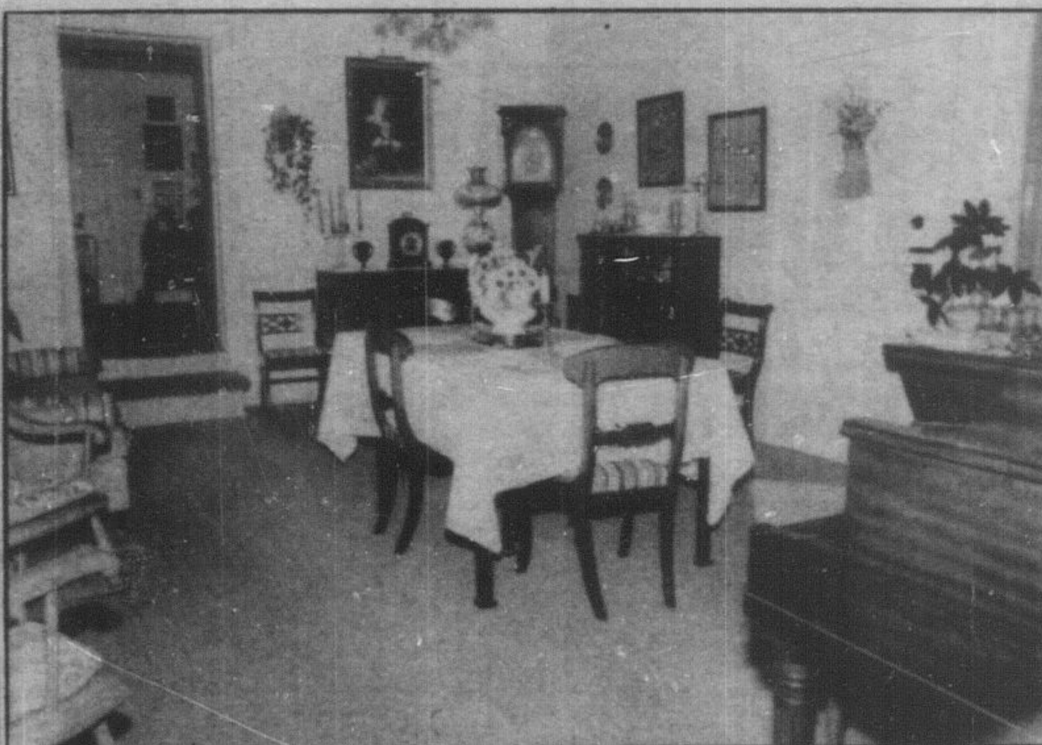
This is one of two dining rooms, and offers ample room for those special occasions.