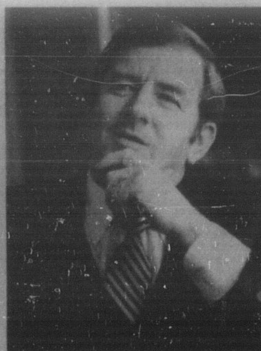
DR. JERRY FALWELL