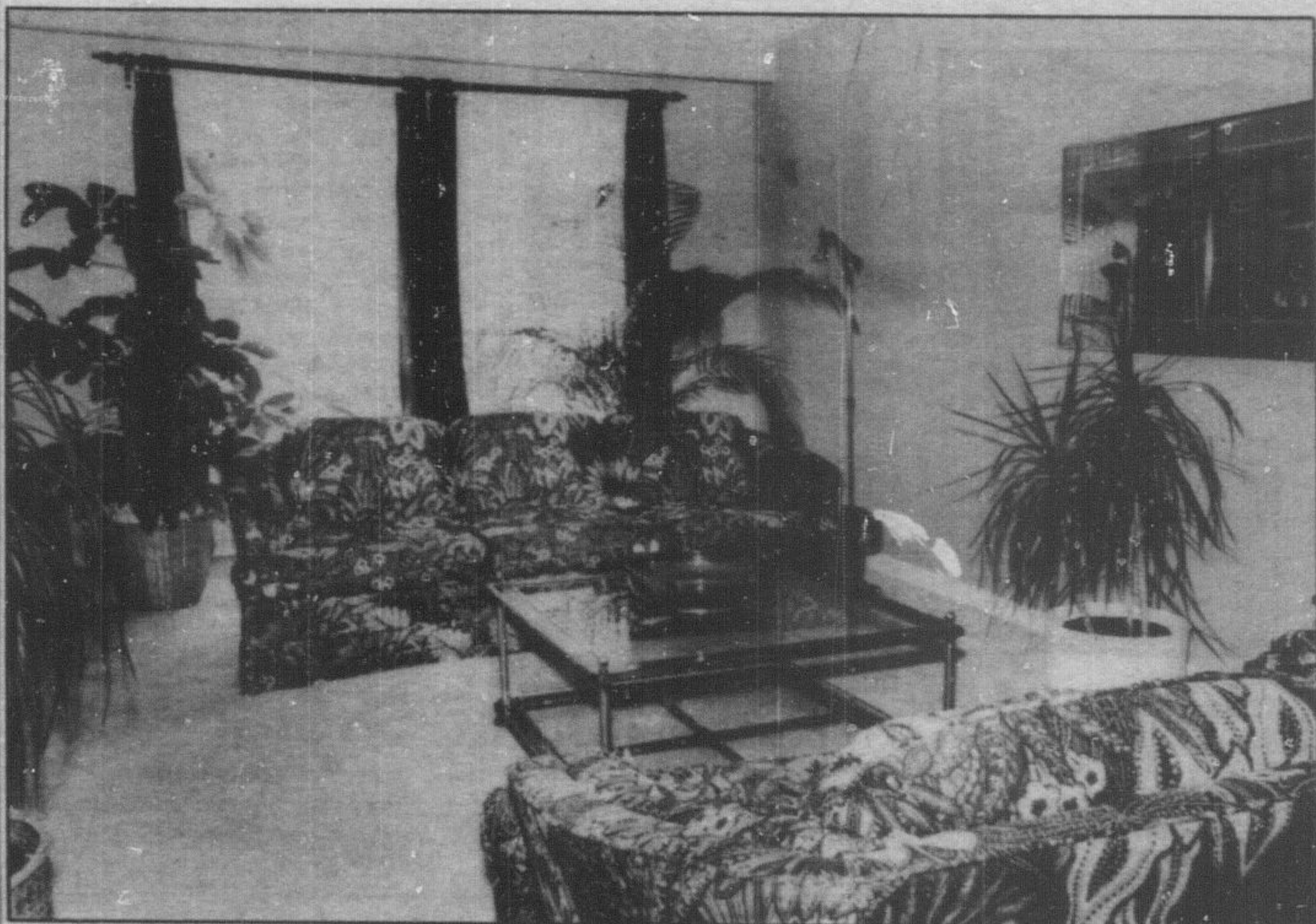
This beautiful formal living room offers an elegant area for those special occasions. With large, picture windows facing the front lawn, this is a bright room and ideal for growing your favorite plants and exotic trees.