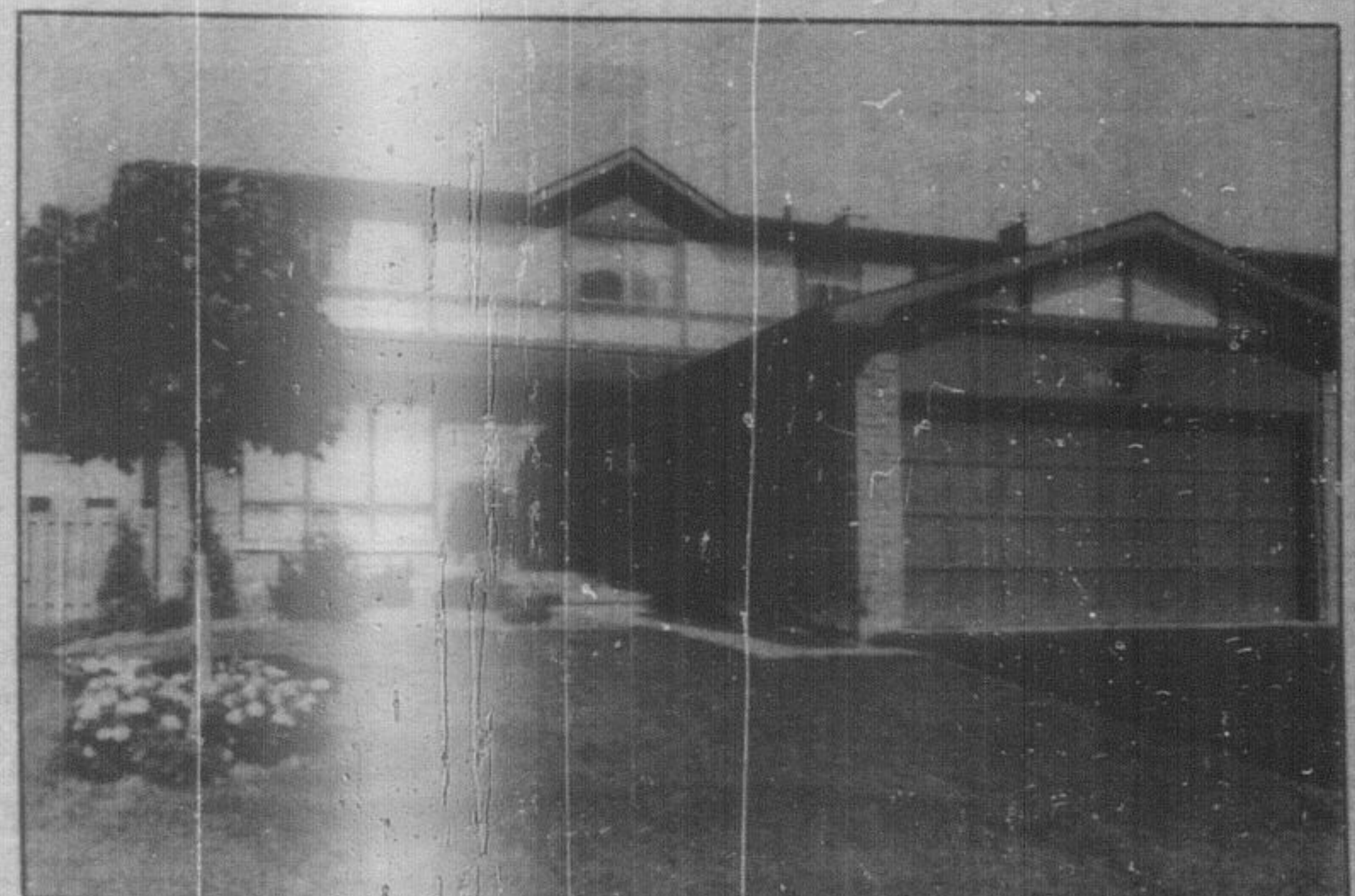
Set on a quiet crescent, only minutes from the Milton Sports Centre, this home has much to offer.