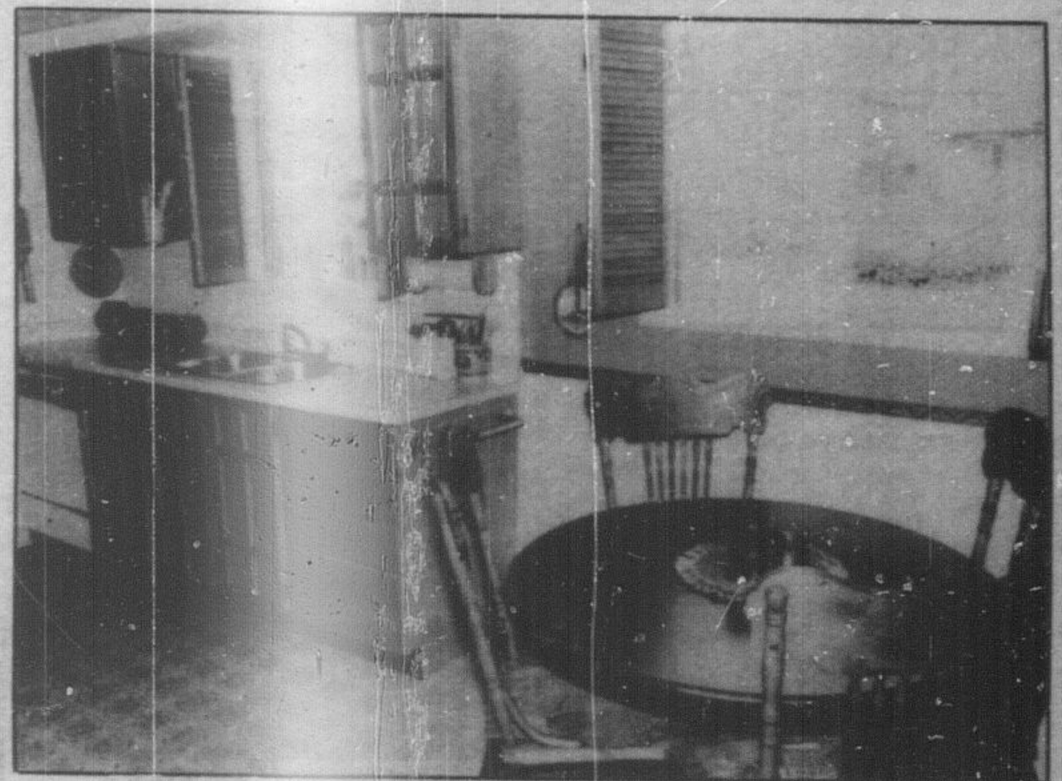
A lovely and spacious kitchen has the added advantage of windows overlooking the rear garden.