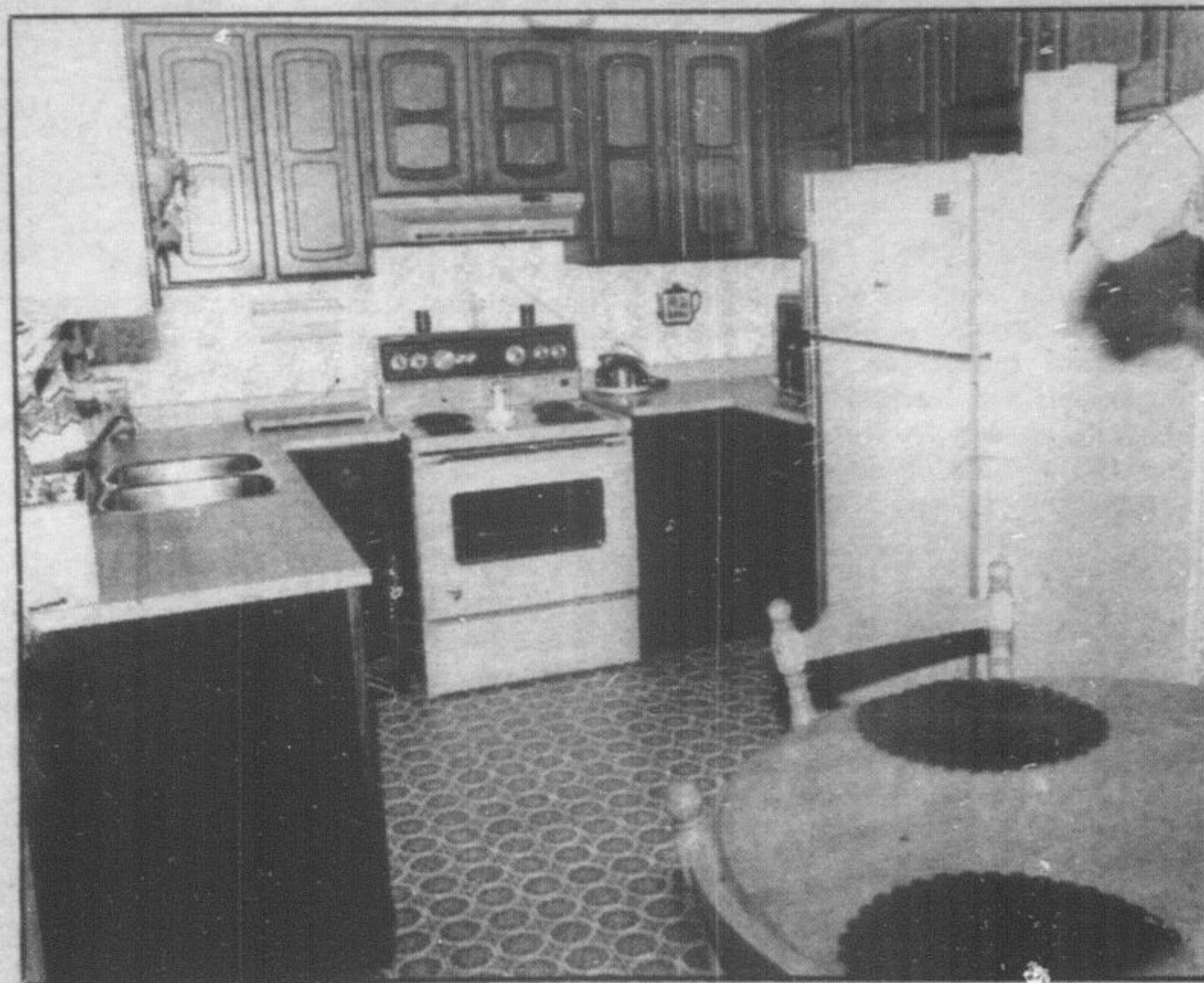
There is lots of working room in this nice sized kitchen. Included is a spacious area for family meals.