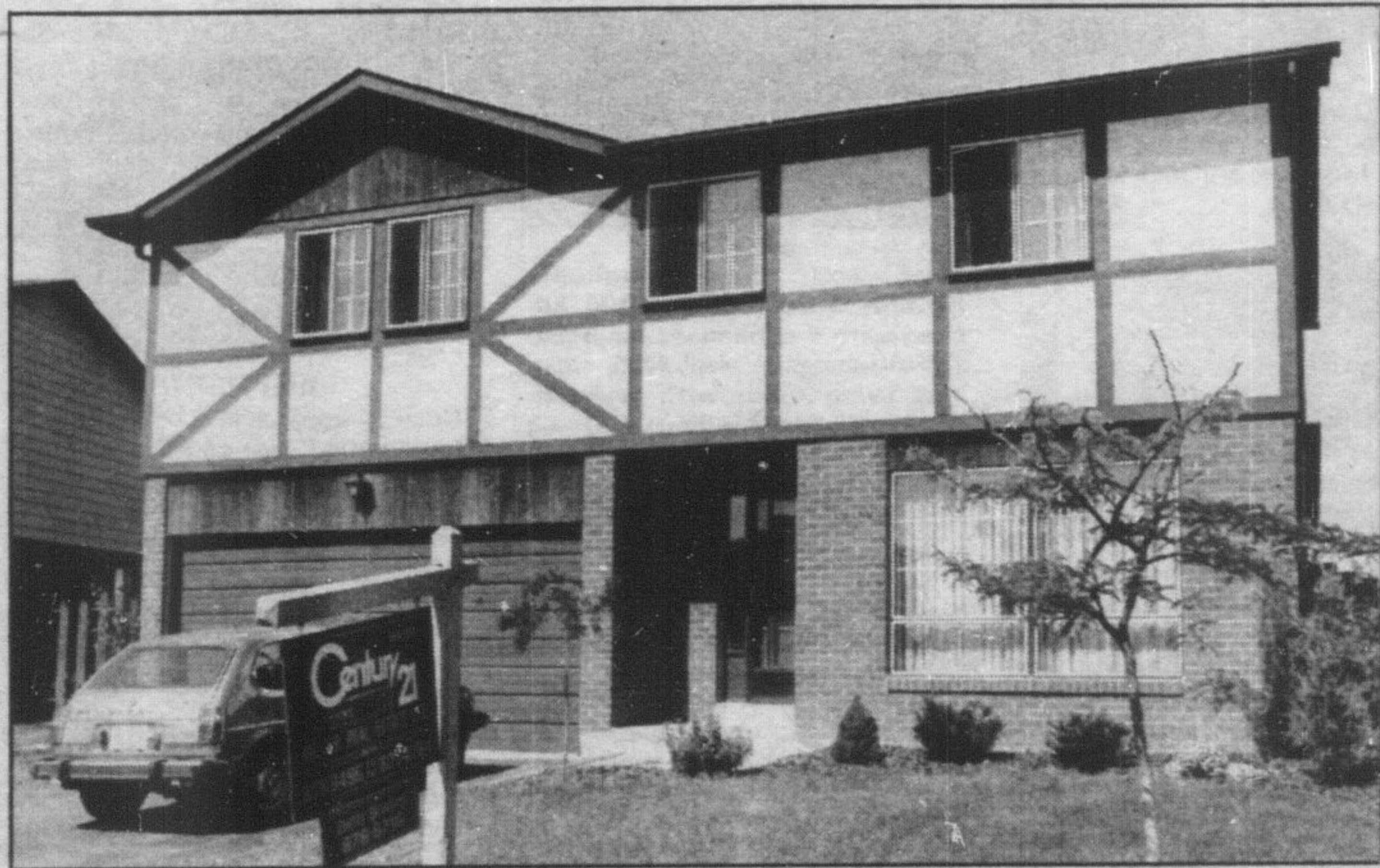
Listed at $104,900, this two-storey home has much to offer for the price. It is located in a quiet, but well established area of Milton with close proximity to schools and park area. This home has four large bedrooms and the rear yard is completely fenced—especially nice for the family with young children.