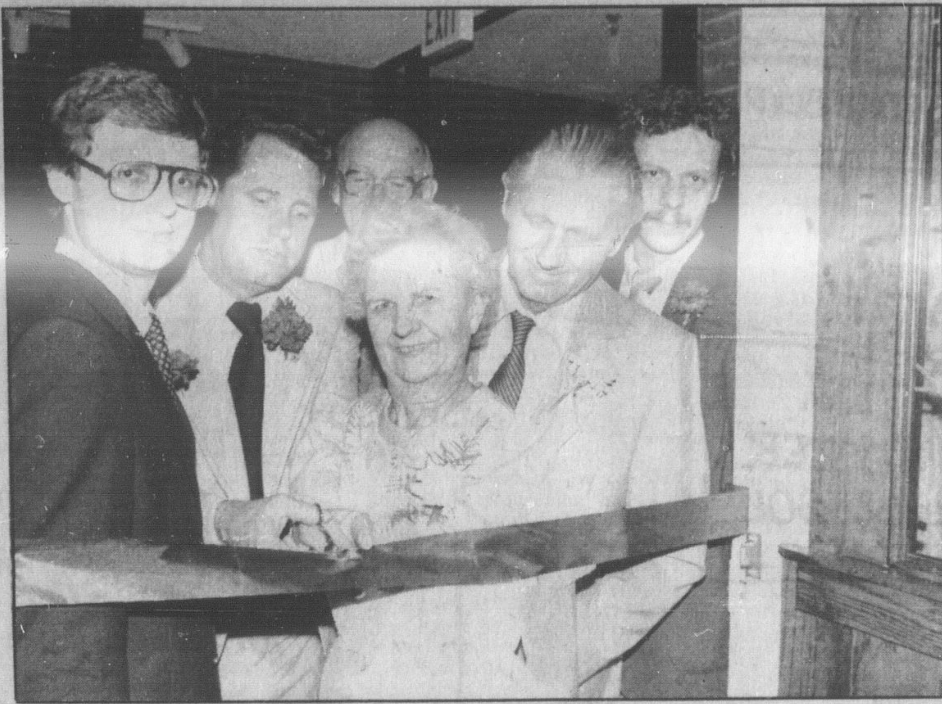
Milton's first United Way campaign and the brand-new addition to the Herigate Inn got an official kick-off last week in facilities donated by the hotel. Cutting a ribbon to officially open the hotel's new restaurant "Original Hickory's" is