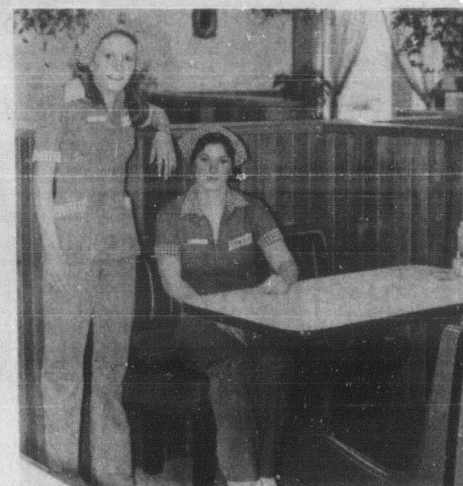
Just a few of the friendly and courteous staff waiting to serve you at Dixie Lee.

The month of May marks a special celebration for Dixie Lee in Milton. It is our first anniversary, and we would like to take this opportunity to say "thank you" to all of our loyal friends and customers. Your support in our first year has been appreciated and we look forward to serving you the finest chicken and seafood in the year to come. An all-Canadian food company, we specialize in fast, wholesome food at an affordable price.