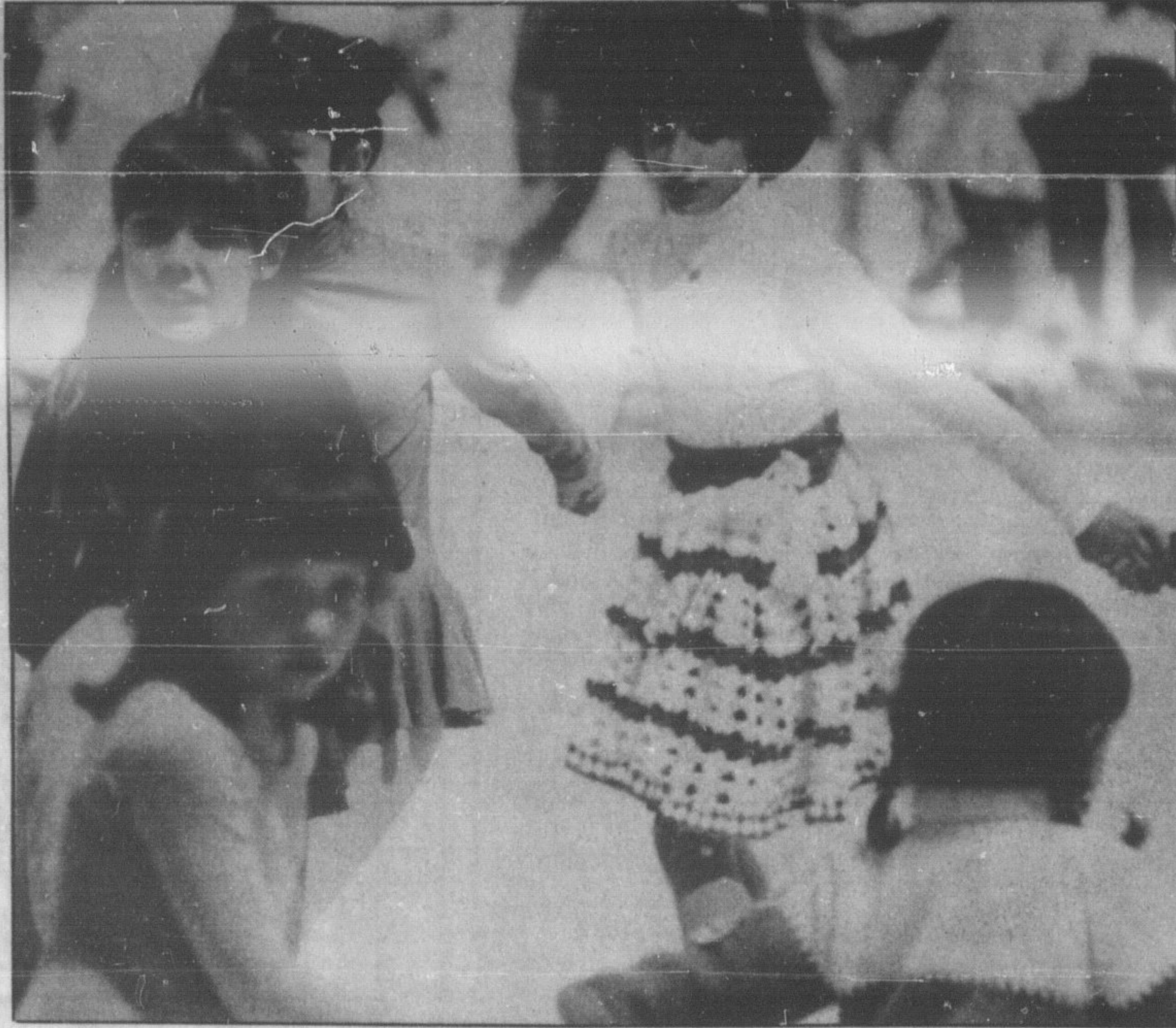
The Sports Centre was filled Sunday afternoon with interested spectators as Milton Figure Skating Club held its biennial Pop Concert. Every facet of the club was featured in the club's finale to a successful season.

Action gets underway at 5 p.m. and concludes with the championship game beginning at 10.15 p.m. Refreshments will be available.