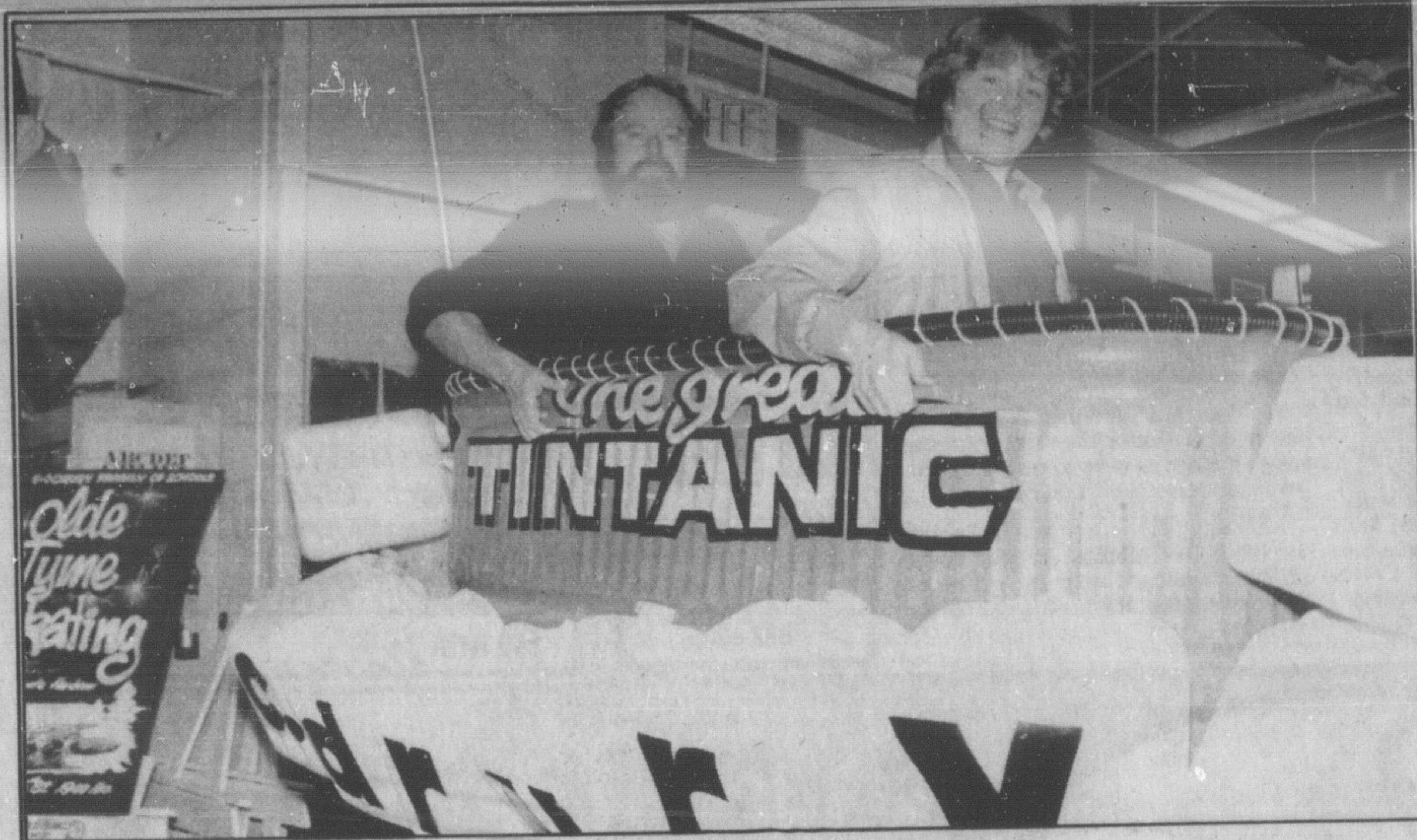
A crazy boat