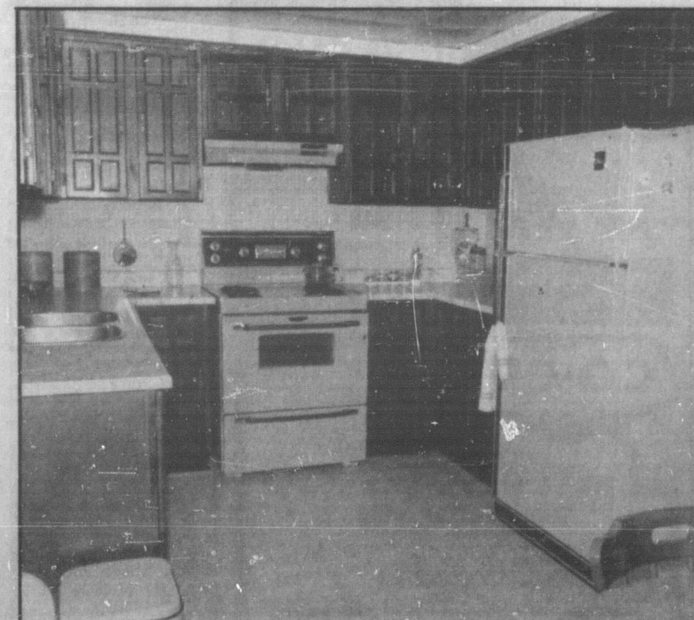
There is no cupboard shortage in this kitchen. This large room easily accommodates a breakfast area as well.