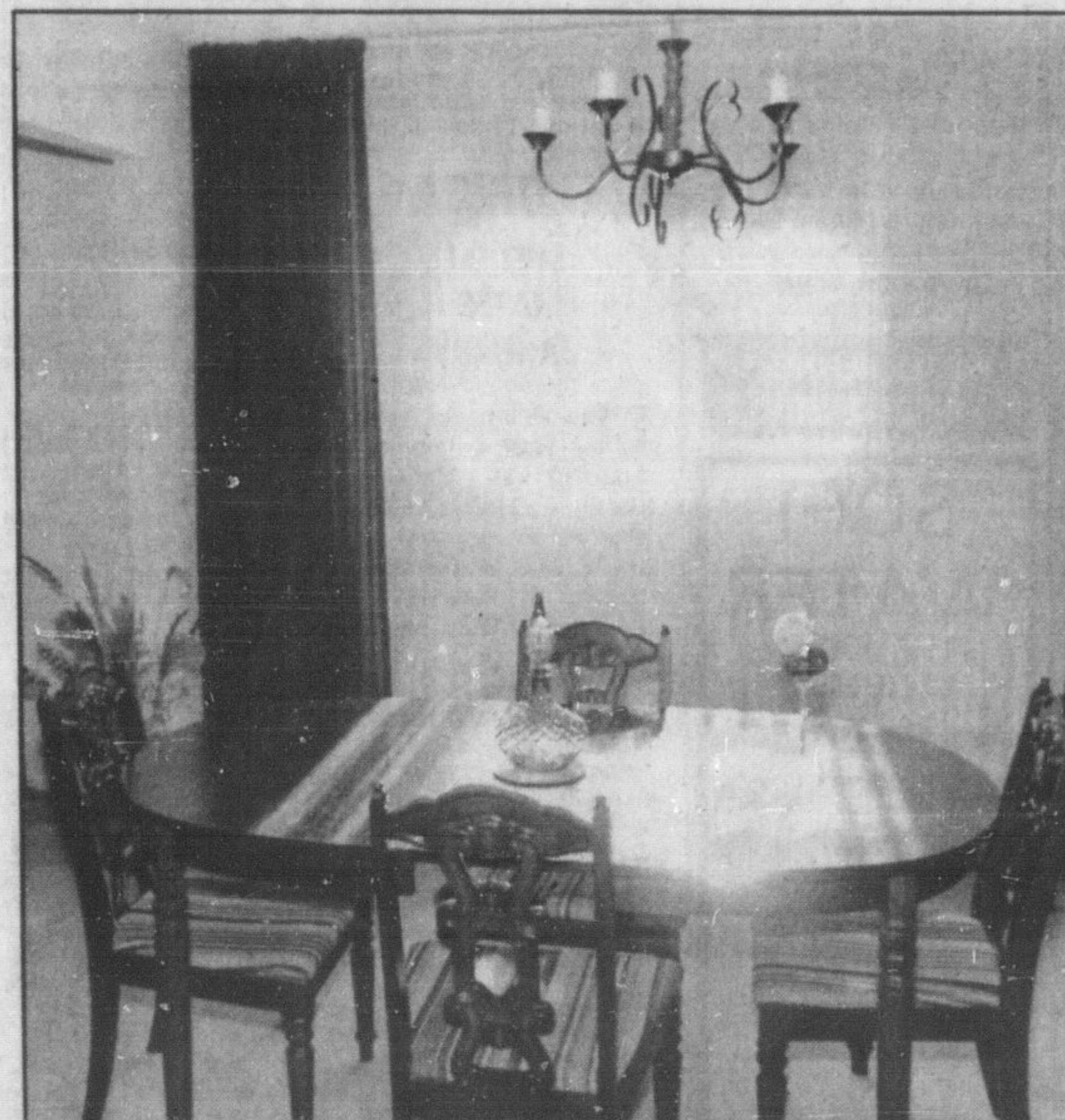
Formal dining is a treat in this open dining room adjoining the living area.