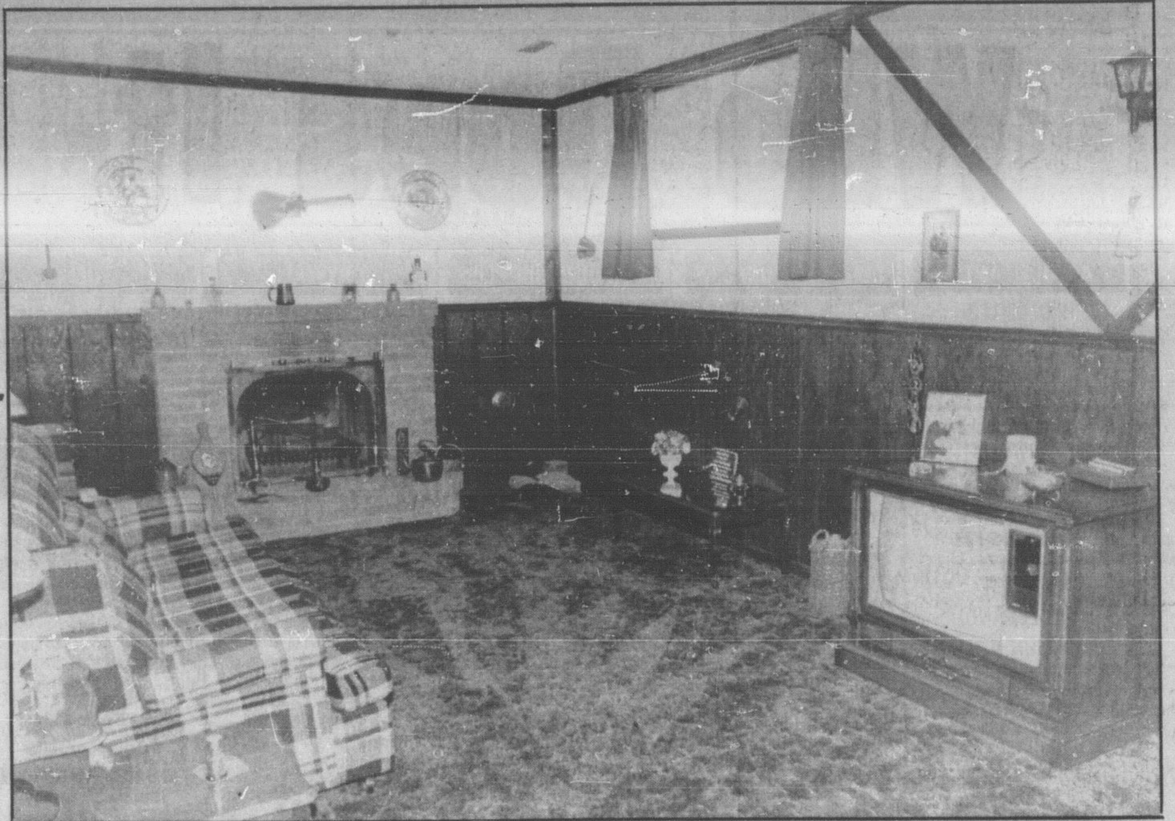
Entertaining on a large scale? This lower level family room is further enhanced by a beautiful wood burning fire place. This home has been tastefully decorated in neutral tones and includes a high grade of broadloom throughout.