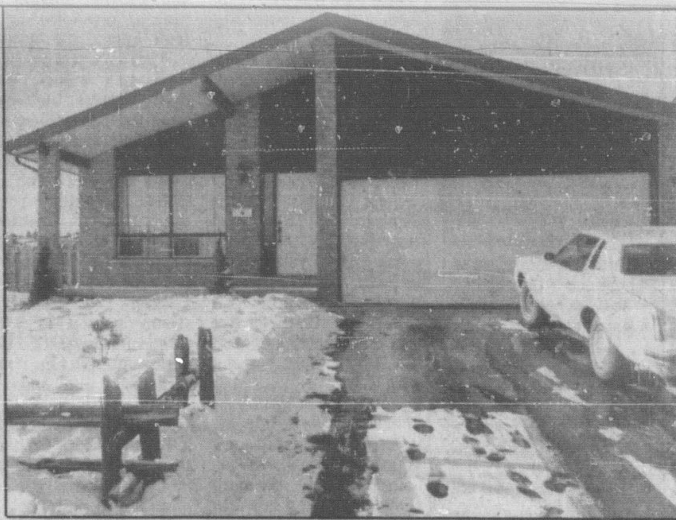
Located close to shopping, schools and recreational facilities, this lovely home offers many attractive features.