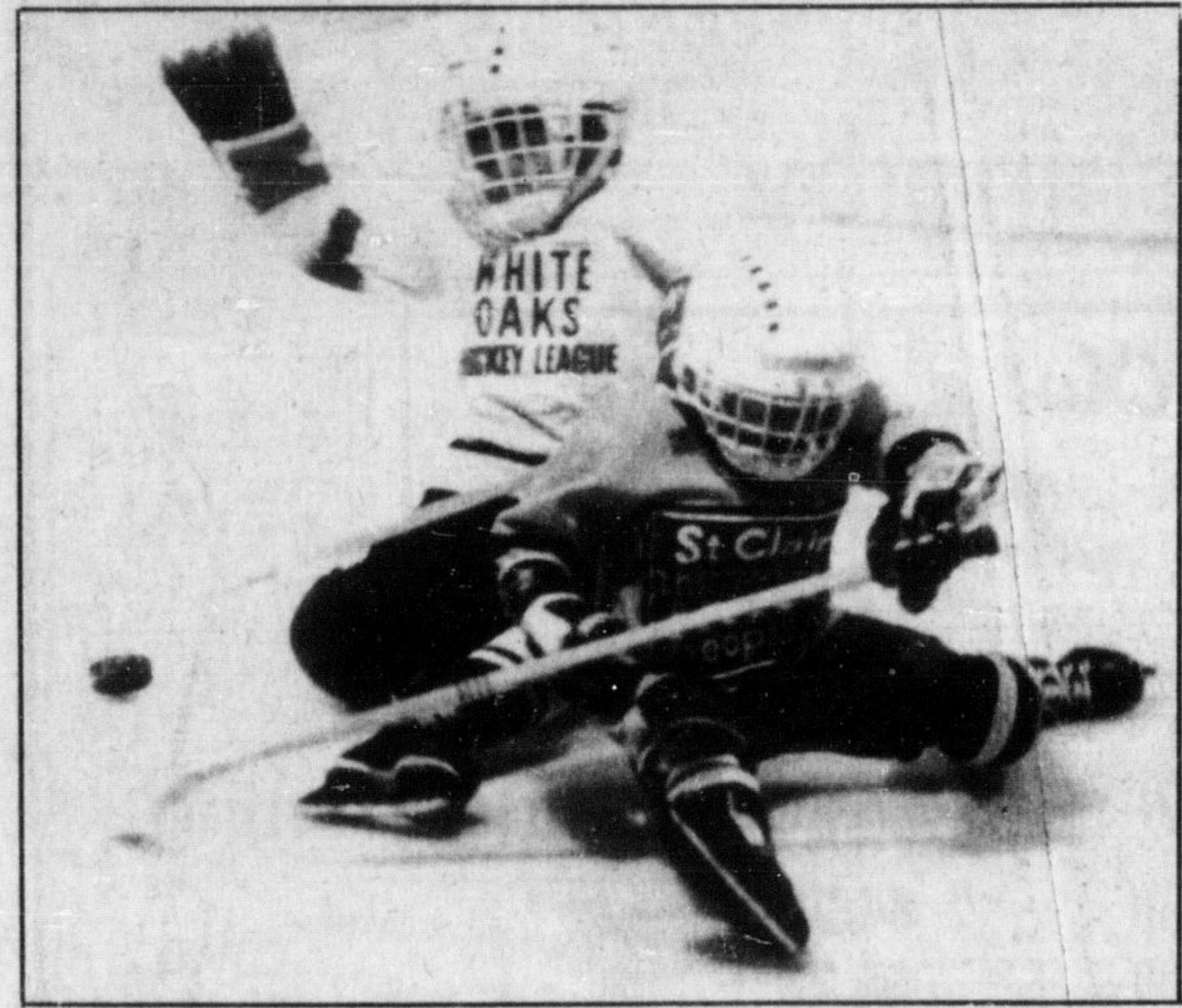
Collision: The novice-aged players (eight years and younger) are the most fun to watch. Skill is something they learn as they go along. Sometimes, standing up for an entire shift without falling over is a feat. These two players are still working on it.