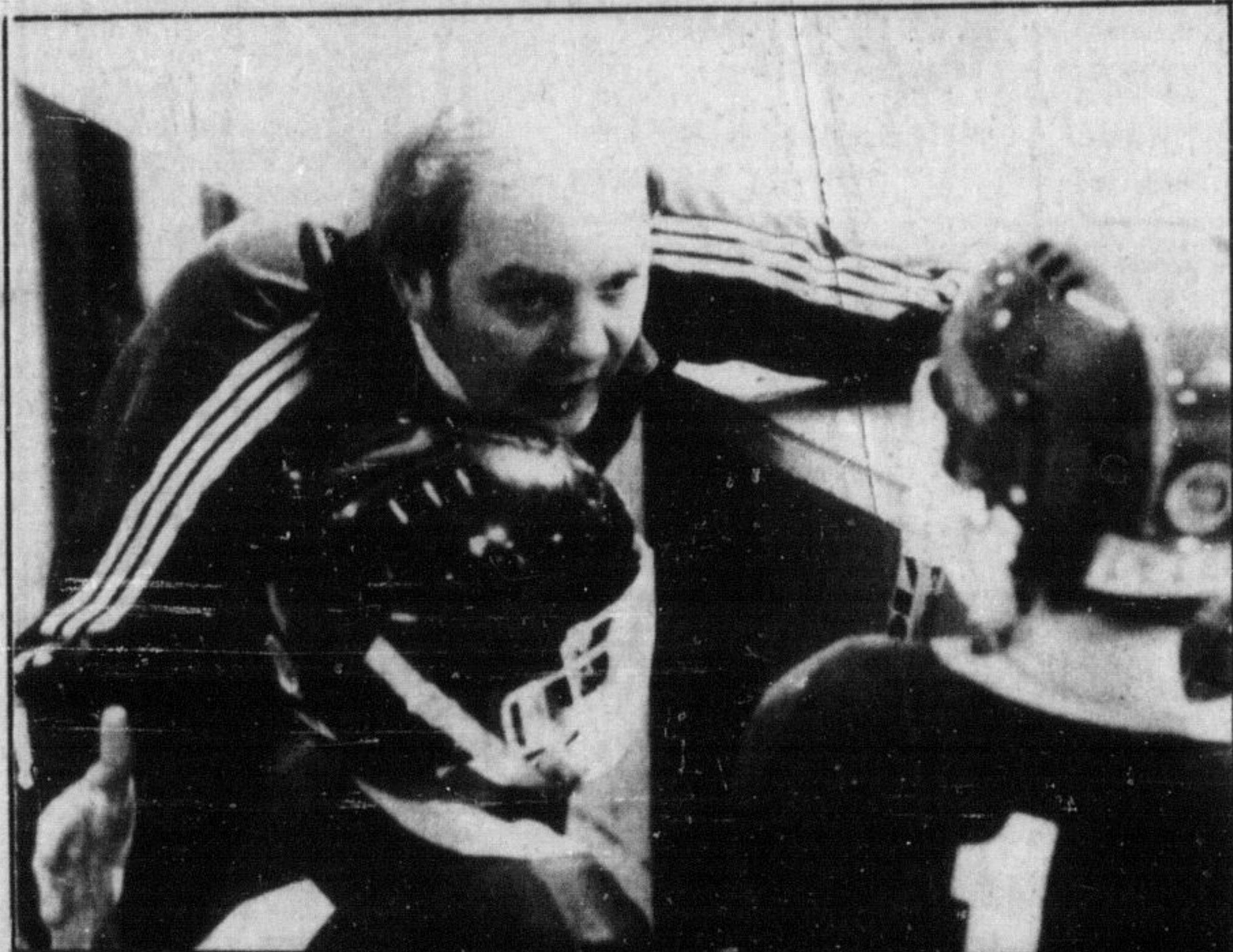
Advice: Two players receive some advice from their coach while the game is in progress. Sometimes, the kids don't see their mistakes until after the play.