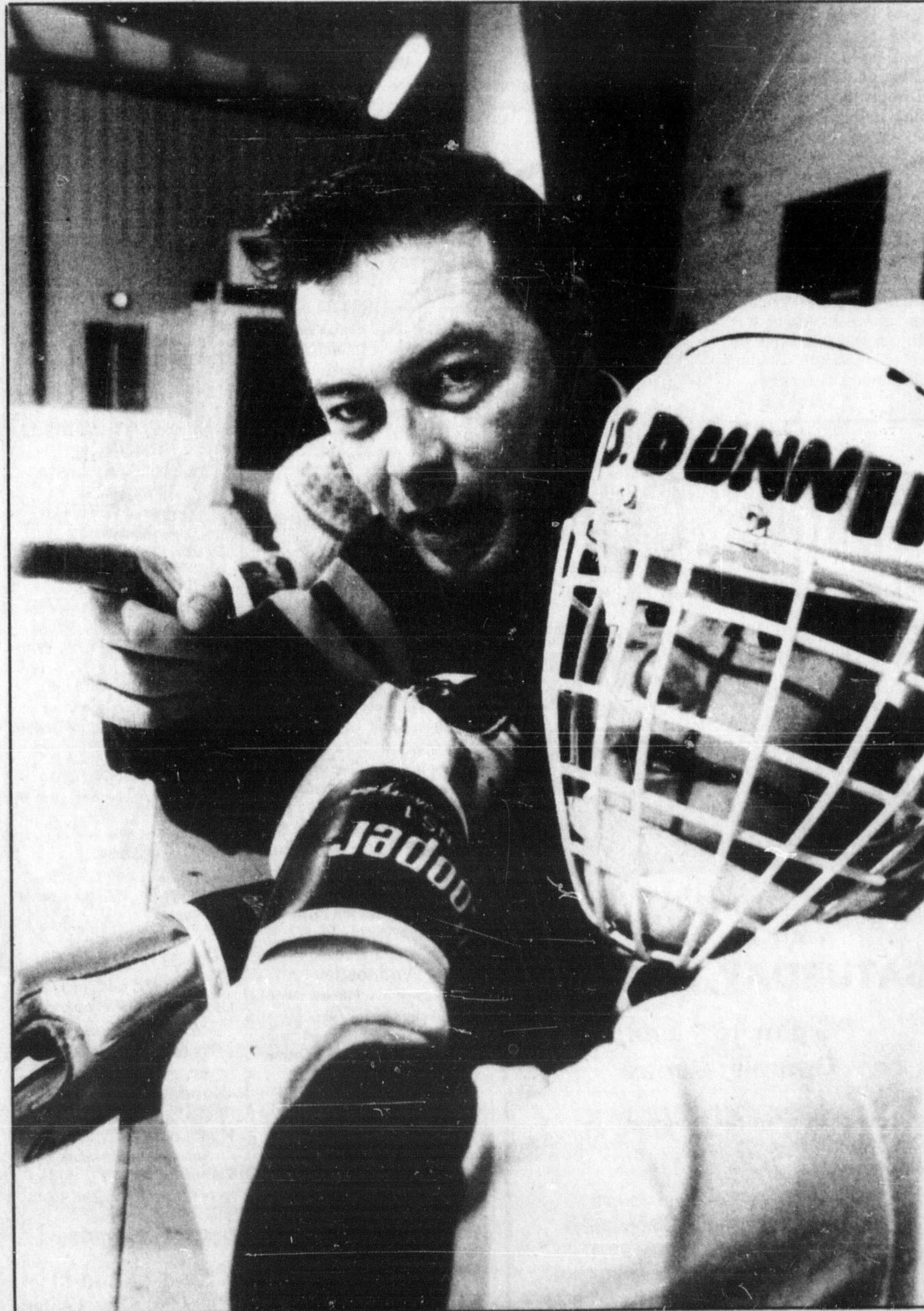
Watch here: A coach gives some directions to one of the players before he goes out on the ice. Explaining on-ice positioning is just one of the responsibilities of a house league coach. Milton Minor Hockey is now in the middle of playoffs, setting up for the grand championship day when all teams will play for their division titles Sunday April 5.