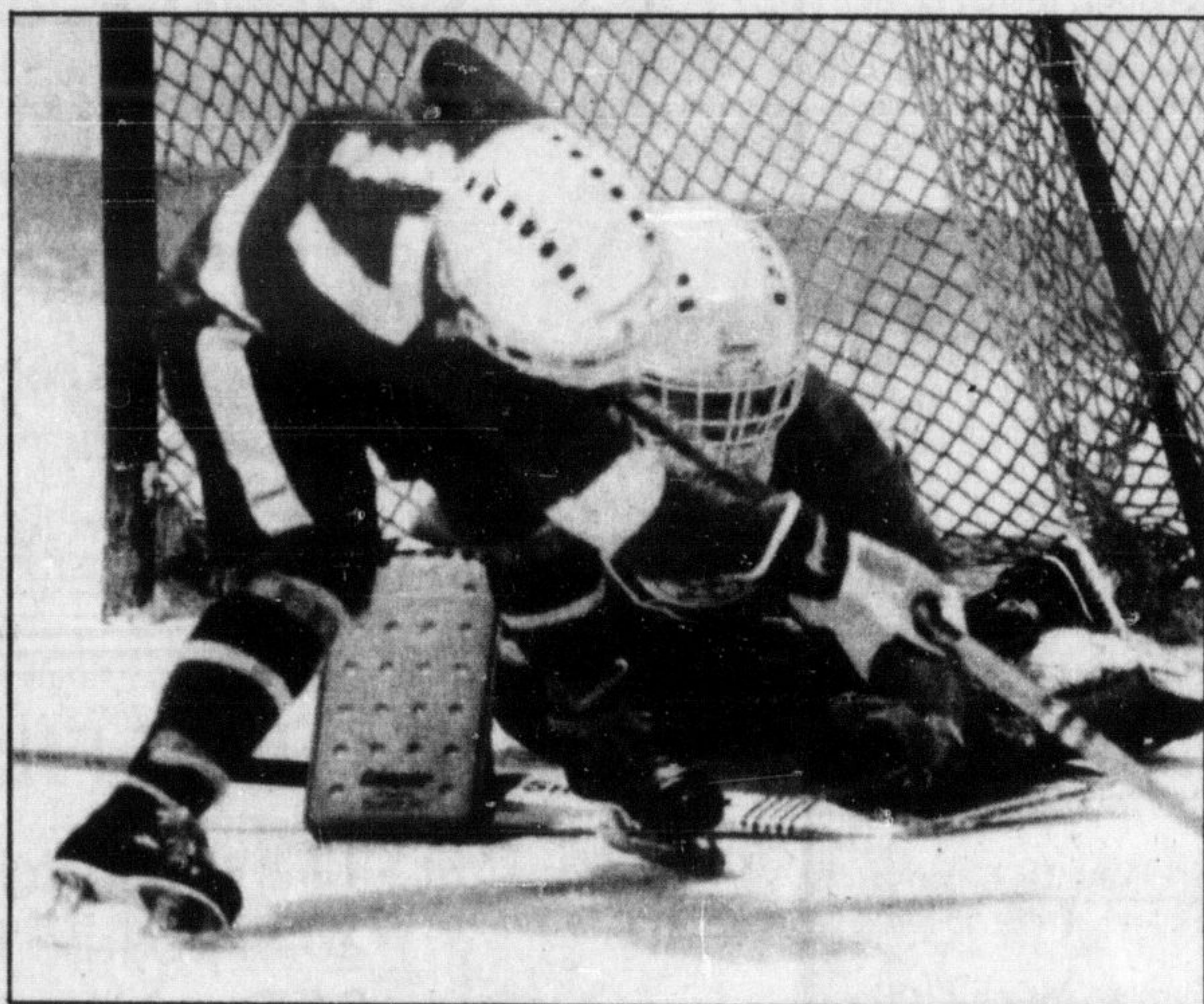
Helping hand: The goalie receives something in the way of help from one of his defencemen. Goalies at the young age group aren't very agile. More often than not, they play as if they were playing street hockey.