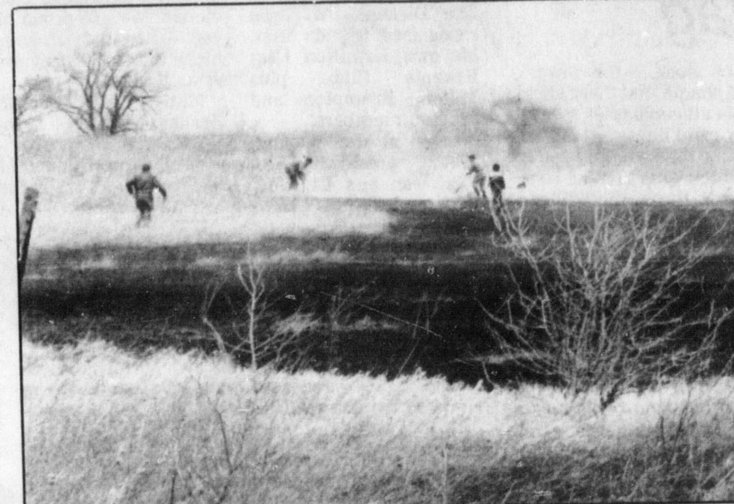
Four-hour blaze. Milton firefighters were kept busy with grass fires over the weekend that included a fire Sunday that swept through 20 acres of scrub and brush land.

The station platform for the Milton station is built and work on the ticketing building is expected to begin in May.