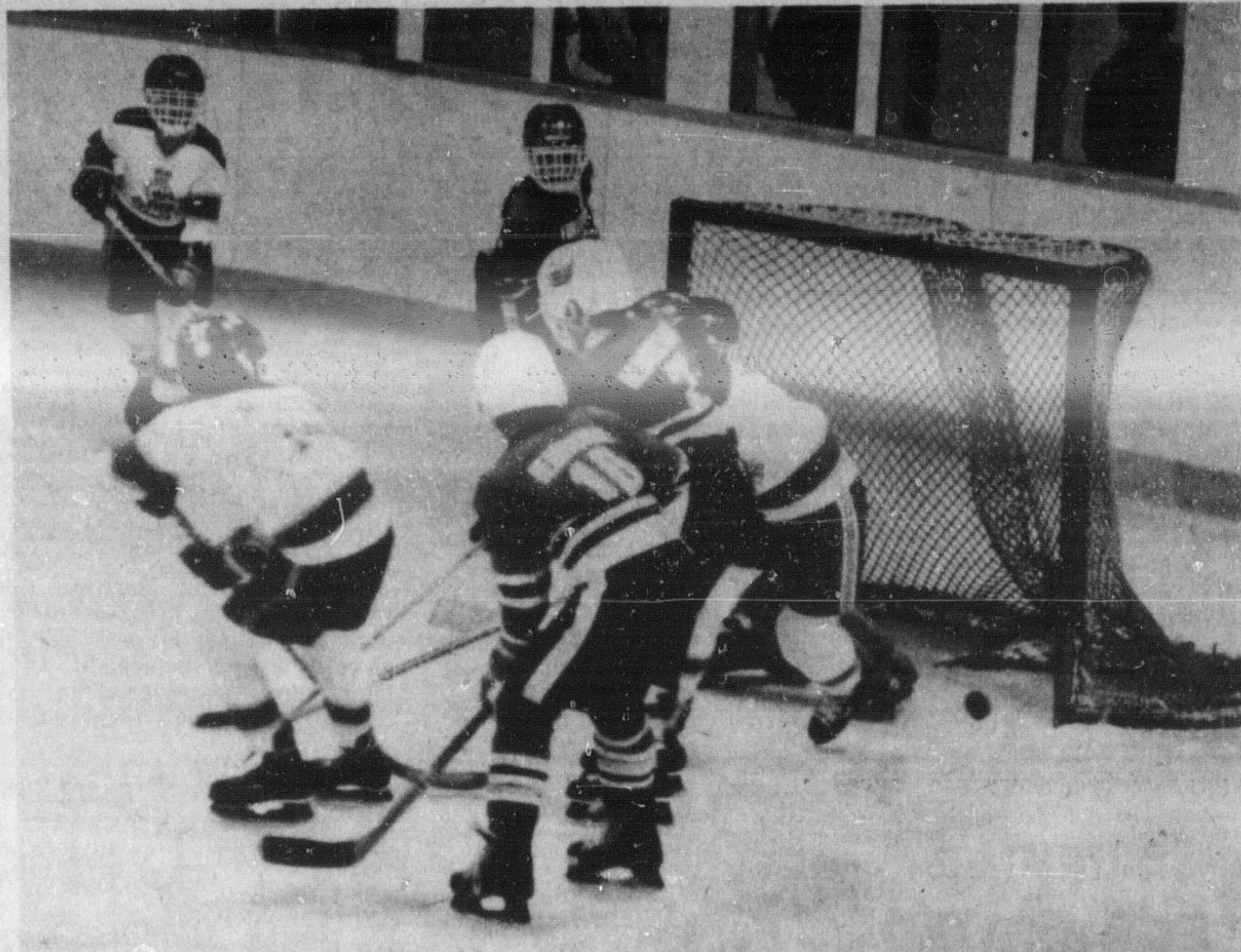
Allaround the net: Milton Legion atoms hum around the Georgetown net in the overtime period but the squad couldn't buy a goal as Legion was put out by Georgetown in three games. Legion bounced back from a 2-0 disadvantage with a pair of goals in the third period to force overtime.