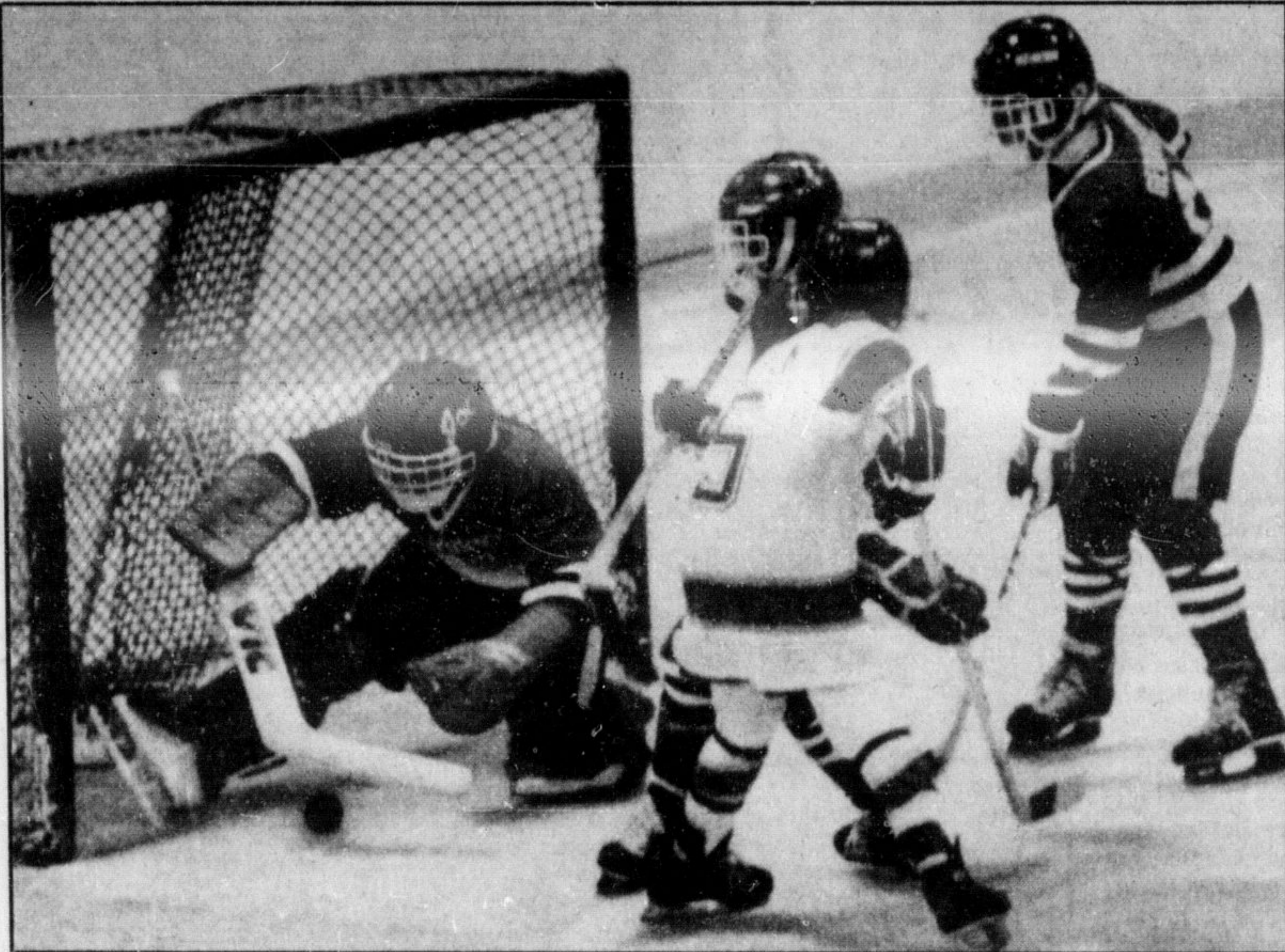
Loose puck: The Georgetown goalie scrambles for a loose puck while Optimists hover around the net. A spirited Milton squad handled Georgetown 3-1 in a big game. Optimists made it two wins with a 5-2 win over Oakville.