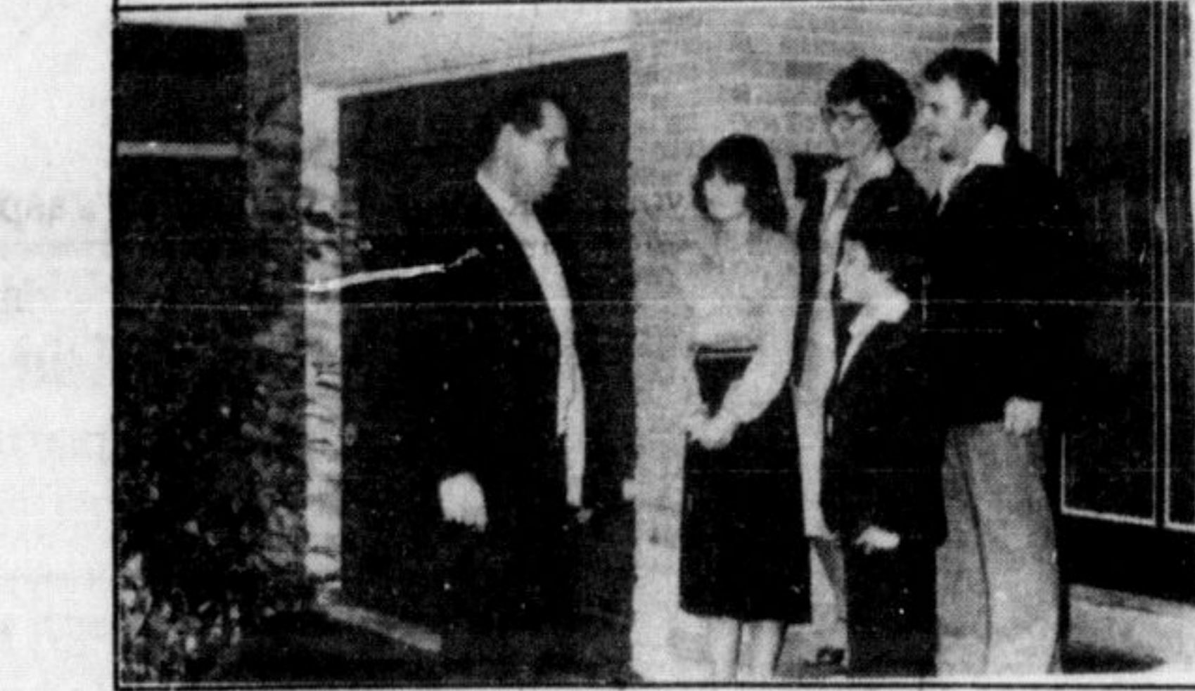
LIFESTYLE Careful long term planning is essential. Land uses must be compatible with existing future development so as to protect our quality of life.