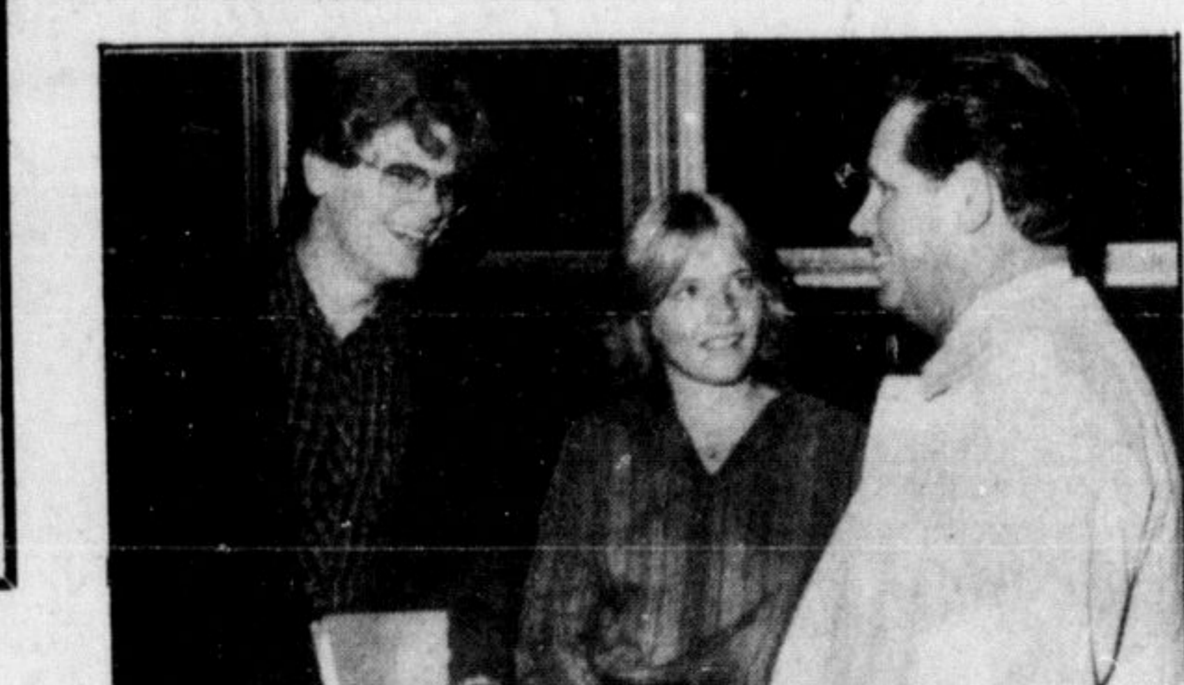
YOUTH Milton's young people of today represent our leaders of tomorrow. It is imperative that Milton's leisure programs are designed to meet the recreational needs of all interested groups of all ages.