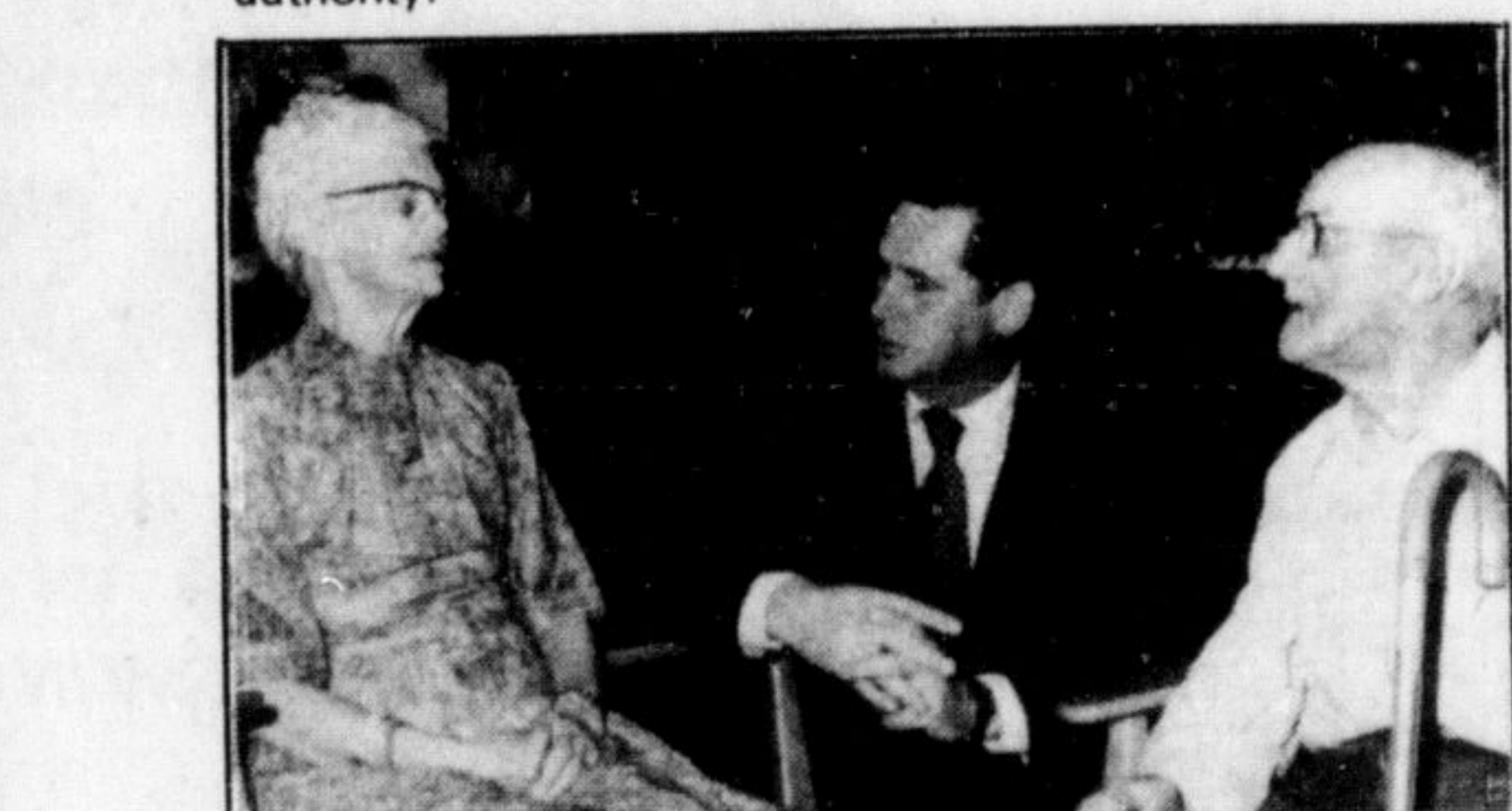
SENIOR CITIZENS Our senior people are the town's quietest, natural resource. We must support programs to improve their lifestyle and ease the costly property tax burden for those on fixed incomes.