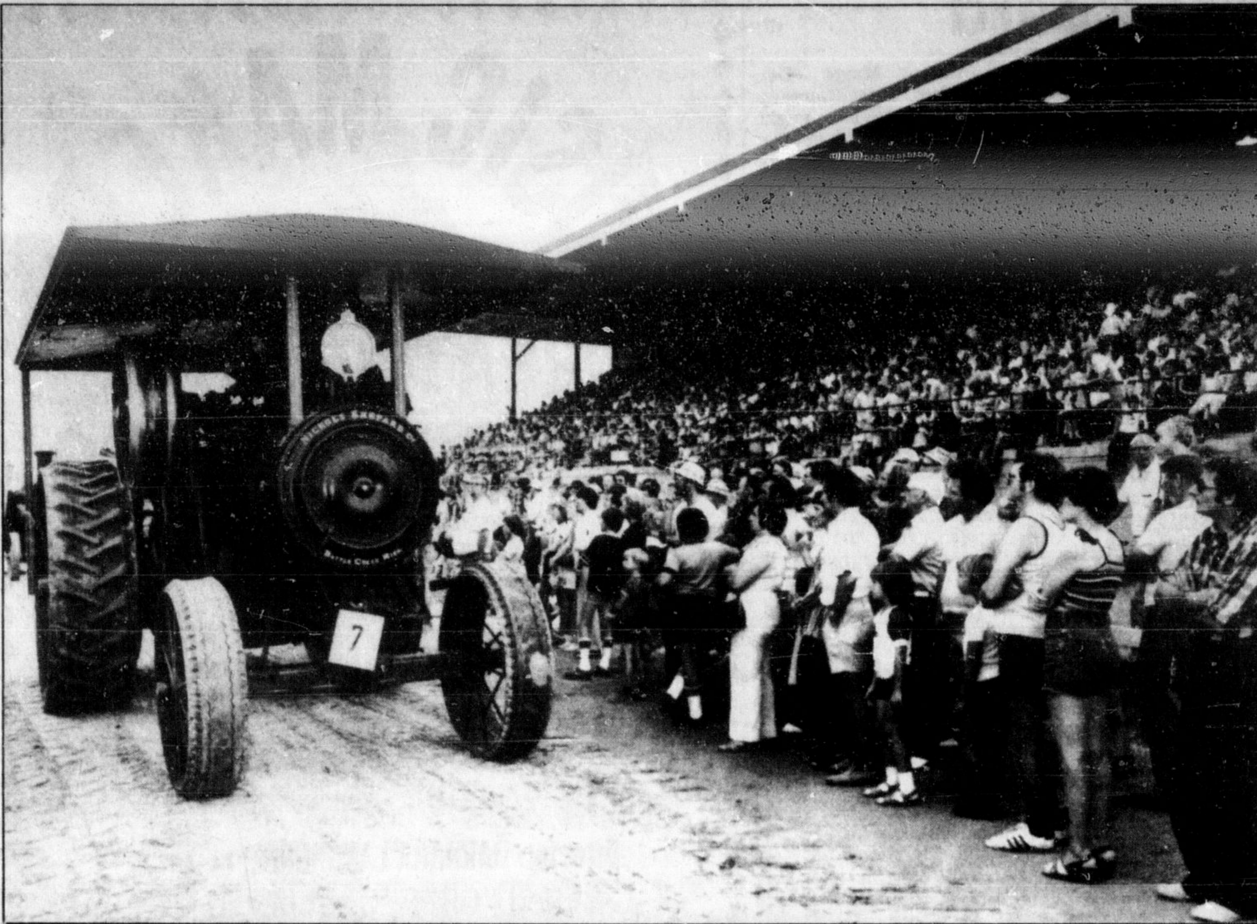
Big crowd enjoys show. Thousands flocked to the 20th edition of the Steam-Era reunion in Milton labor day weekend, and enjoyed every minute of the four-day