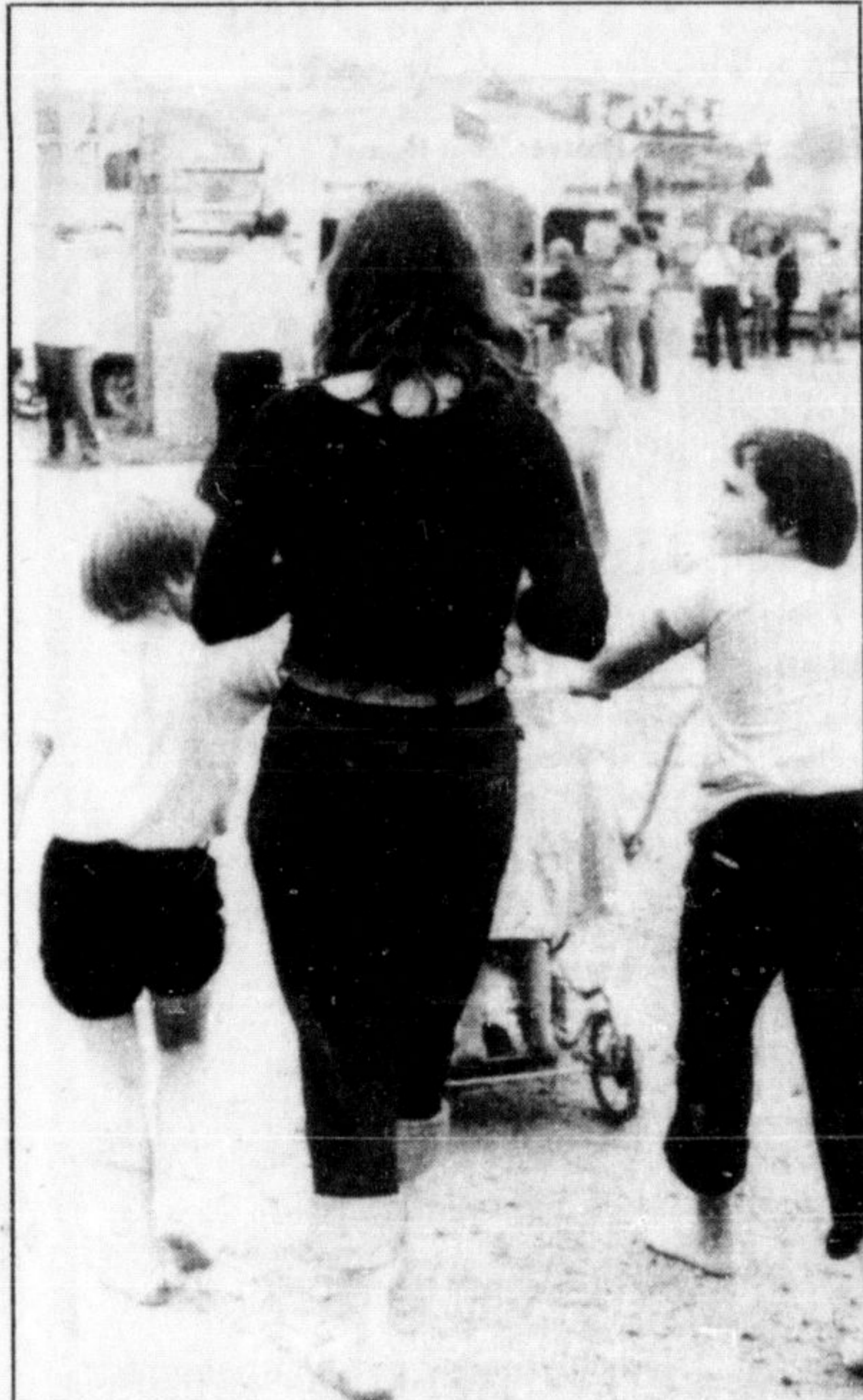
Barefoot and muddy. That's how many Steam-Era show-goers ended up on the weekend, thanks to the rains. They saved the shoes from a muddy bath and went barefoot instead.