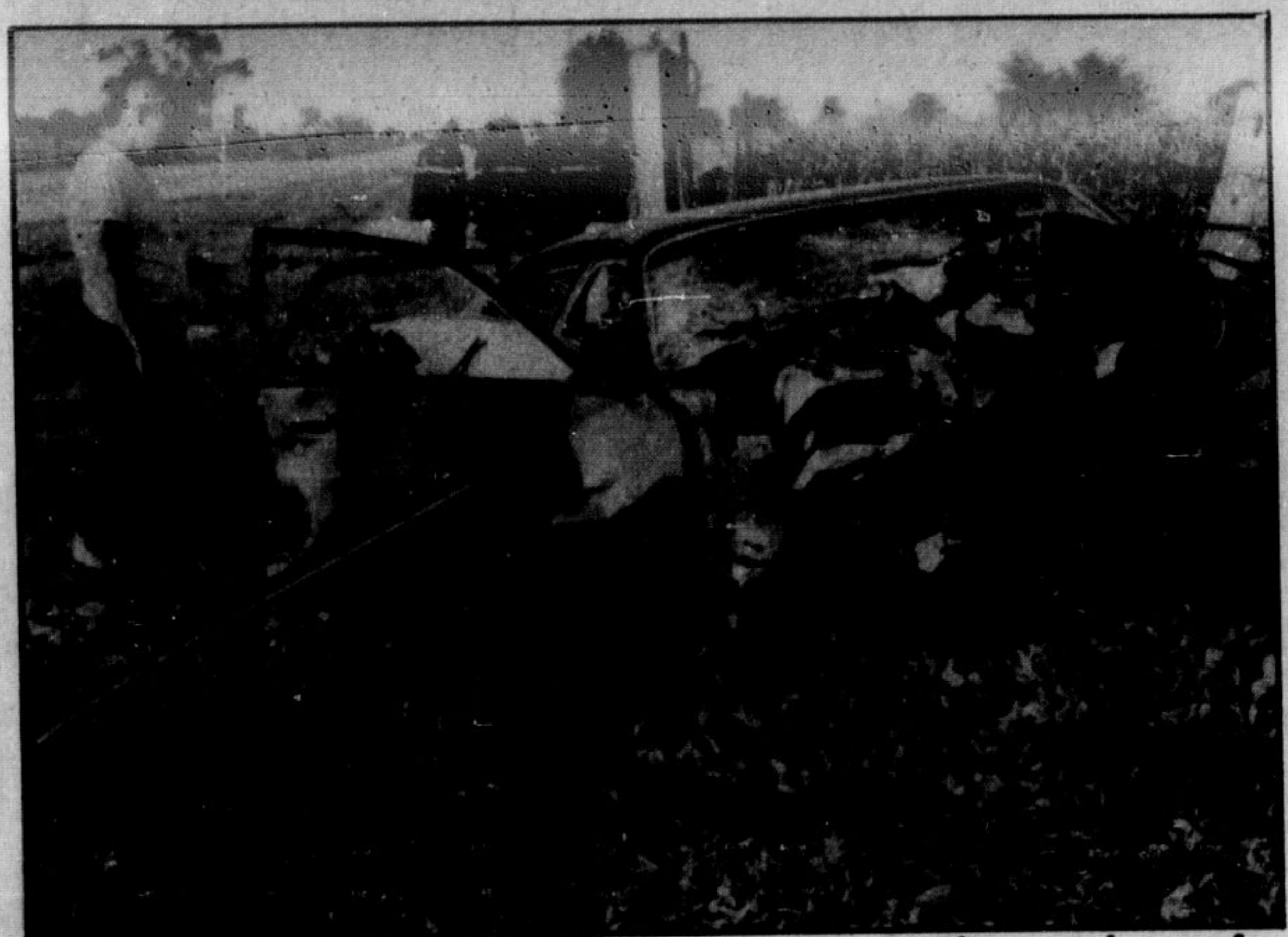
The ultimate price. A Milton firefighter surveys the wreckage of a car in which a 19-year-old Oakville youth died. The young man, driver of the car, plunged through an intersection, killing two other men.