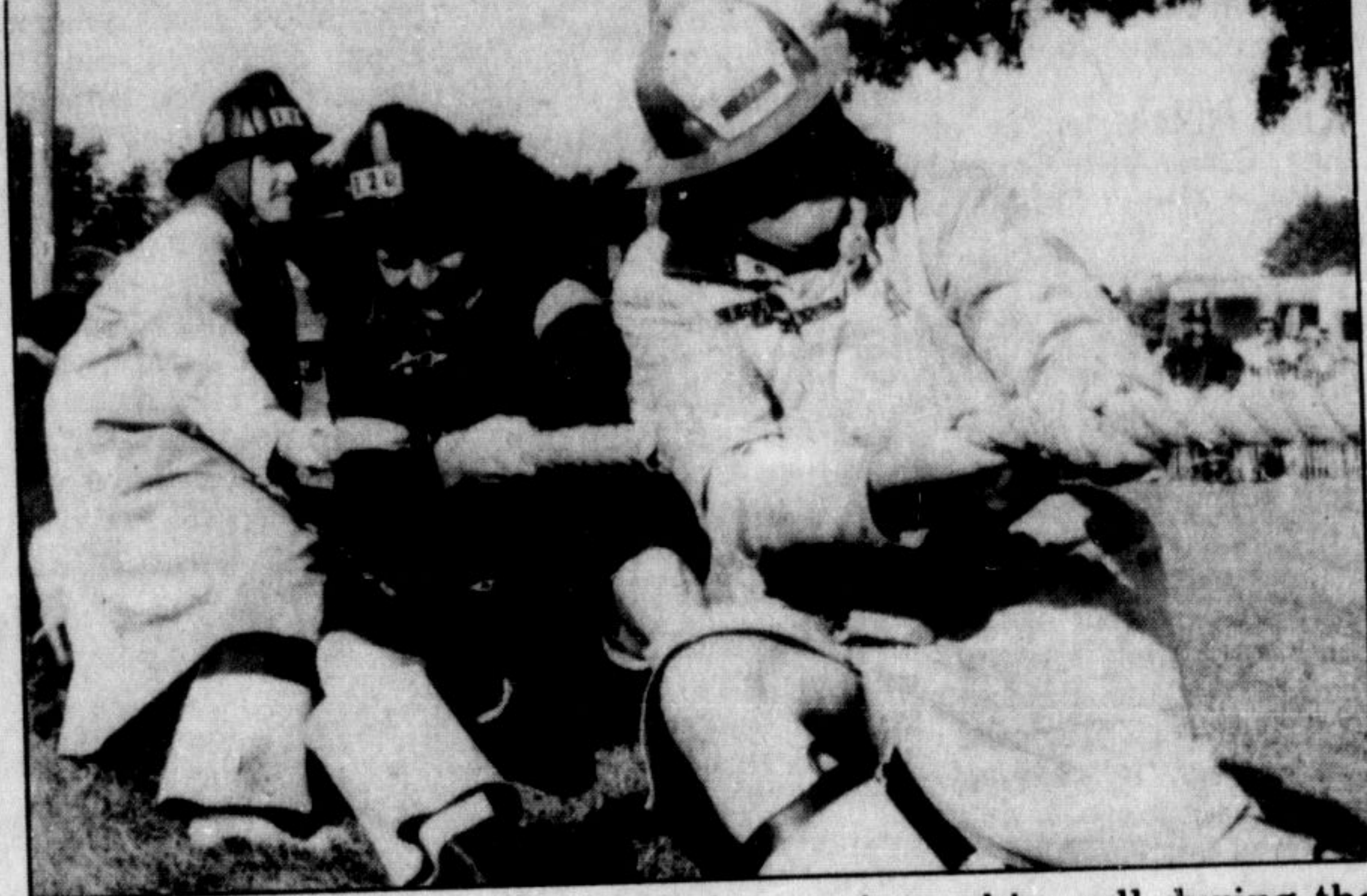
A Mighty Pull. Dunnville firefighters give a big pull during the tug-of-war competition Monday afternoon. They lost to Schomberg firemen.