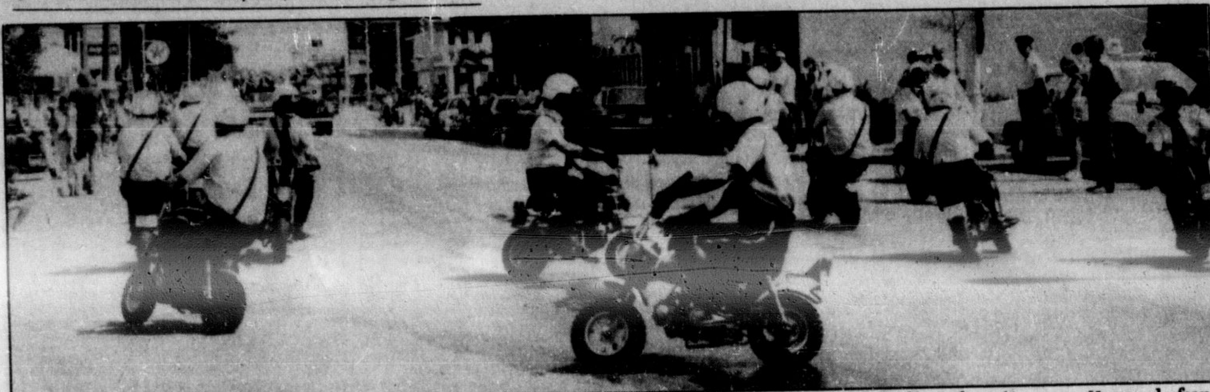
Having a good time. Hamilton Shriners rode circles around Halton Regional Police, but it was all good fun.