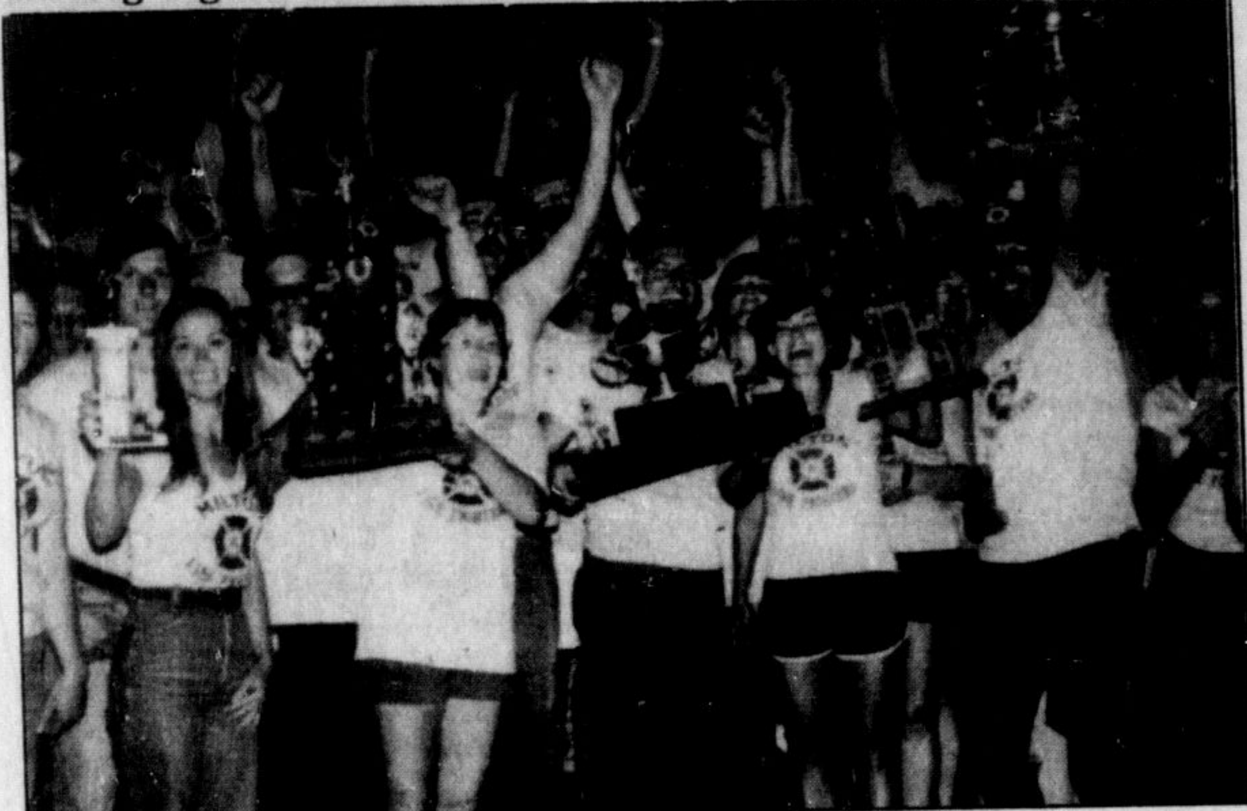
Winners! The Milton Fire Department had time to play games, despite being host of the 1980 convention and they came out winners in several classes.