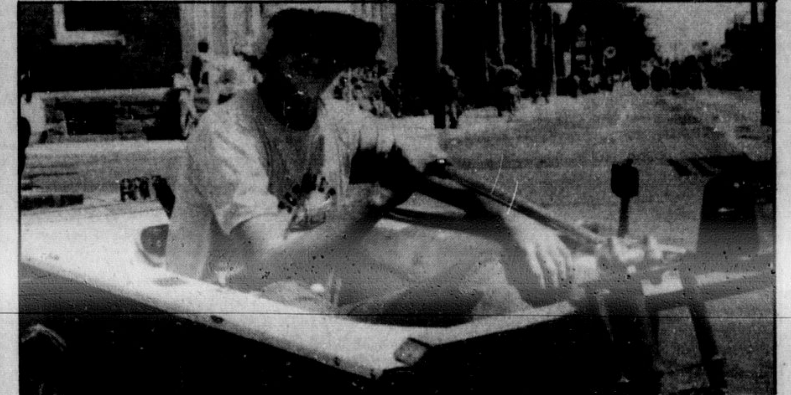
Bathtub: The Schomberg department brought along its own motorized bathtub which was entered in Monday's grand parade through the streets of downtown Milton.