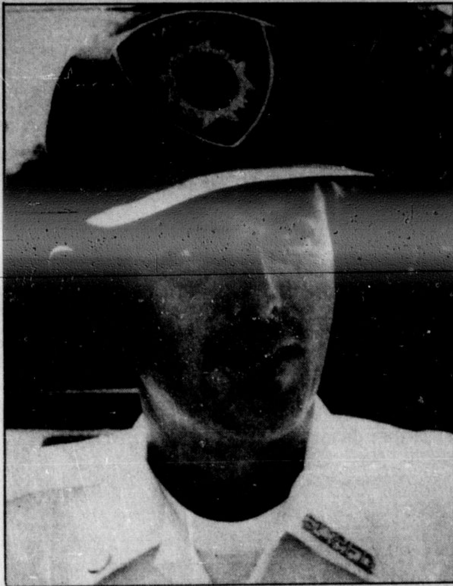
Drews: Credits Milton deputy chief with giving him the knowledge to land a good position with a Florida department.