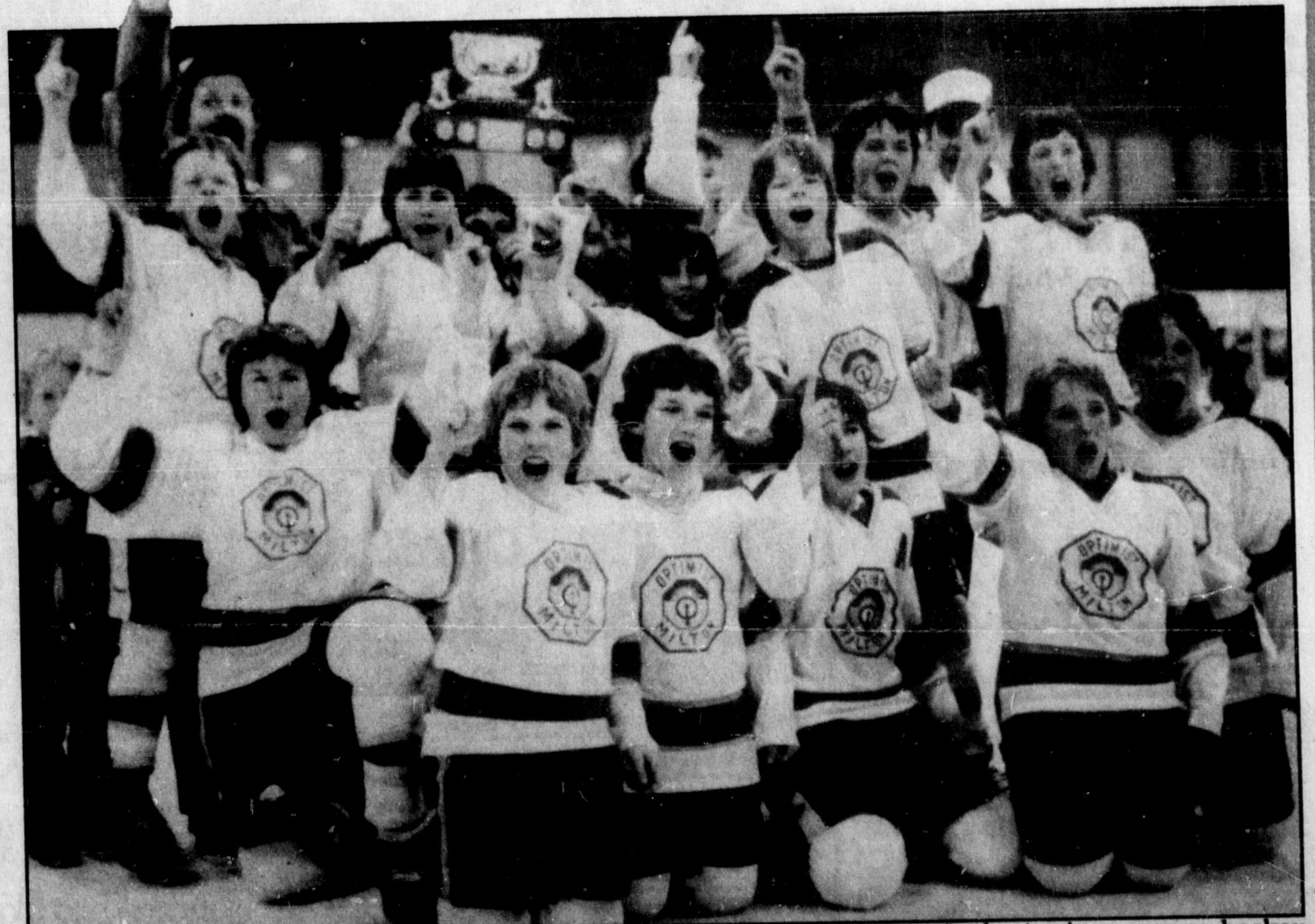
We're Number One: Optimists celebrate showing clearly which town has the best minor peewee hockey team in AA OMHA competition. The team isn't finished yet. Optimists will travel to Rhode Island next weekend for a tournament which will see them play their stiffest competition yet.