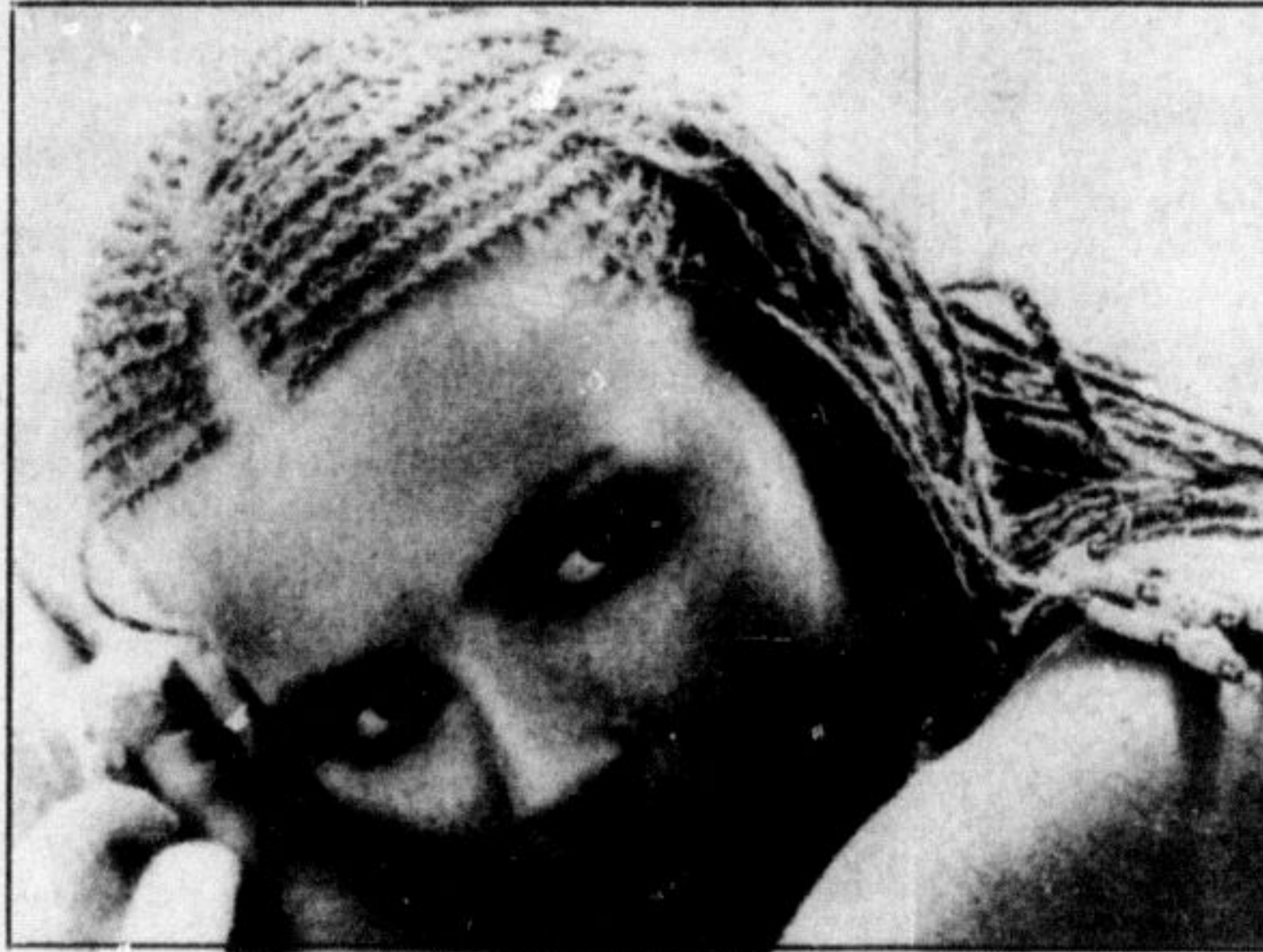
Bo Derek, Dudley Moore's perfect beauty in 10.

RATING: Admittance RESTRICTED To Persons 18 Years of Age or Older