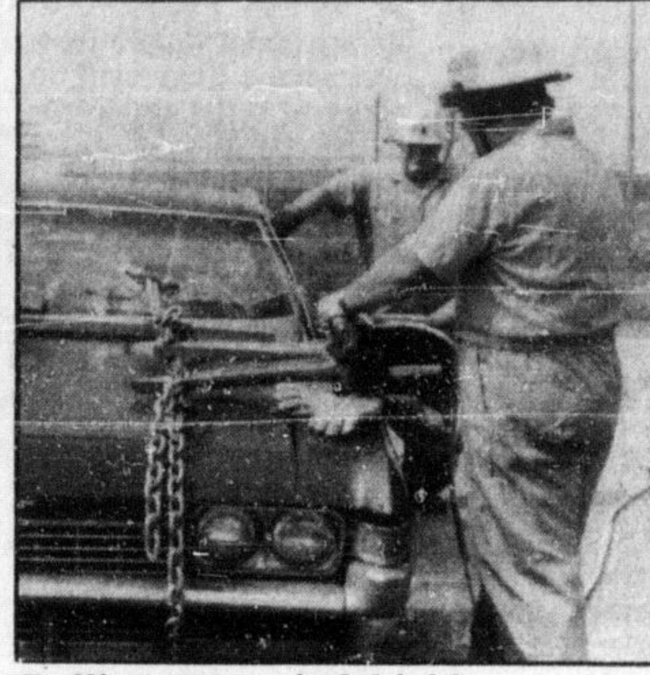
Pulling out a windshield