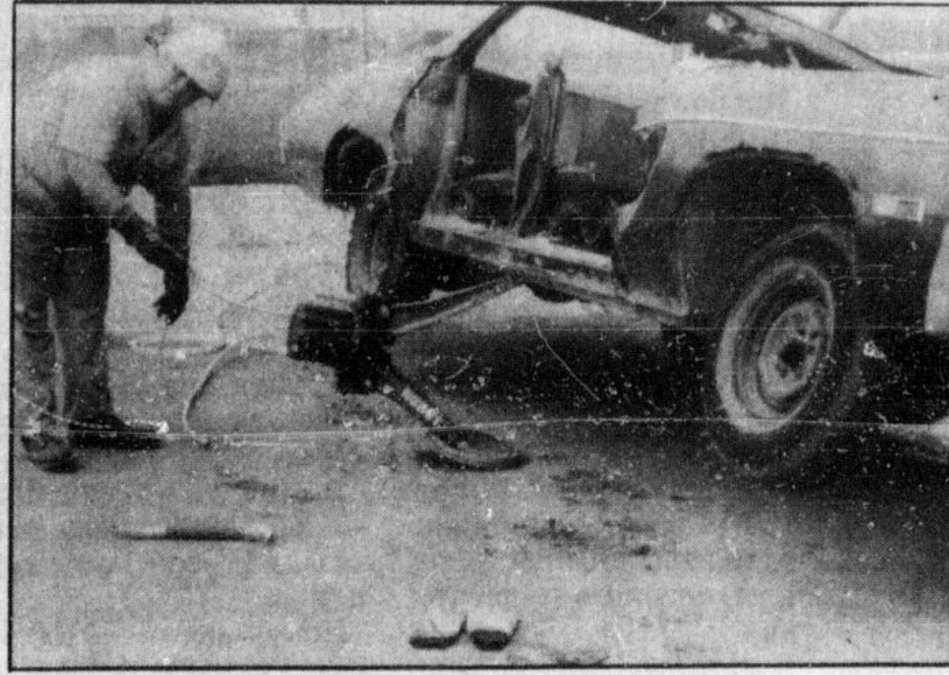
Strong enough to lift a car, bus, or truck