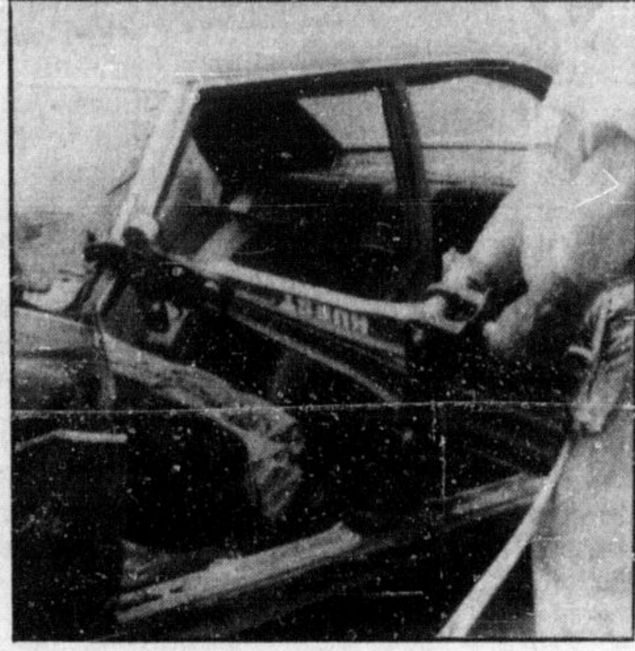
Cutting a roof support