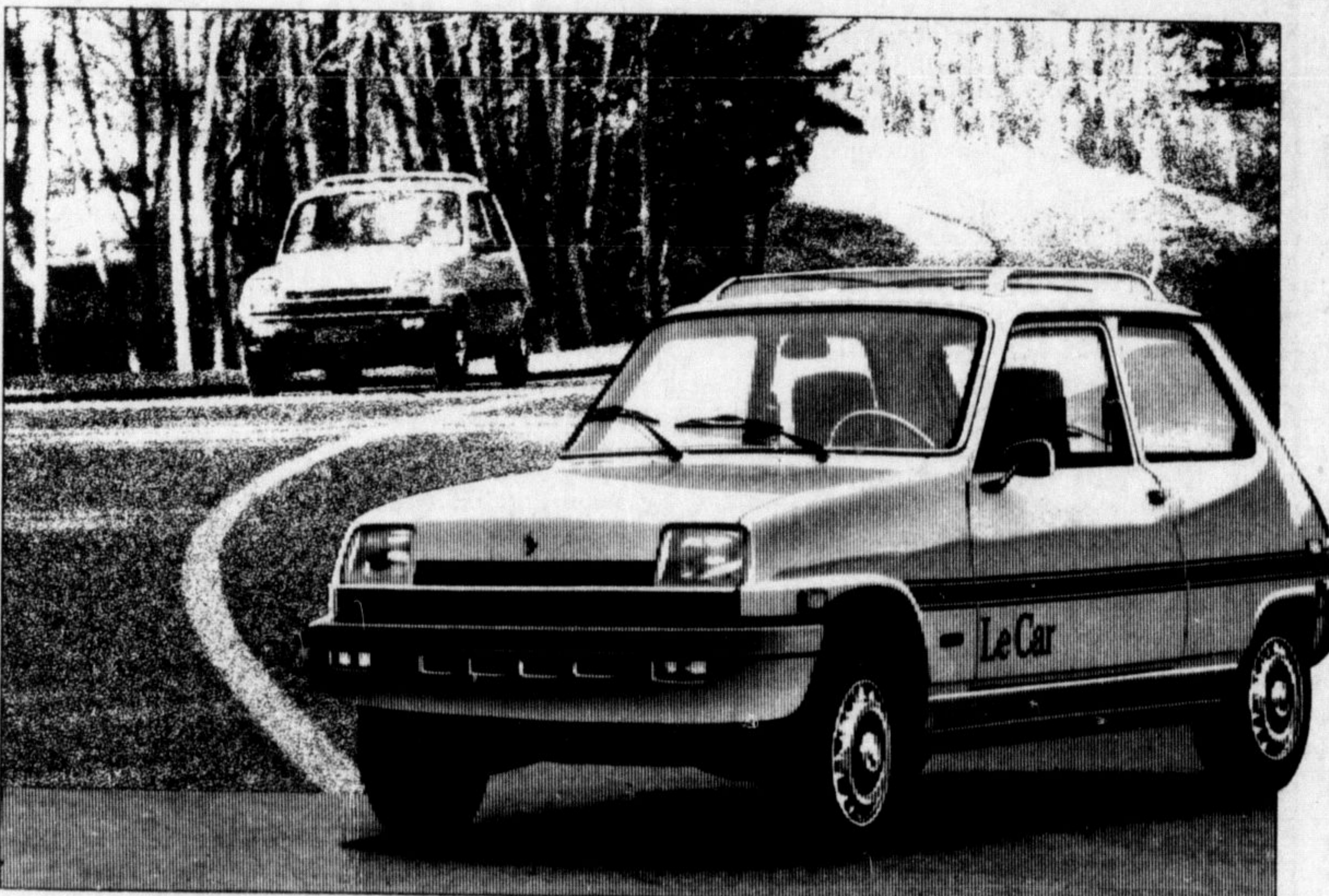
Certain items illustrated are optional at extra cost.

Unfortunately, the phone number was omitted and the newspaper had several enquiries about it. The number is toll-free, 1-800-267-9563.