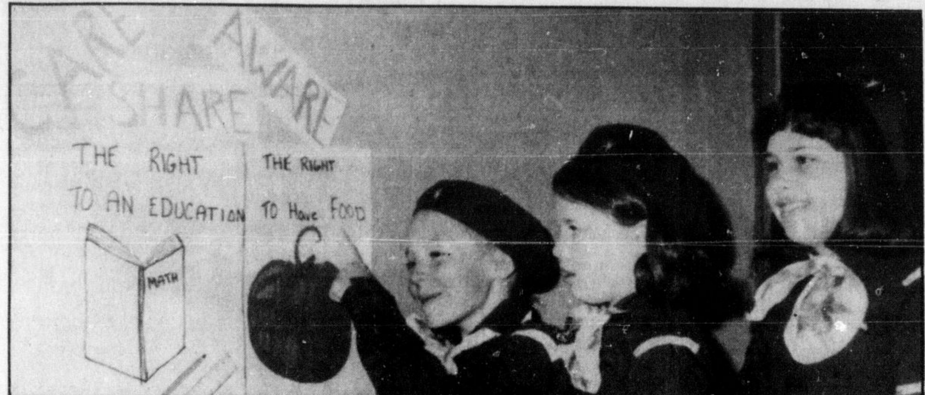
CARE, SHARE AND AWARE is the motto for Brownies during 1979—International Year of the Child. Pineview Brownies

6. The Right to Play is important to have fun and make friends. 7. The Right to good health is important in order to stay healthy. 8. The right to be your self is important because it's not very nice to pretend. 9. The Right to your own religion is important because every one has their own beliefs. 10. The Right to choose your own friends is important because no one else is able to see who you like. It comes naturally. I would give up the right to privacy because the other rights are more important.