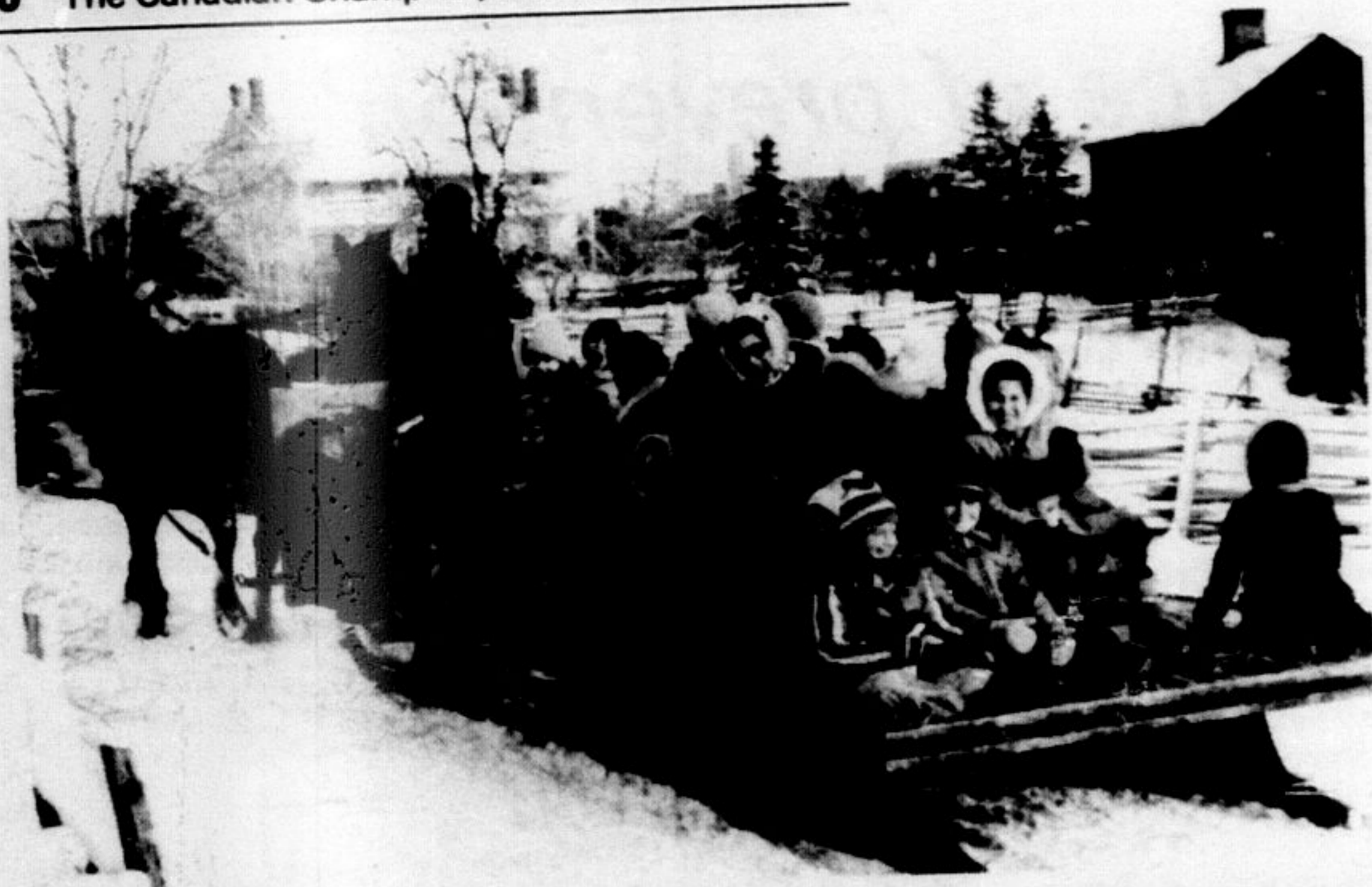
A BLACK CREEK CHRISTMAS just isn't complete without a ride on an old-fashioned horse-drawn sleigh, which are featured daily at Black Creek Pioneer Village until after the holiday season, when they will be available only on weekends.