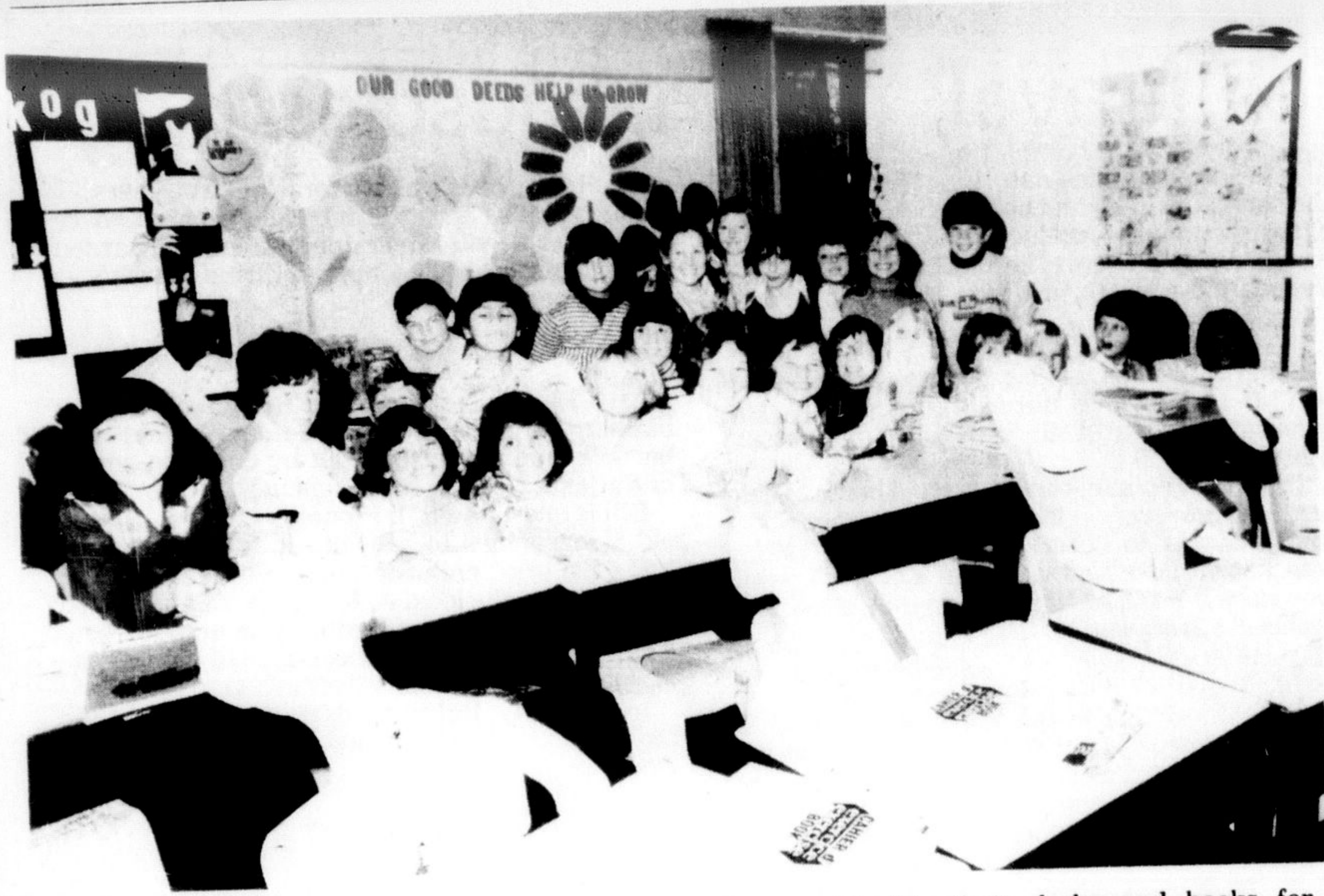
PAPER PUPILS and their real life mates gather together in preparation for parent-teacher interviews at St. Peter's School. The grade four class constructed the paper models of them-