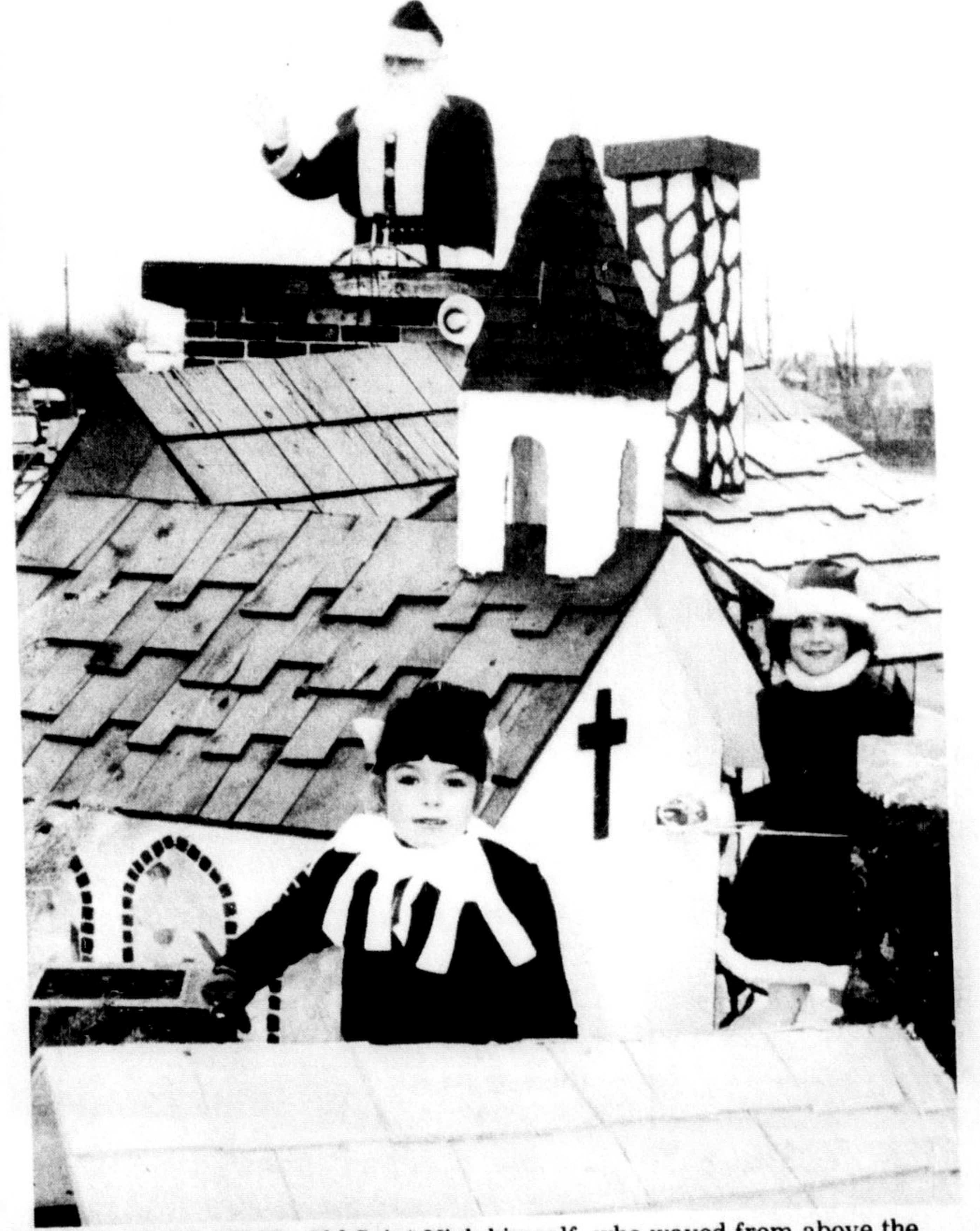
AND HERE HE IS: Old Saint Nick himself, who waved from above the housetops on the big float that ended Saturday's parade.