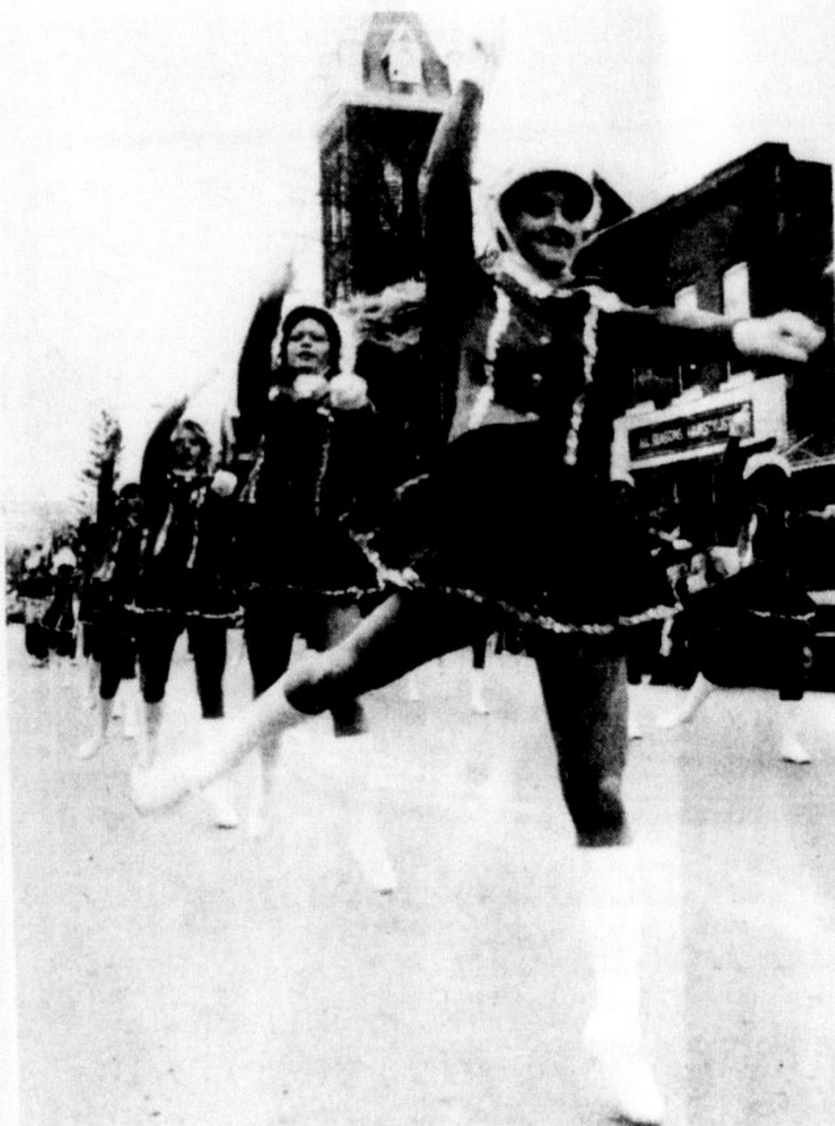
HIGH STEPPING majorettes were featured at the annual Christmas parade through town Saturday. Large crowds lined the streets to welcome Santa and ooh and aah over the bands, floats, clowns and marching groups