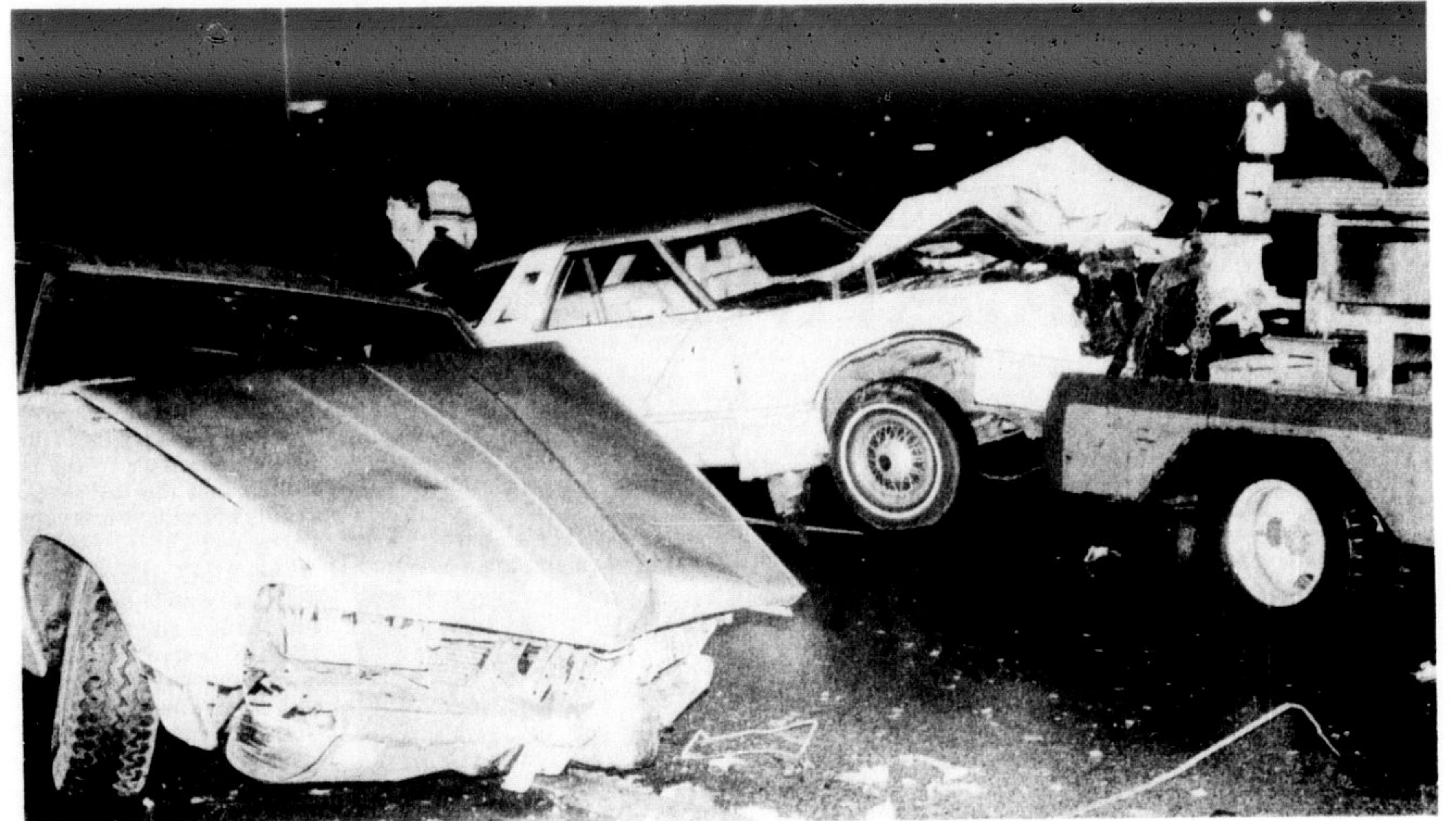
FOUR PEOPLE were rushed to Milton District Hospital following a two-car crash at the intersection of Steeles Ave. and Martin St. Monday.

Zellers ZELLERS MILTON MALL 55 ONTARIO STREET SOUTH 878-8178