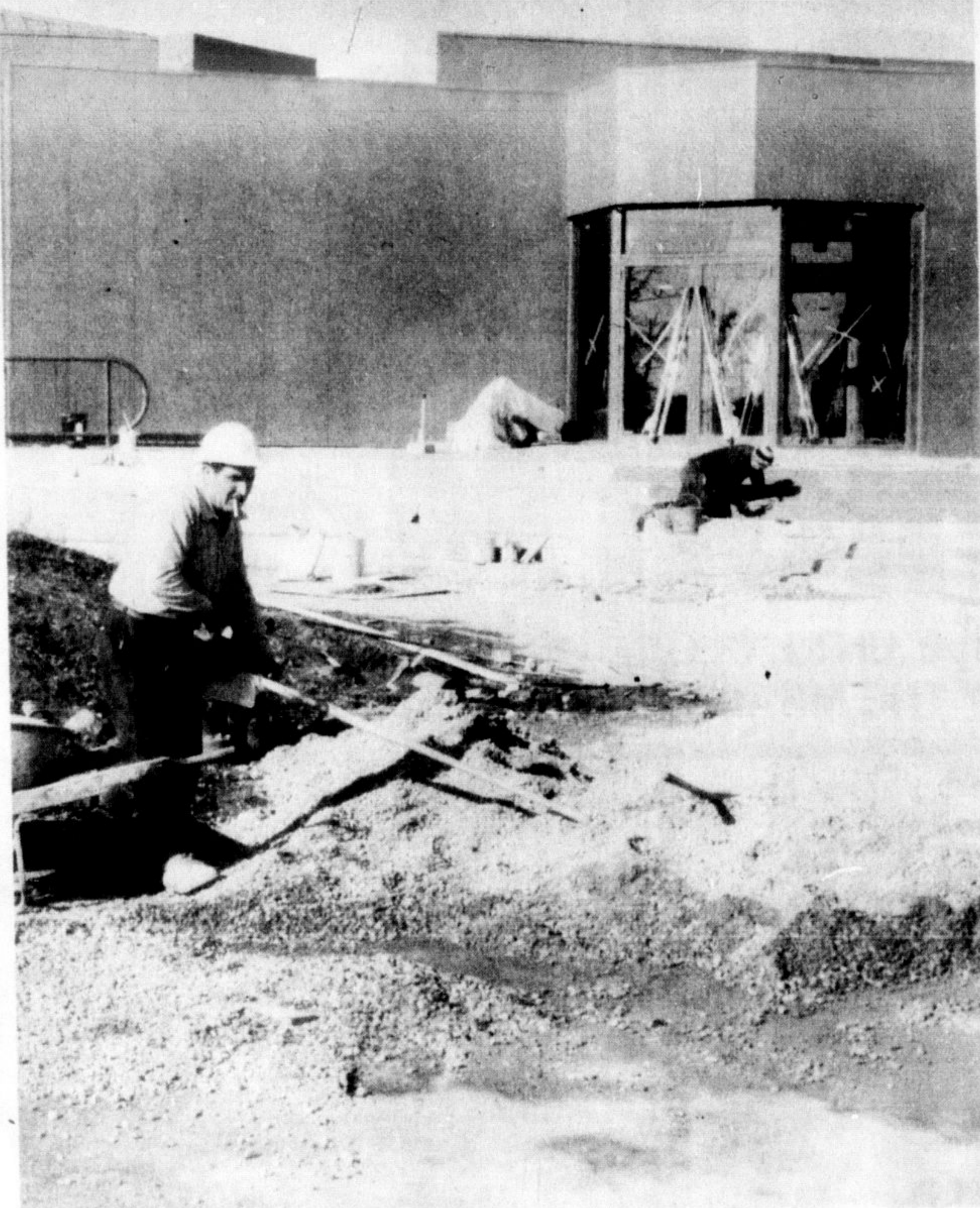
A LOT OF WORK remains to be done at Halton region's new office building, as these workmen testify. Construction debris litters the interior and exterior of the new office. The bright green building is located near the intersection of the Queen Elizabeth Way and Highway 25.